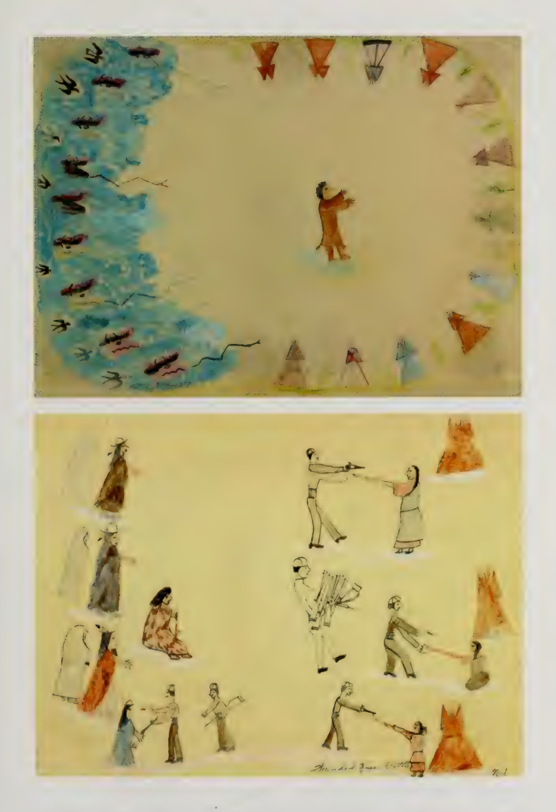
Top: Black Elk teaching his people the use of the Ghost Shirt. See page 187. Bottom: The Battle of Wounded Knee (I). See page 199.