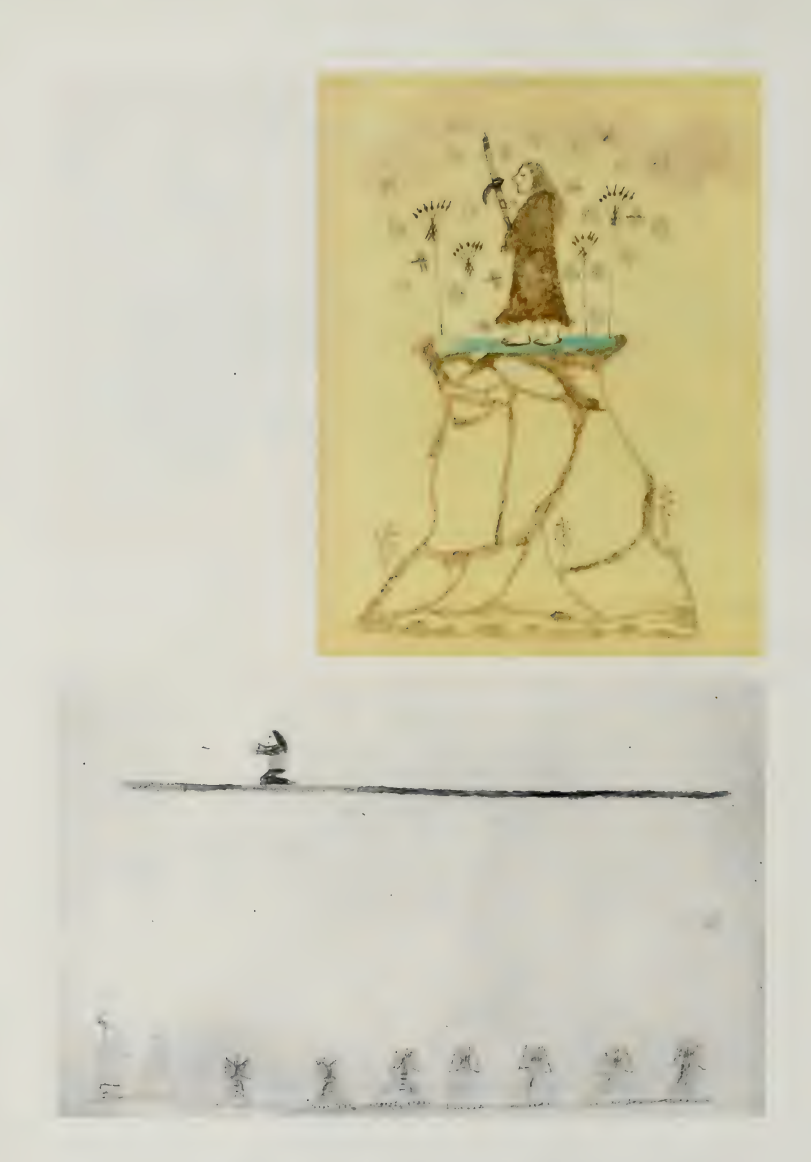
Top: The Dog Vision. See pages 140–41. Bottom: Black Elk's spirit journey to his mother's home. See page 174.