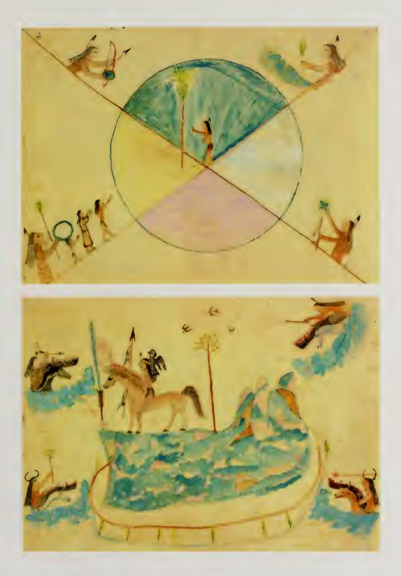
Top: Black Elk under the Tree of Life. See pages 26–27. Bottom: Black Elk at the Center of the Earth. See page 33.