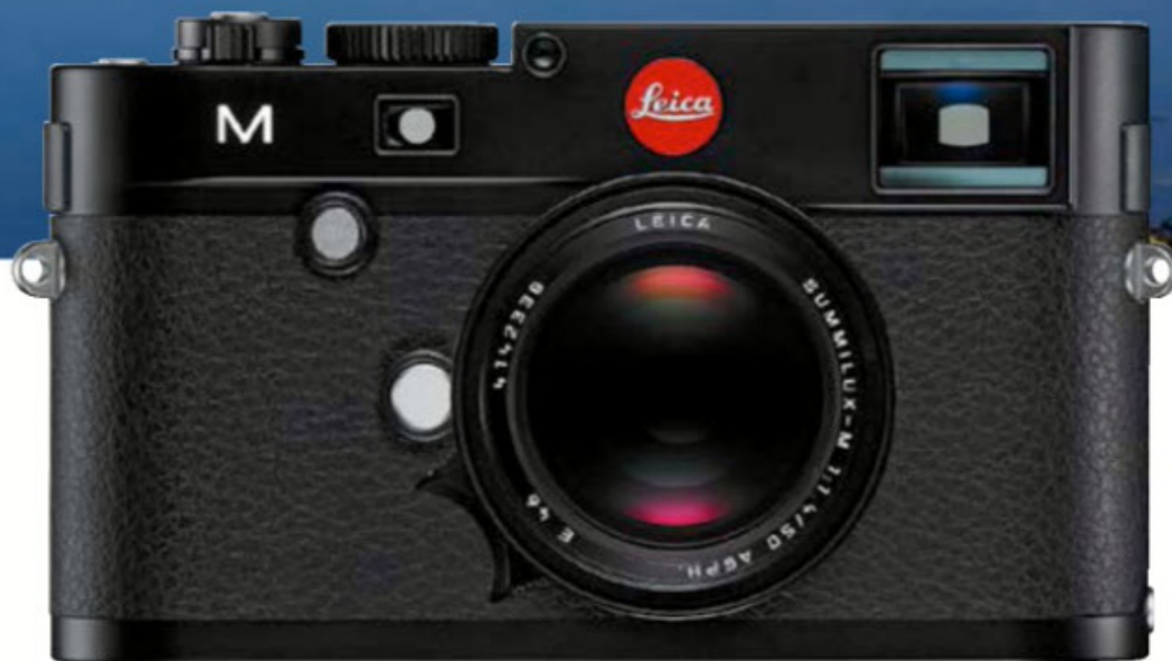
Leica M (Typ 240) available in black chrome finish