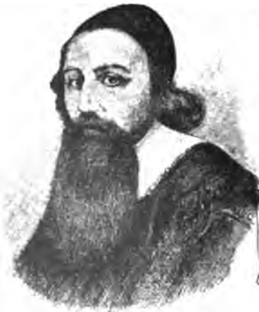
JOHN AMOS KOMENSKY (Comenius).

Many of the exiles sought homes in Germany; some went to Holland, and others to Norway and Sweden. As most of them were very poor, they were obliged to resort to various methods of obtaining a livelihood. The noblemen generally became officers in foreign armies; the educated men became teachers,