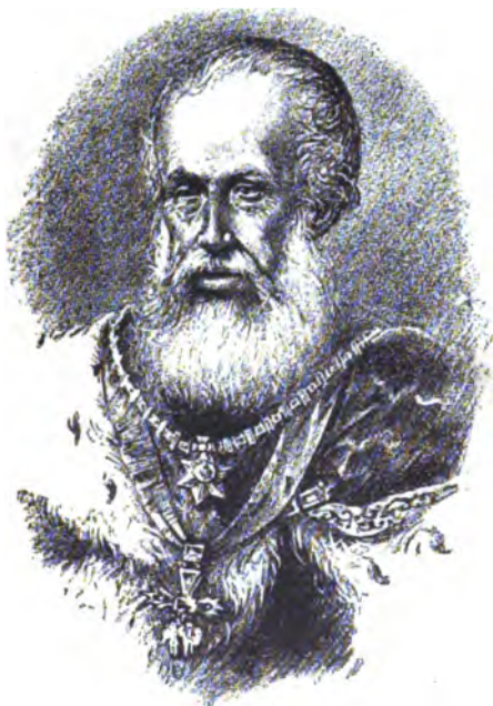
FERDINAND V (The Good).

declared a republic. The news of this Revolution spreading through the countries of Europe, created a great excitement. The people everywhere began to take heart, and to believe that the day of liberty had dawned for all nations. The various rulers, sore pressed,