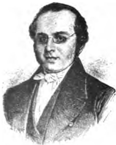
FRANCIS L. ČELAKOVSKÝ.

This enthusiasm for the mother tongue doubtless awakened in many a scholar the desire to devote himself to its cultivation. Thus many authors arose, among whom the most distinguished were Kollár, Erben, Jablonský, and Čelakovsky. Kollár's Slavý dcera (Slava's-Daughter), was the means of awakening much patriotic enthusiasm. Jablonský wrote many