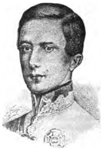
FRANCIS JOSEPH I.

According to the new constitution, the whole empire was to have a Parliament, or Reichsrath, composed of two Houses, the Higher House to be composed of