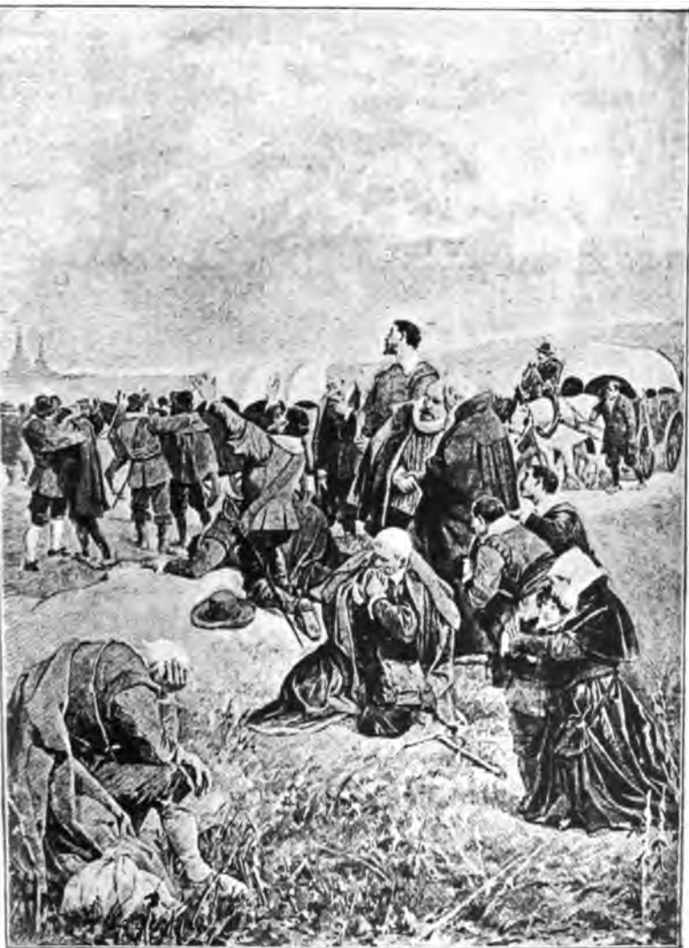
RETURN OF THE BOHEMIAN EXILES.