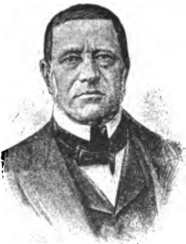
FRANCIS PALACKY, Author of "History of Bohemia."

Musejní (Museum Journal), which is a grand repository of historical researches. In 1831 there was organized a society called Matice Česká (The Čech Mother), whose object is to publish, at cheap rates, books for the people; following this example, the Catholics organized a similar society called Dědictví Svatojanské (St. John's Heritage), their publications being mostly religious books. The government, not being able to withstand the pressure brought to bear upon it both by the people and patriotic statesmen, passed a law ordering that Bohemian should be taught in the gymnasiums, and that no one should be admitted to public office not conversant with the native tongue. This law, however, remained mostly a dead letter; for the officials, being creatures of the government, who knew full well what was desired, saw to it that the German language should remain in use, both in schools and public offices.