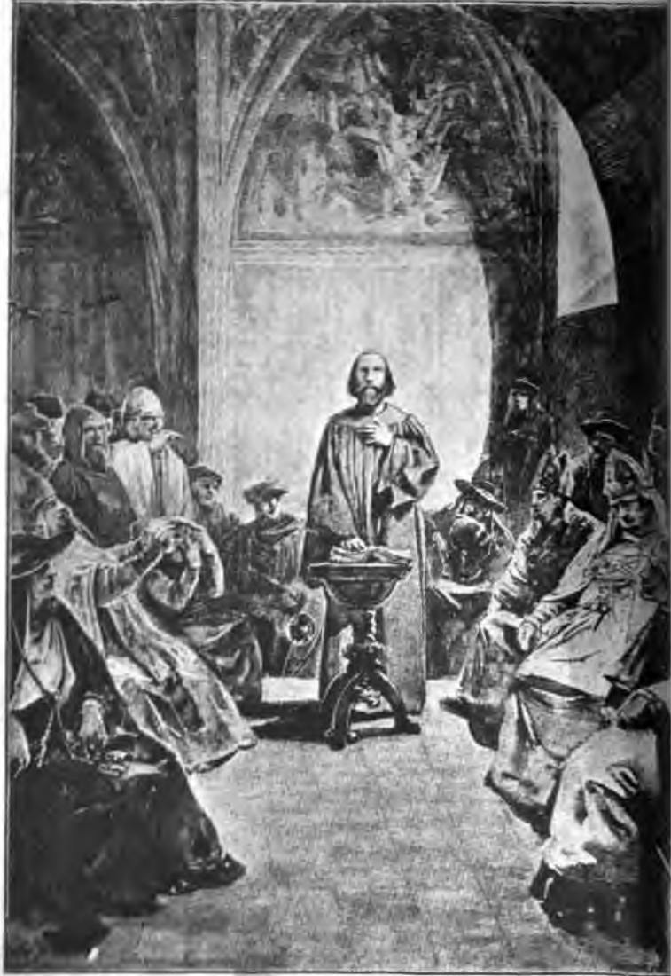
JOHN HUS BEFORE THE COUNCIL OF CONSTANCE.—See Page 169.