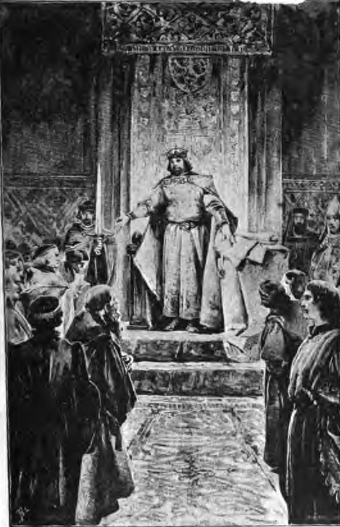
CHARLES IV FOUNDING THE UNIVERSITY OF PRAGUE.