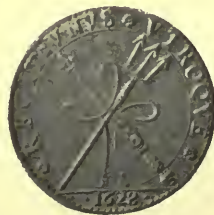
A JETTON OF CHARLES I. BY BRIOT.

The design of the reverses of the two pieces described as Nos. 14 and 16 was borrowed from a jetton of Charles I., the work of Nicholas Briot, viz. :—