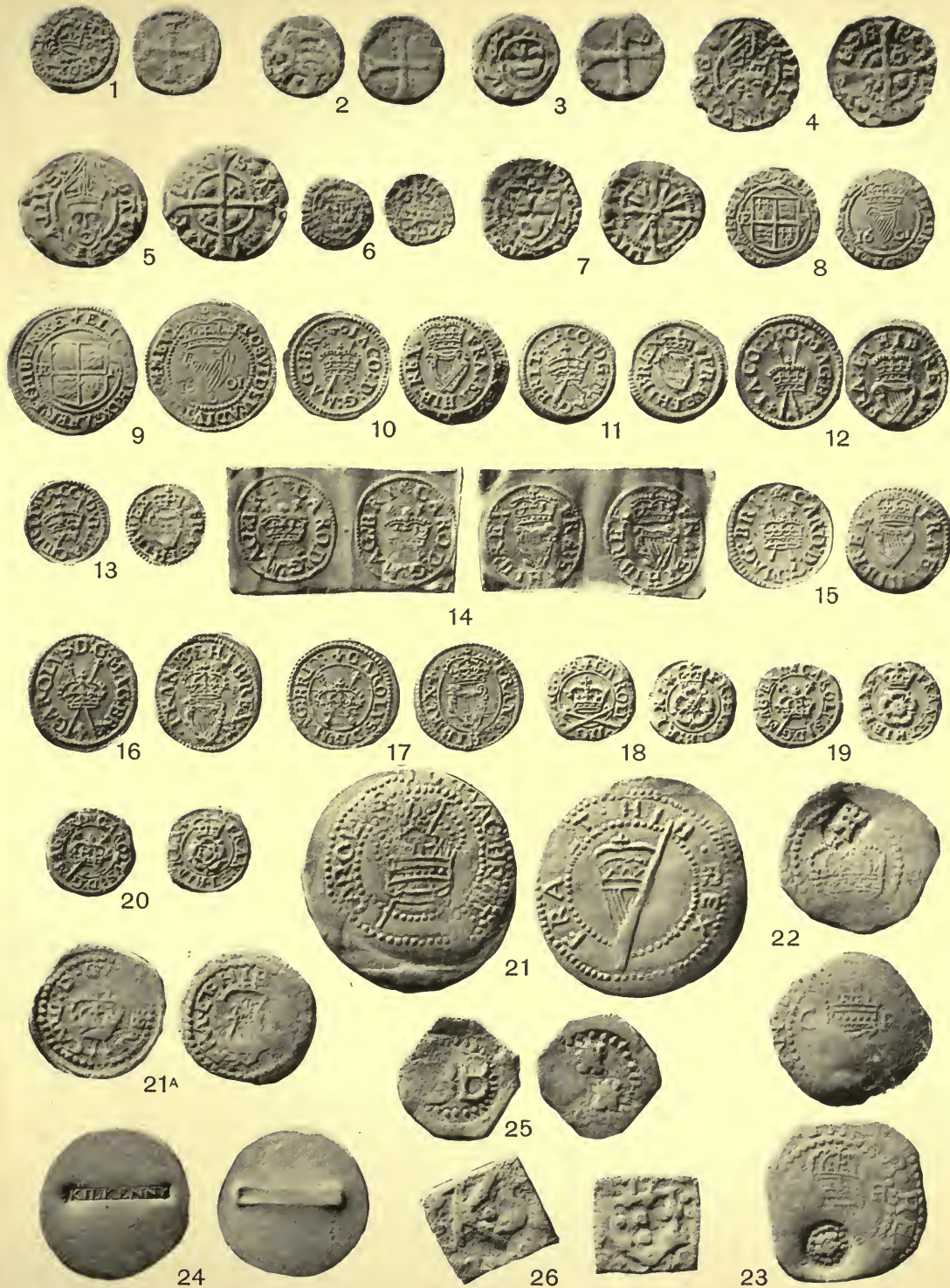
COPPER COINAGE OF IRELAND.