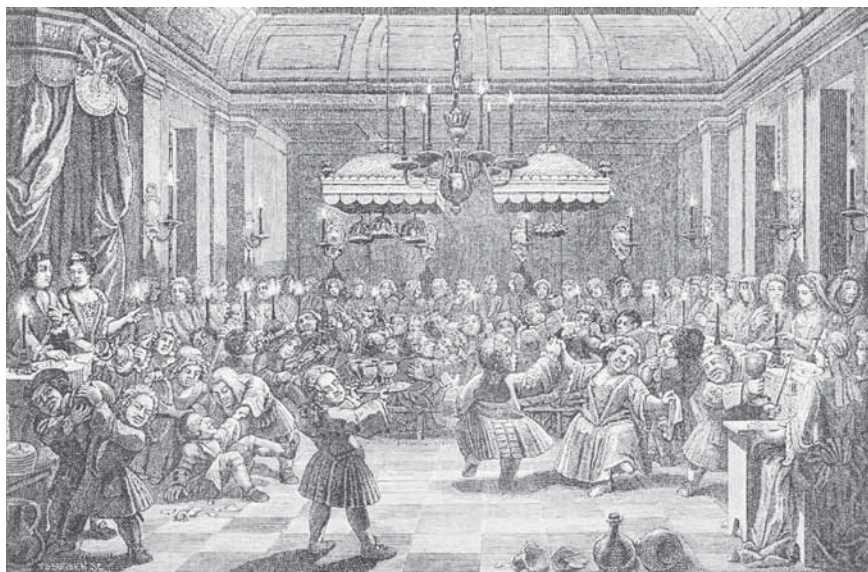
Marriage of dwarfs at the court of Peter the Great.

was then forced to spend their wedding night in a palace on the frozen Neva River, lying naked on a bed of ice wearing ice night-caps and slippers. Such behavior made life at court uncomfortable. Peter's daughter, the Empress Elizabeth, however, conducted her court with much less emphasis on the bizarre and satisfied her taste for the unusual by hosting costume balls that were much more in keeping with the west European culture of her day. Catherine II's court was a model of European sophistication.