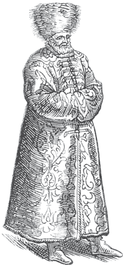
Muscovite ambassador in the time of Ivan IV.

at all levels continued to use their positions to exploit the weak and to build up their own fortunes and power without regard to their duties. It is important to remember, however, that this state of affairs was not confined to Russia. Europe in the eighteenth century was similar—the further away one was in status or location from the ruler, the less access one had to justice of any kind. Peter's government retained remnants of the old Muscovite ways, but by the end of his reign, he had created a state that was on a par with the other monarchies of Europe and that had the foundations of a modern bureaucracy.