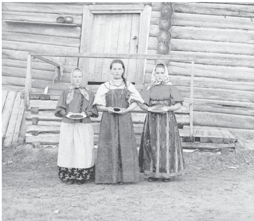
Peasant girls ( Krest'ianskīia dievushki ), Russian empire, early twentieth century. Library of Congress, Prints & Photographs Division, Prokudin-Gorskii Collection, LC-DIG-ppmsc-03954.

followed the changes in fashion in Paris, becoming more ornate and cumbersome in mid-century when hoopskirts and tight corsets were in vogue and giving way to a sleeker silhouette by the end of the century. Merchant women wore an interesting combination of Western fashion and traditional Russian hairstyles and headdresses. Working women favored simpler costumes, often wearing a simple sarafan with a matching blouse or a plain calico skirt. 9 Peasants, who constituted the vast majority of Russians, continued to dress in their traditional manner throughout the imperial period.