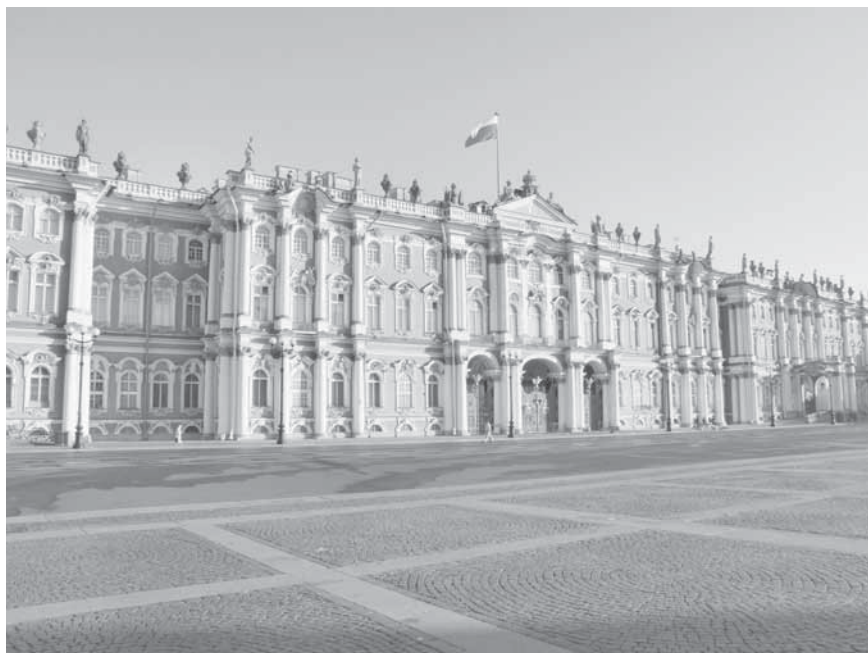
The Hermitage (The Winter Palace in St. Petersburg).

furniture and decorations led to the development of the decorative arts in Russia, particularly during the reign of Catherine II. By the end of the eighteenth century, the elite sections of the capitals closely resembled the elite neighborhoods of other European cities, with wide boulevards, well-tended English-style gardens, and huge mansions that could not only provide room for entertaining but also house a bevy of serf servants to run the household. The very wealthy nobility also built large mansions in the countryside, complete with extensive gardens.