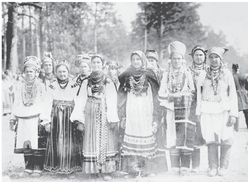
Russian peasant girls in holiday attire, early twentieth century.

symbolized prosperity. Fur coats, guaranteeing wealth and frightening evil spirits, and straw mattresses, promising an easy childbirth, were brought. Then the bride rode to the wedding ceremony and walked over fur rugs into the sanctuary. After a mass, the couple joined hands and exchanged rings; the priests placed wedding crowns on their heads, blessed them with incense, and prayed for a peaceful, long life with children and grandchildren. The wedding party then moved to the groom's house, shouting and cracking whips the whole way to ward off evil spirits. After being greeted with salt and bread for prosperity and happiness, the couple walked on fur rugs while being showered with coins, grain, and hops. The rest of the day was filled with traditional games to determine who would be the boss in the house—the first over the threshold, the first to break a wine goblet. The wedding feast consisted of kasha, pies, cold meat, and a chicken divided between the bride and groom; only the groom and his guests could drink alcohol. After the feast, the couple was escorted to the marriage bed made of straw mattresses, which were supposed to ease the bride's pain when the hymen broke. The Church levied fines against women who lost their virginity before