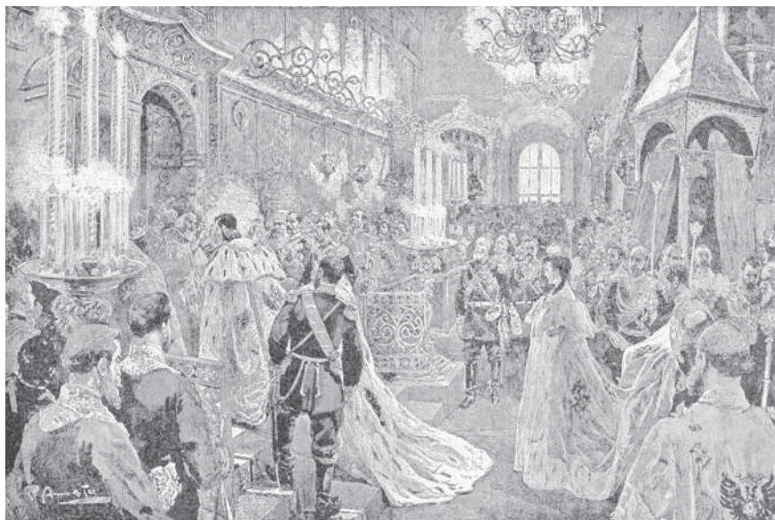
Coronation of Nicholas II.

in any real sharing of power—the emperor was still sovereign, and the Duma, such as it was, continued to be dominated by the elites. Russia was ruled by an emperor devoted to his position as divinely ordained autocrat and determined to maintain that position regardless of the changes occurring all around him. The industrial sector of the economy was growing but was severely hampered by the economic drag of peasant agriculture, which kept many potential workers in the countryside and did not produce enough to both feed the population and provide export grain for capital development, and showed little inclination to change. Revolutionary movements and liberal philosophy posed a challenge to the intellectual hegemony of Orthodoxy, but the vast majority of Russians knew little of these new ideas and heartily feared what they did know about them. Most Russians, both urban and rural, continued to adhere to Orthodoxy, and the Church continued to dominate in areas of family law and governance. For the vast majority of Russians, life had changed little since the days of Peter the Great, except perhaps to become more difficult as rising prices and an increasing population strained the subsistence economy of the countryside. When war broke out, nationalism surged in Russia as it did in all of the belligerent nations, but it did not last long in the face of an economic and