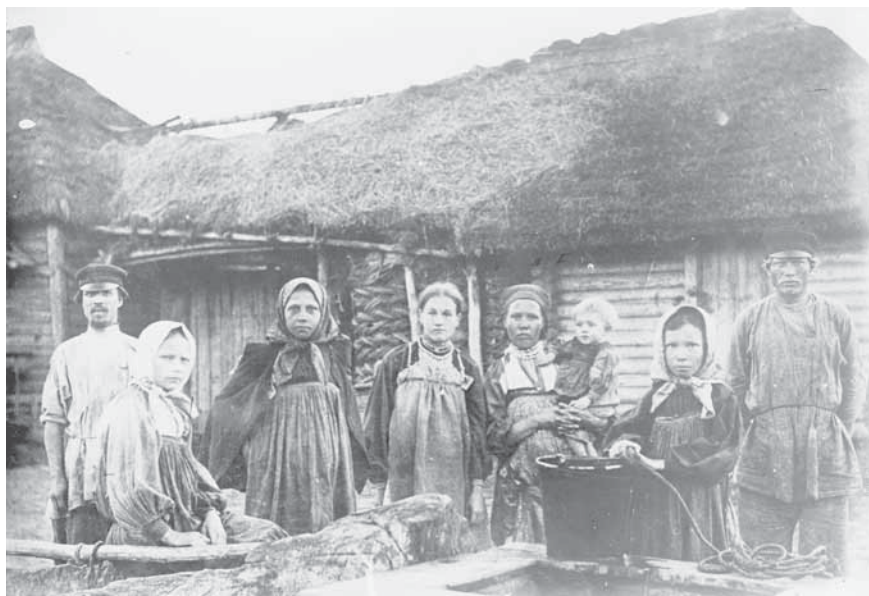
Russian peasants outside a peasant home, early twentieth century.

Daily life changed for almost all of Russia in the eighteenth century. Peter I wanted to transform noble life and enacted reforms specifically to do so; throughout the rest of the eighteenth century, his cultural and social as well as political and military reforms continued to shape the nobility into a reasonable facsimile of European nobility. The changes for other levels of society were more a by-product of reforms directed at other issues than a desire to change them. Although daily activities did not change much for the peasantry during the eighteenth century, their obligations to state and landlord rose enough to have a clear impact on their quality of life. The most striking change was the division in culture between the urban and gentry elite and the rest of the population. As the elite adopted Western dress, education, culture, and entertainments, the vast majority of the Russian population continued to follow Russian traditional practices in their dress, diet, rituals, and attitudes. The gap that this created in Russian society is sometimes overstated, but it contributed substantially to the social problems that emerged in the nineteenth century.