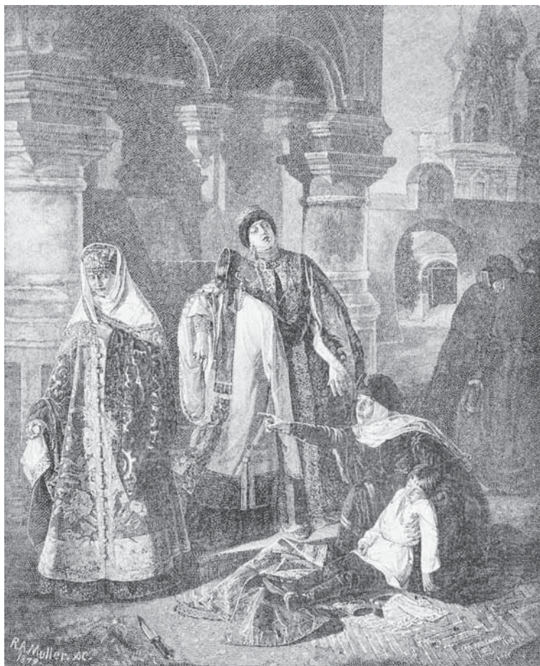
Murder of Dmitrii, son of Ivan IV (the Terrible).

The problems of dynastic succession and legitimacy were at the heart of the Time of Troubles. When Fedor died, Boris managed to get the throne through a series of intelligent political maneuvers and because the boyars could not agree which among them should lead the next dynasty and eventually had to acknowledge Boris as the next tsar of Russia. Boris was crowned in 1598. One could make the argument that Boris had more authority while he was Fedor's advisor because after he was crowned, he could not command the same kind of loyalty from the Russian people that the Rurikid dynasty had claimed. The problem of legitimacy would