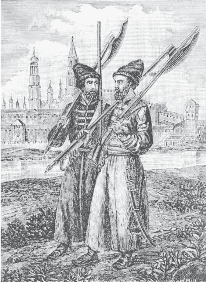
Russian palace guards, or Streltsi, of the 1600s.

then on continued to be a source of discontent throughout Russia. Sophia died in 1704 in her convent, ending her days isolated from all contact with her female relatives and friends.