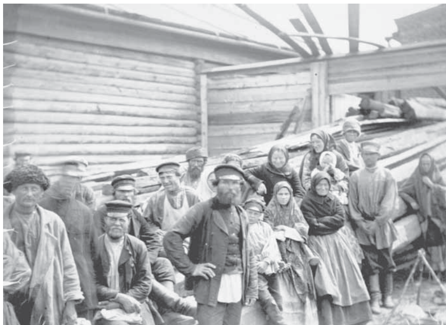
Laborers awaiting work at the Hill of Idleness. Types of Russian working people at Tumen (i.e., Tiumen), early twentieth century.