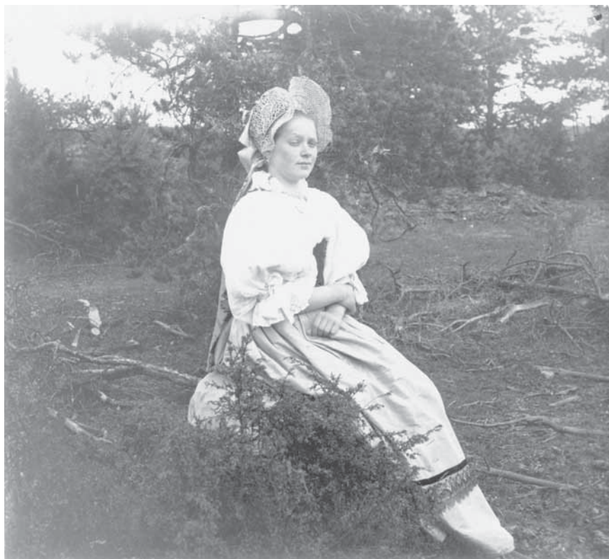
Antique dress of a peasant woman from Olonetskaia Province (Starinnyi kostium krest'ianki Olonetskoi gub).

crown. Wealthy ladies would decorate the front of their headbands with jewels. Wealthy men wore leather boots dyed in bright colors or low leather shoes. Wealthy men and women wore jewelry, particularly belts, which were the most important accessory for men, decorated with gold and silver or jewels. Women wore necklaces and earrings made of silver, gold, or pearls.