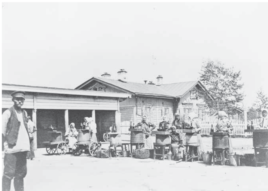
Peasants selling bread, milk, eggs, and so on, early twentieth century.

the poll tax and conscription. The meshchanstvo considered themselves a cut above the peasantry, but the new laws did not make this distinction. At the high end of urban society, those wealthy merchants who were exempt from taxes and conscription by virtue of their service to the state still bore the stigma of trade. The gentry closely guarded their ranks and regarded even the wealthiest merchants as tradesmen, lower on the social scale. Those few very successful merchants who could work their way into nobility, either by educating their sons and sending them into state service or by obtaining a grant of nobility from the emperor, could escape the stigma, but these routes to nobility became increasingly difficult to follow as the century wore on. In Catherine's Charter to the Nobility, she affirmed the nobility's exclusive right to own populated estates, which not only emphasized the nobility's higher privileges but also made it very difficult for the non-noble urban population to get labor; this would have a profound impact on Russia's ability to industrialize in the next century. Catherine also permitted anyone to engage in trade, believing that this would strengthen the economy. For the urban population, however, it seemed to give