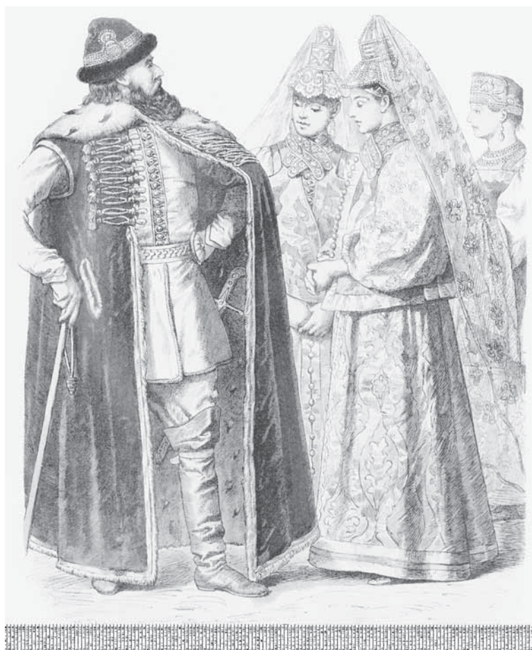
Russian noble and ladies in summer dress, 1700s.

dark green, and the artillery units wore dark red. 8 For women, Peter introduced Western-style dress with corsets, bare arms, low necklines, and uncovered hair dressed in elaborate coiffures. In order to enforce his changes in dress, Peter instituted taxes on beards and on traditional clothing among the elite and for all who lived in or entered towns. These were radical changes for the upper class because the new costumes for men and women were designed to display the figure rather than to conceal it, but these changes were limited to the aristocracy and to the urban population. In the late nineteenth and early twentieth centuries, more people adopted Western-style dress, particularly in the cities, and these fashions