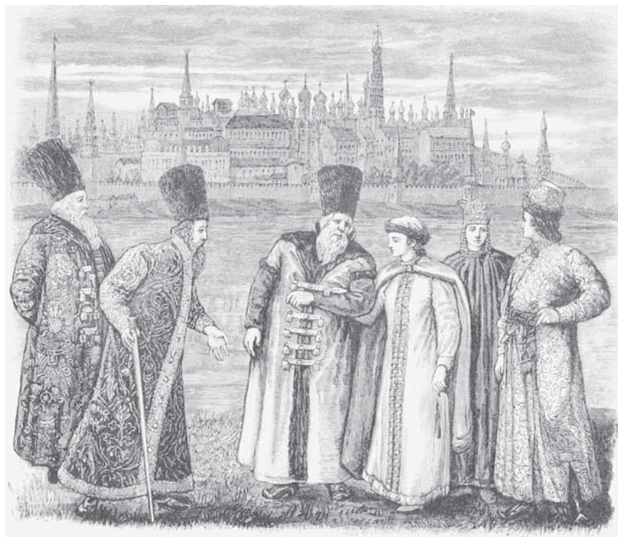
A group of Russian nobles called boyars, the Kremlin in the background, 1600s.

Western observers were particularly shocked by the practice of blackening the teeth. It is not clear why women blackened their teeth, but it is not unlikely that it was to conceal discolorations and rot. Russian women did not wear corsets under their voluminous dresses—thinness was seen as a sign of ill-health and not valued—so foreign observers often commented that Russian women were fat, even though they could not have known how heavy women were under their loose clothing.