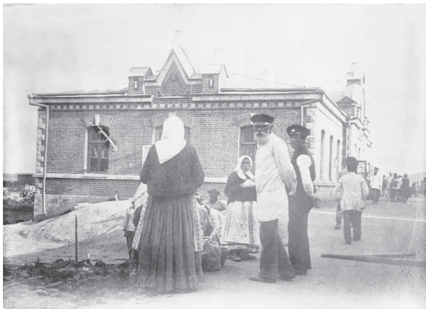
Russian peasants, early twentieth century.

collect monetary payments, or obrok , from them. Many landlords required a combination of barshchina and obrok from their serfs.