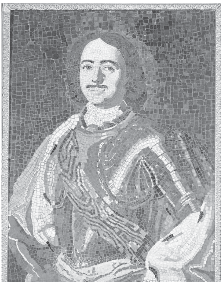
Tsar Peter the Great, 1775.

Without question, Peter I, better known as Peter the Great, had a profound impact on the development of Russia. He transformed Russia from an obscure kingdom on the edge of Europe into one of the major powers in European diplomacy. He forced the upper classes to abandon their traditional notions of honor, piety, and