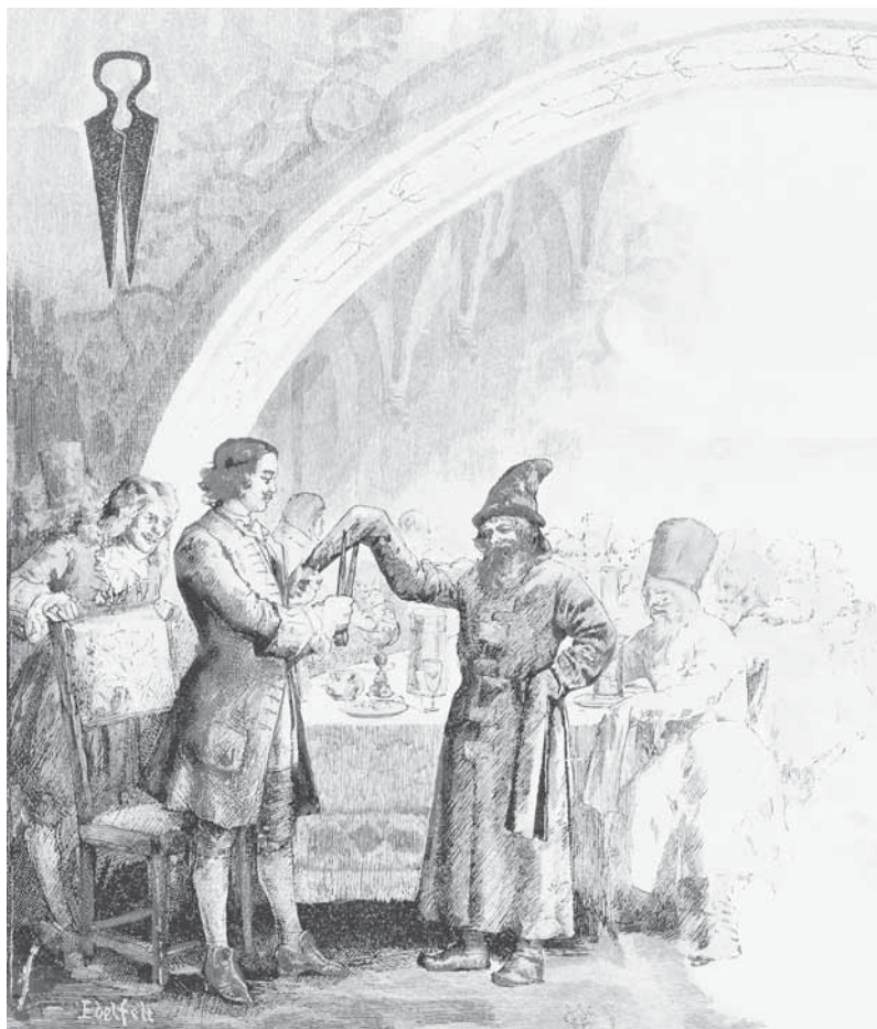
Tzar Peter I cutting the long sleeves of the boyars symbolically reducing the nobles' power.

For boyars, caftans often included very long sleeves that kept hands warm but that also made working with their hands difficult. Boyars also wore high hats and long robes that Peter also believed inhibited movement and restricted their ability to work. As soon as he returned from his Grand Embassy, Peter immediately began to cut off boyars' beards and to insist that the Russian elite adopt Western clothing; for men this meant a uniform in the Western style—a three-cornered hat, knee-breeches, waistcoat, and tunic. Peter attempted to color-coordinate his army regiments, but this proved nearly impossible to achieve during his reign, although the elite units had designated colors: the Semenovskys wore dark blue, the Preobrazhenskys wore