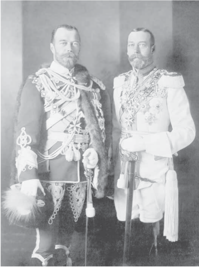
George V, king of the United Kingdom (left), and Nicholas II, ca. 1913.