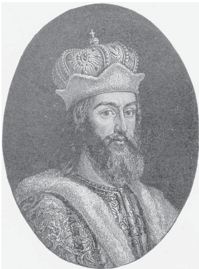
Vladimir I, Grand Prince of Kiev.

is the joy of the Russes. We cannot exist without that pleasure.' " He listened to the Catholic delegation but refused their notions of fasting as well, saying, "Our fathers accepted no such principle." Vladimir rejected the Jewish faith on the grounds that "If God loved you and your faith, you would not be thus dispersed in foreign lands." He was more accepting of the Orthodox emissaries, saying, "Their words were artful and it was wondrous to listen and pleasant to hear them." Finally he sent his own emissaries to investigate the various faiths. After denigrating the other three faiths, the emissaries reported their experience in the Greek Church: "[While there] we knew not whether we were in heaven or on earth. For on earth