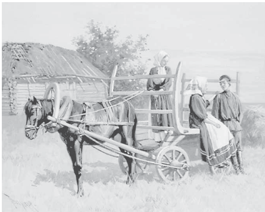
Peasants sitting on cart, early twentieth century.

hundreds of years. For these reasons, Russian agriculture remained highly labor-intensive and changed little after the fifteenth century; the agricultural revolution that preceded the industrial revolution in the rest of Europe did not affect Russia. No revolution occurred, in fact, until Stalin forced collectivized agriculture on the peasants in the 1930s.