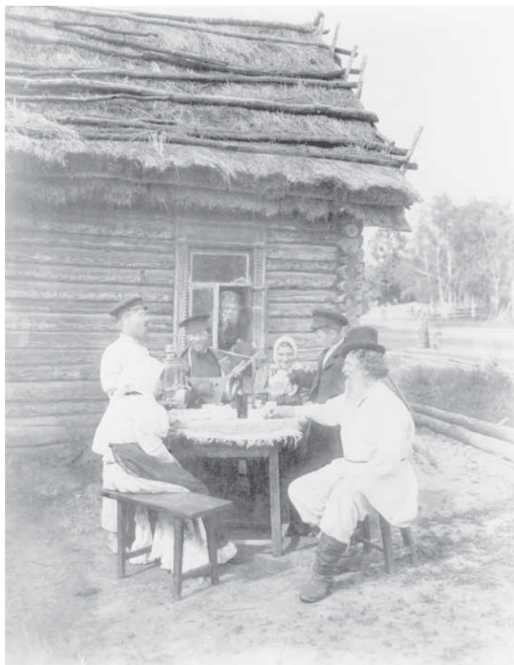
Group of Russian peasants posed at an outdoor table with samovar and balalaika, early twentieth century.

but the most powerful men in the commune would protect their own families from the draft and would use exemption from conscription as a patronage or extortion mechanism. Although some landlords took a more active role in governing their serfs, villages usually took care of their own internal disputes and dispensed rough justice against those who broke laws or transgressed village tradition, and the commune could manipulate these aspects of village government as well. People who challenged the authority of the commune or who questioned its decisions could be disciplined, even exiled to Siberia if they presented enough of a threat