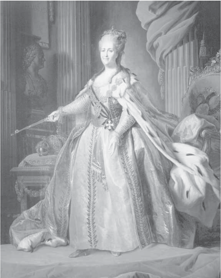
Catherine II (1762–1796) of Russia in Coronation Robe, 1770.

Catherine II, also known as Catherine the Great, completed many of Peter the Great's reforms. Whereas Peter had used brute force to wrench Russia out of her traditional ways and place her on the path of westernization and modernization, Catherine worked with the nobility to introduce the more sophisticated aspects of Western culture and learning into Russia and to further expand Russia's influence in Europe. However, like Peter before her, Catherine did nothing to improve the lives of the vast majority of Russian