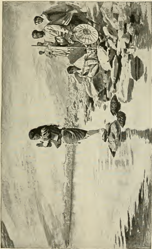
THE LEADER OF A PILGRIM BAND BLESSING THE HOLY WATER