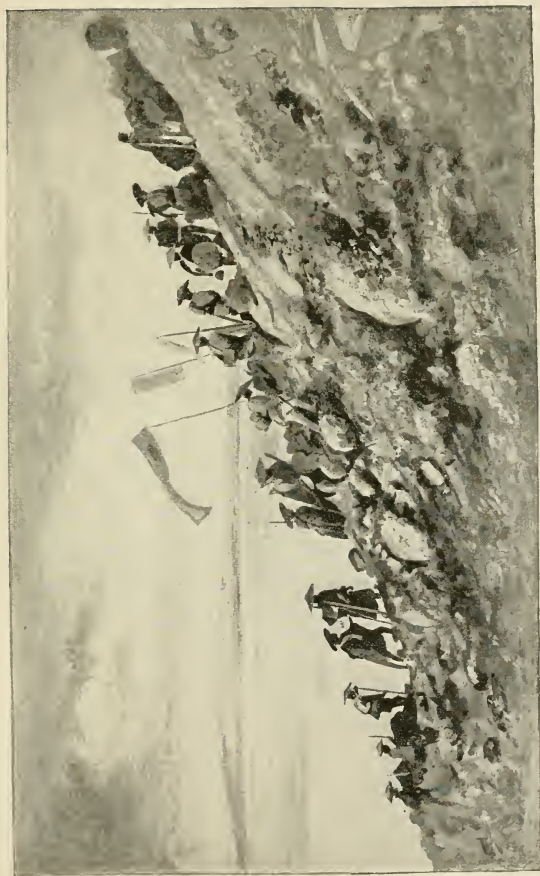
A PILGRIM CLUB ASCENDING ONTAKÉ