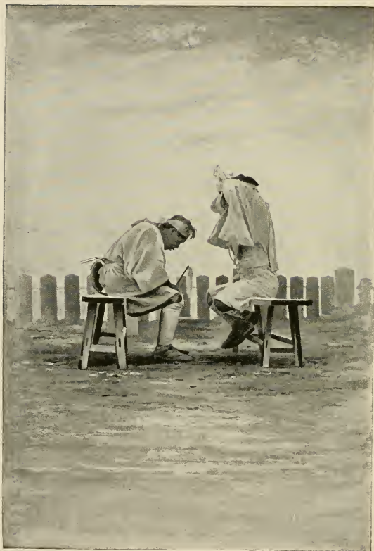
A POSSESSION BY THE GODS UPON ONTAKÉ. Page 6