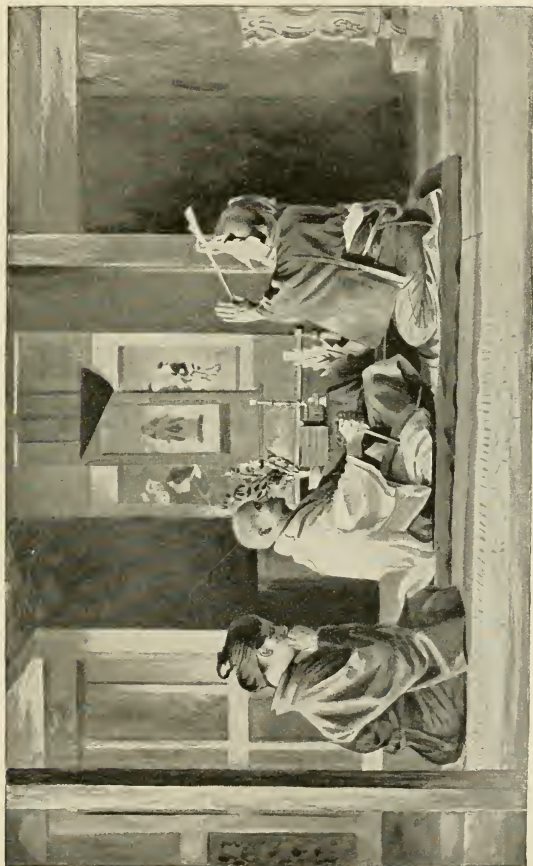
A BUDDHIST DIVINE POSSESSION