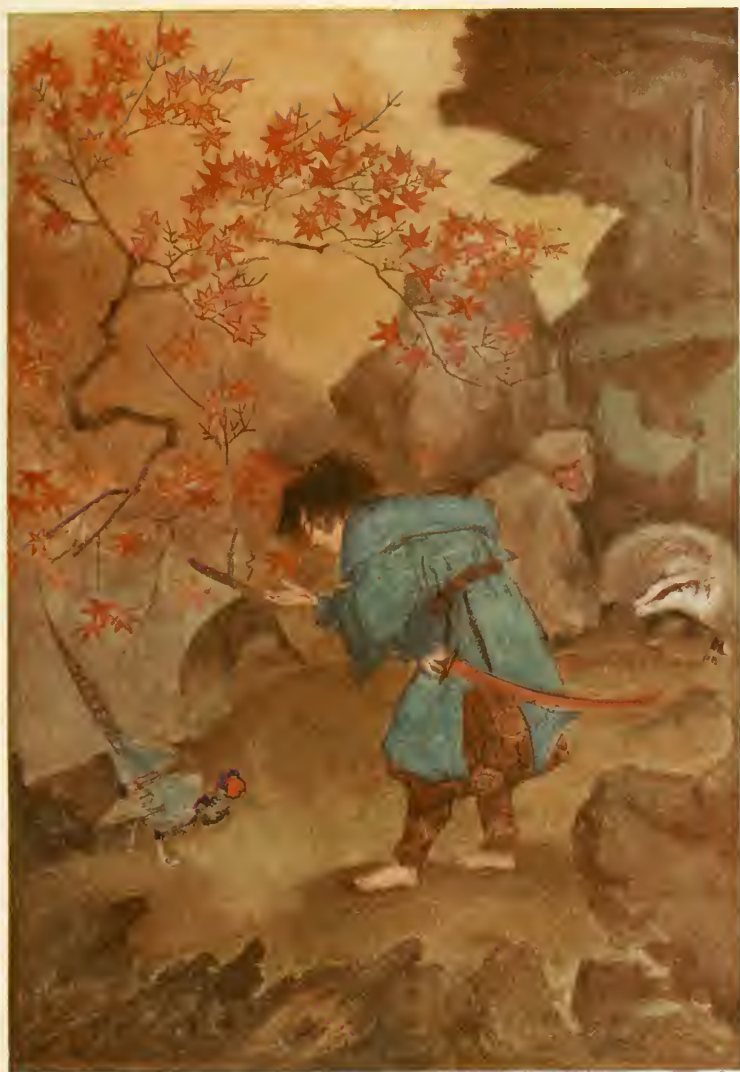
Momotaro and the Pheasant.