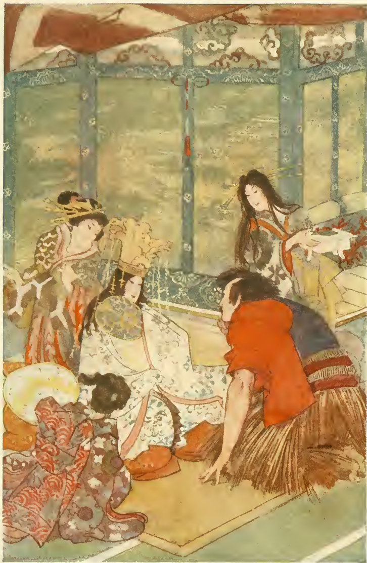
Urashima and the Sea King's Daughter