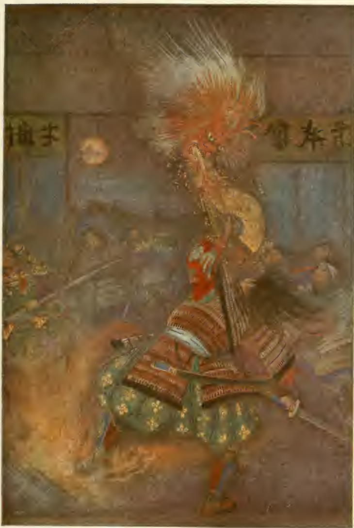
Raiko slays the Goblin of Oyeyama.