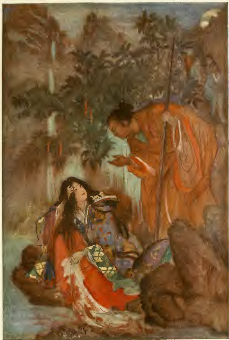
Raiko and the Enchanted Maiden.