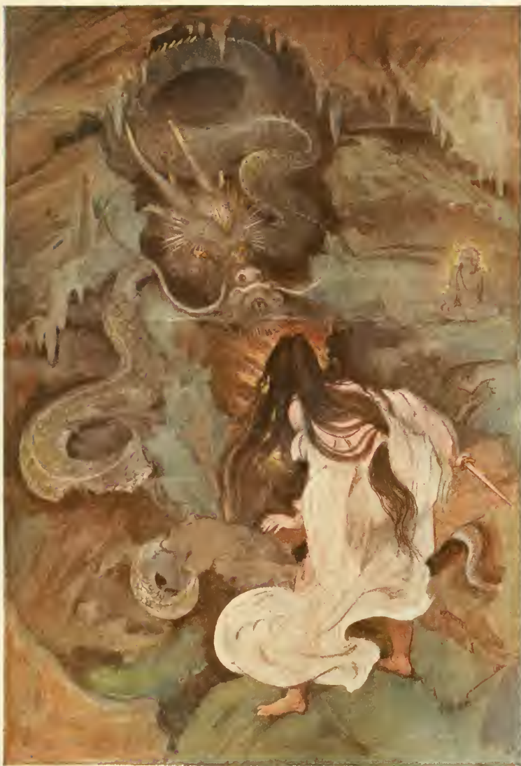
Tokoyo and the Sea Serpent.