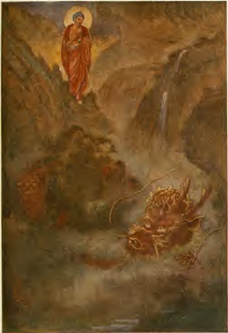
Buddha and the Dragon.