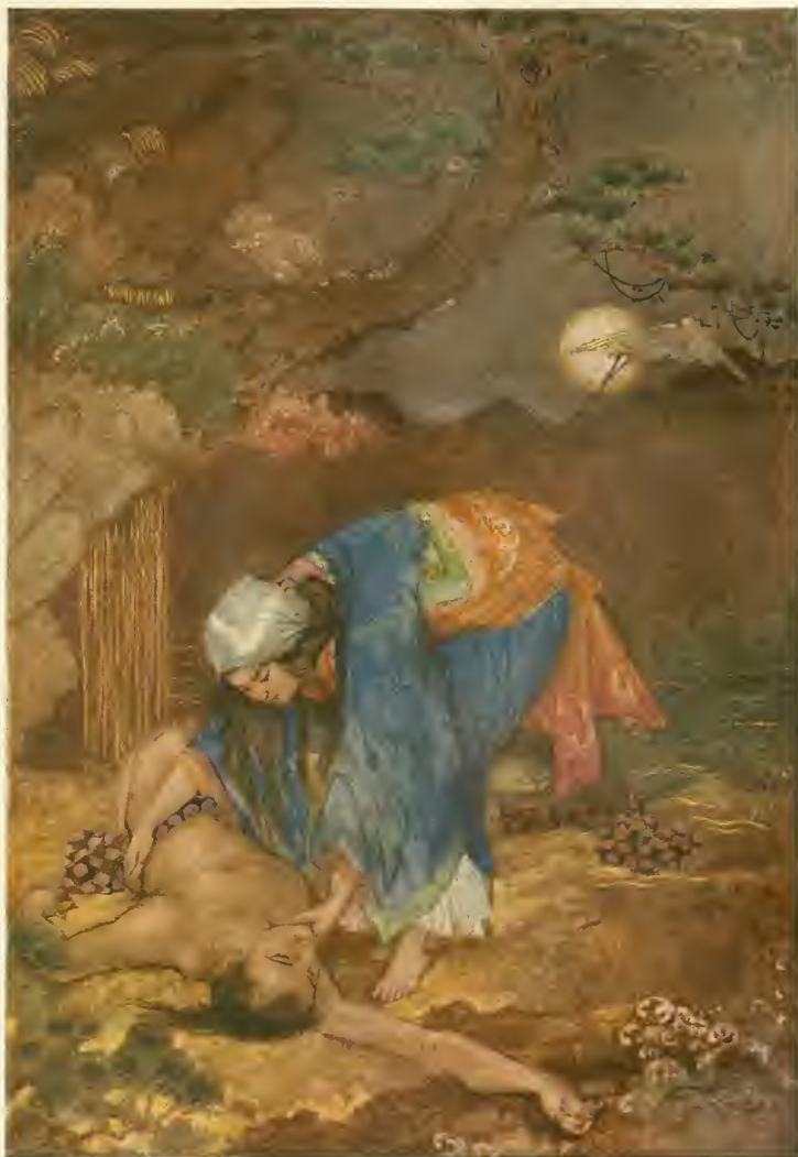
Matsue rescues Teoyo.