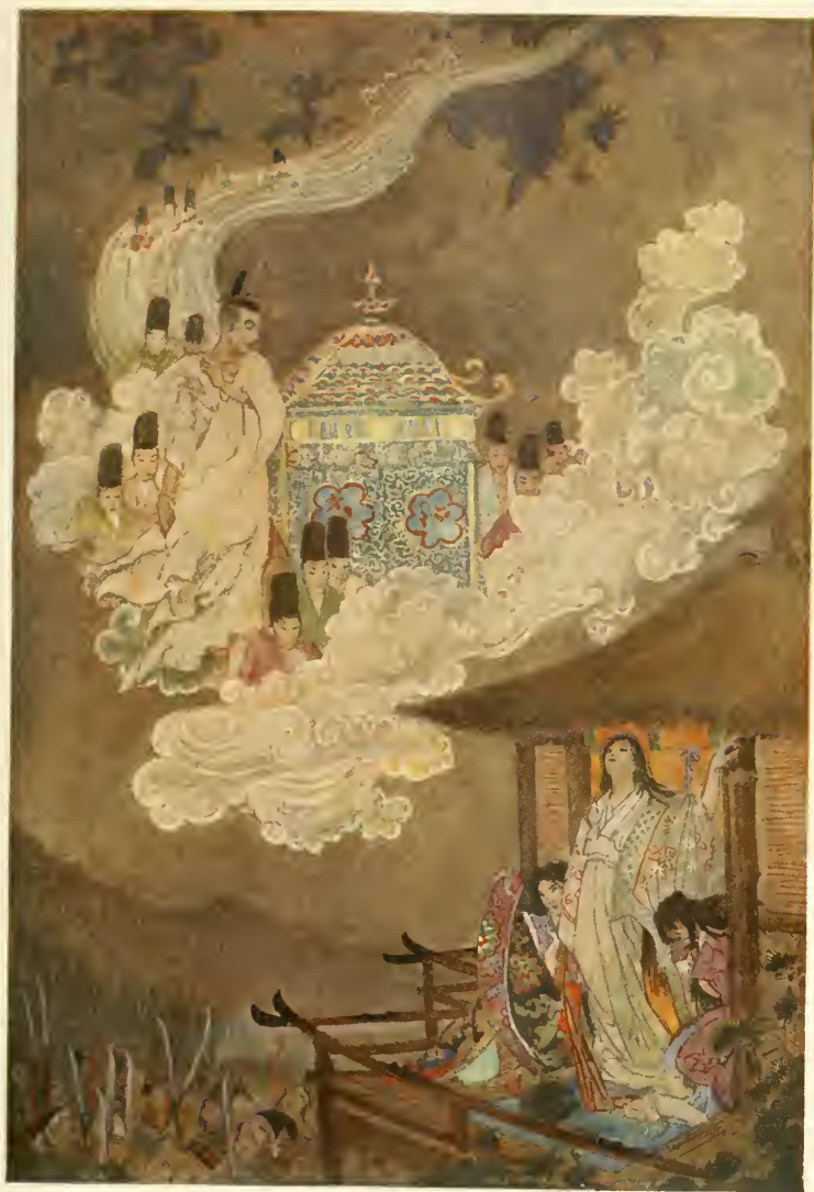
The Moonfolk demand the Lady Kaguya.