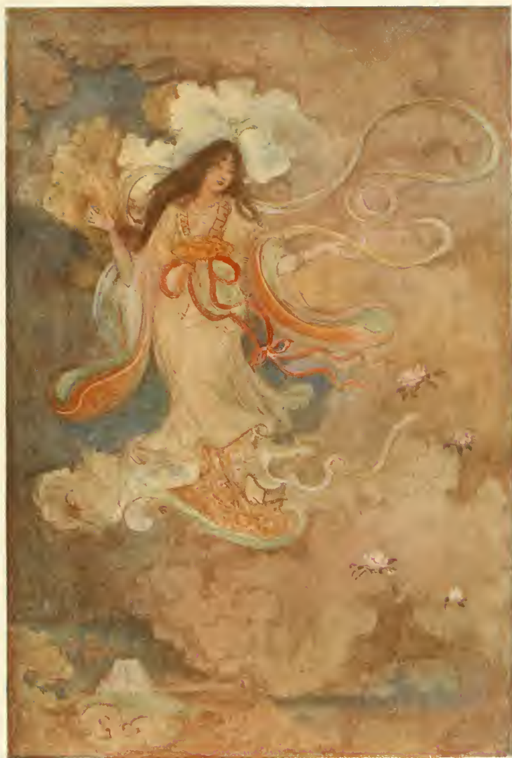
Sengen, the Goddess of Mount Fuji.