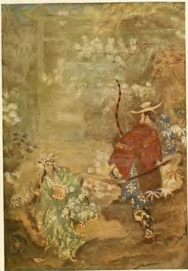
Hoori and the Sea God's Daughter.