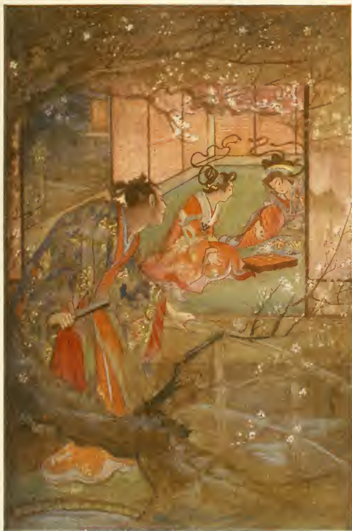
Kato Sayemon in his Palace of the Shōgun Ashikaga. 370