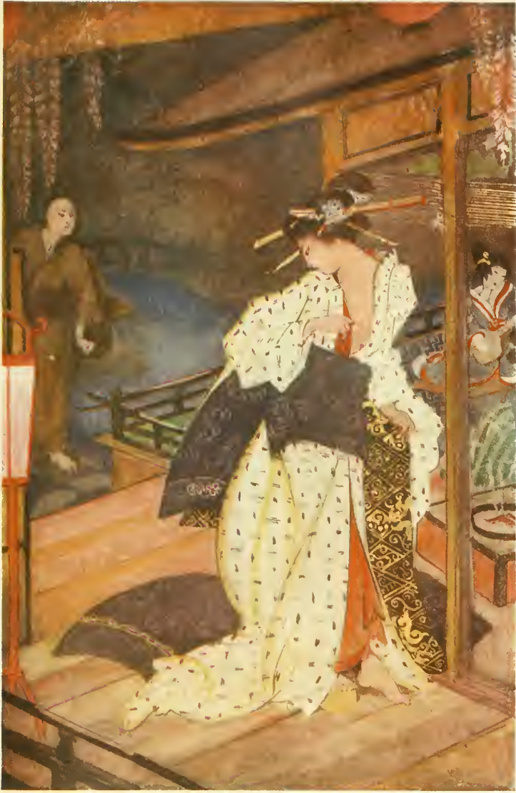
Kiyo and the Priest.