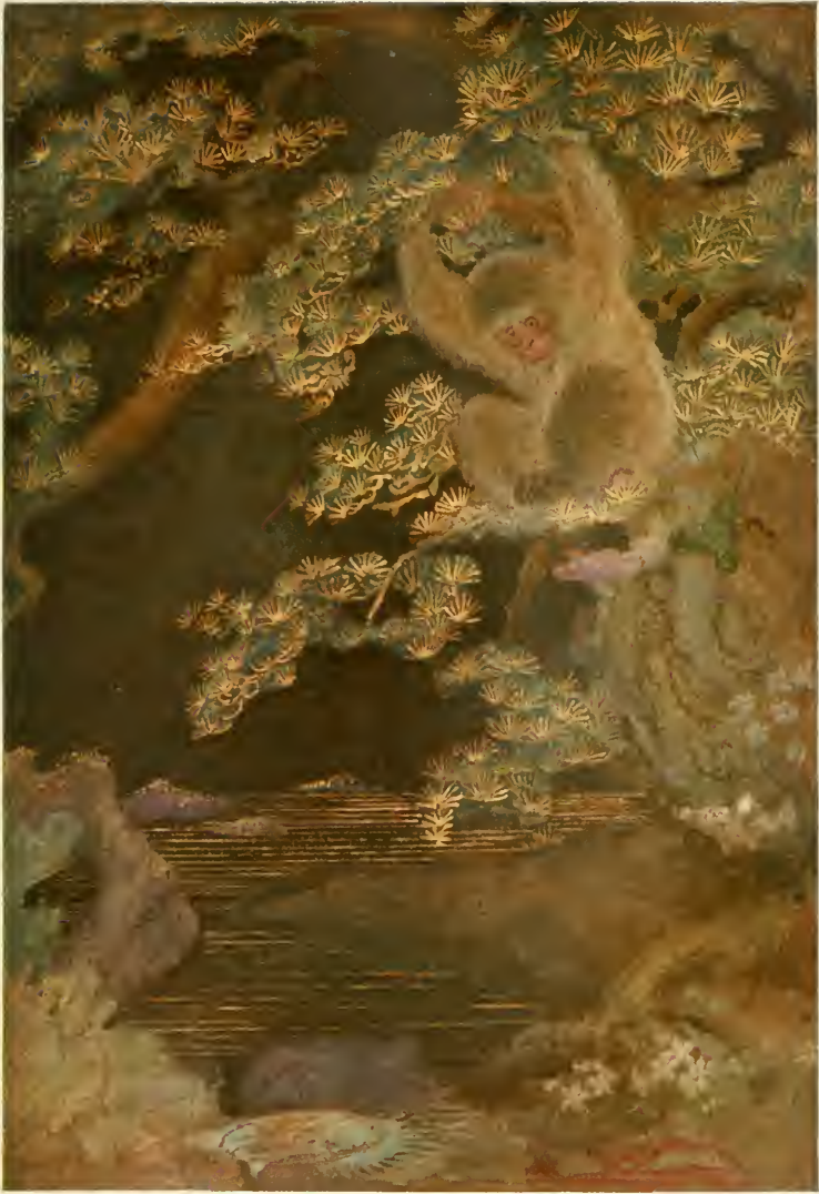
The Jelly Fish and the Monkey.