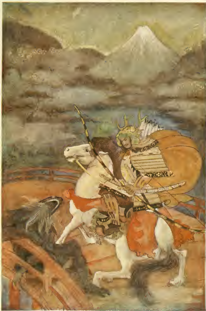
Tōtarō and Samébito.