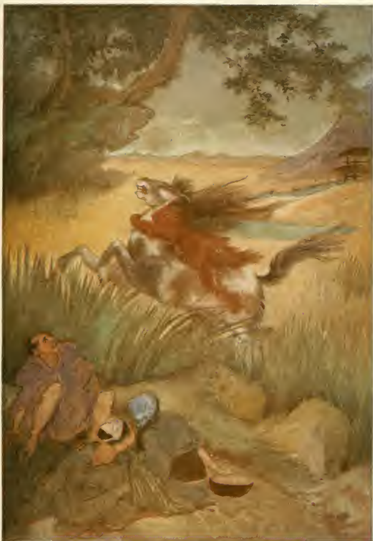
The Kappa and his Victim.