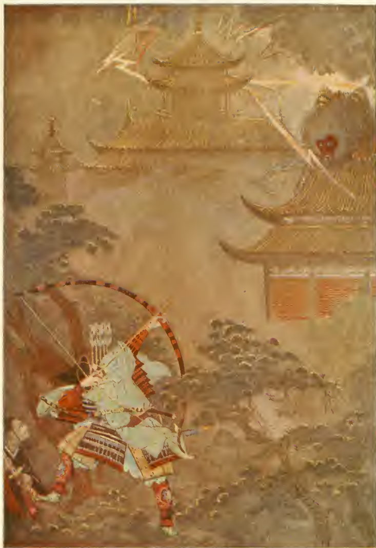
Yorimasa slays the Vampire.