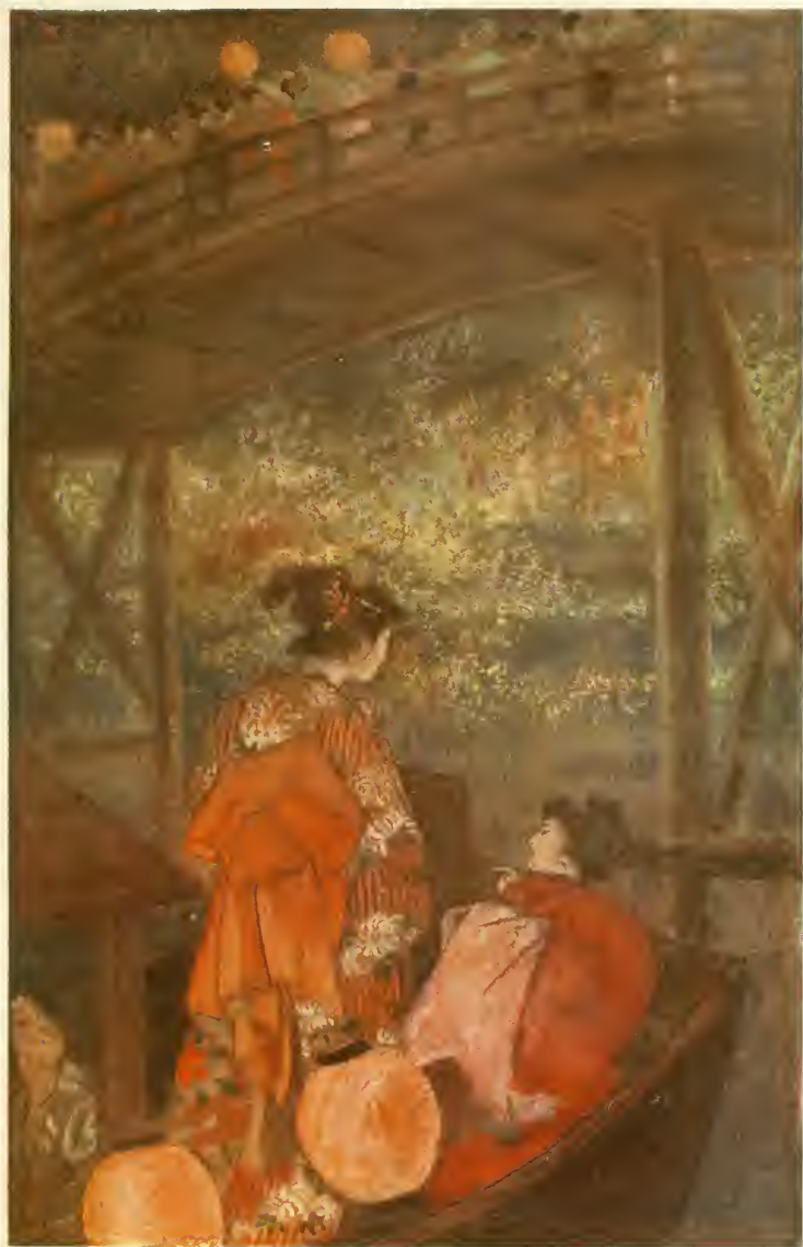
The Firefly Battle.