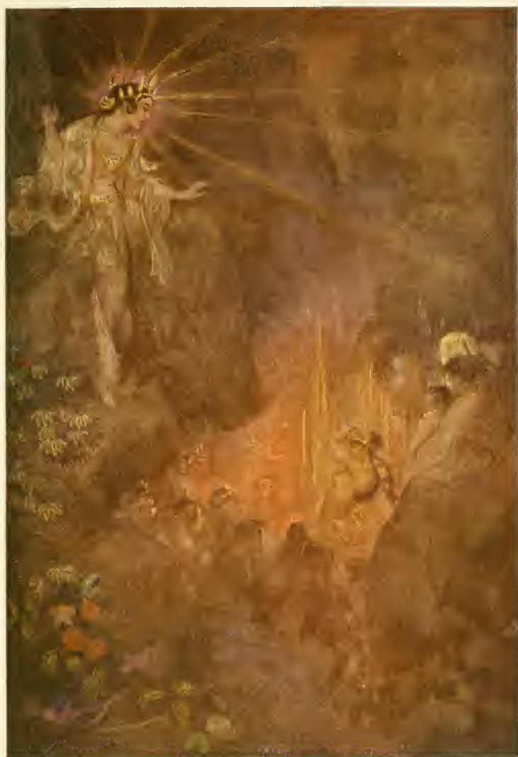
Uzume awakens the curiosity of Ama-terasu.