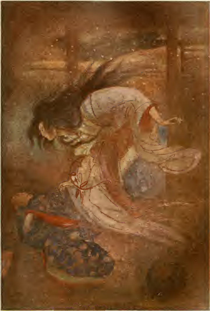
Yuki-Onna, the Lady of the Snow.