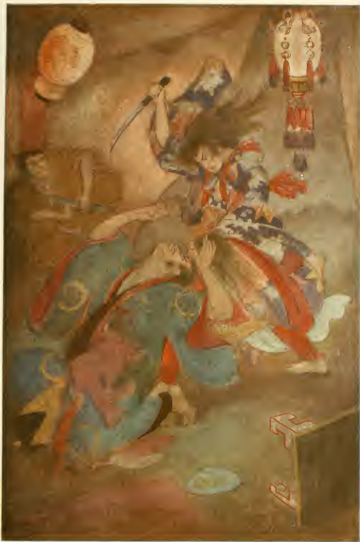
Prince Yamato and Takeru.