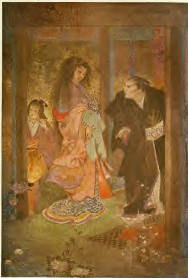
Shinzaburō recognised Tsuyu and her maid Yoné.