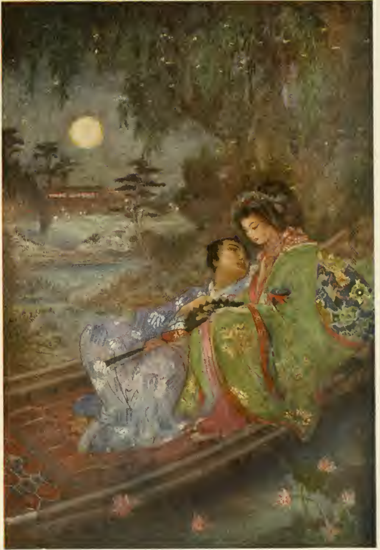
The Lovers who exchanged Fans.