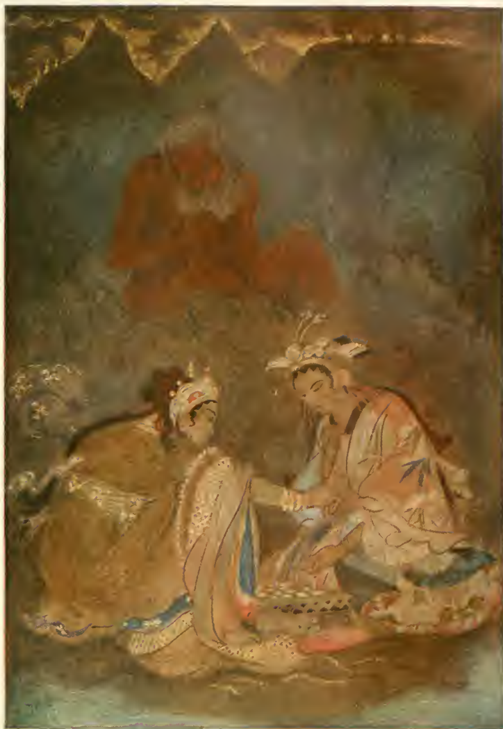
Visu on Mount Fuji-yama.