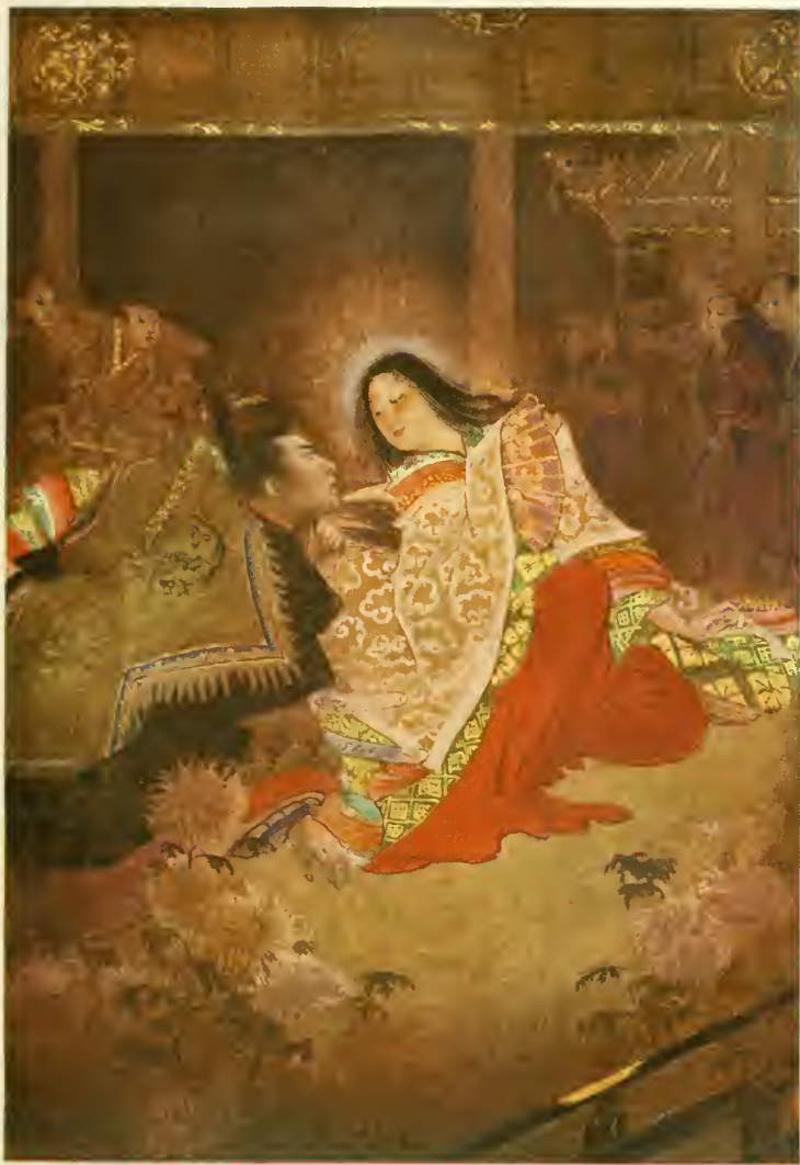
The Mikado and the Jewel Maiden.