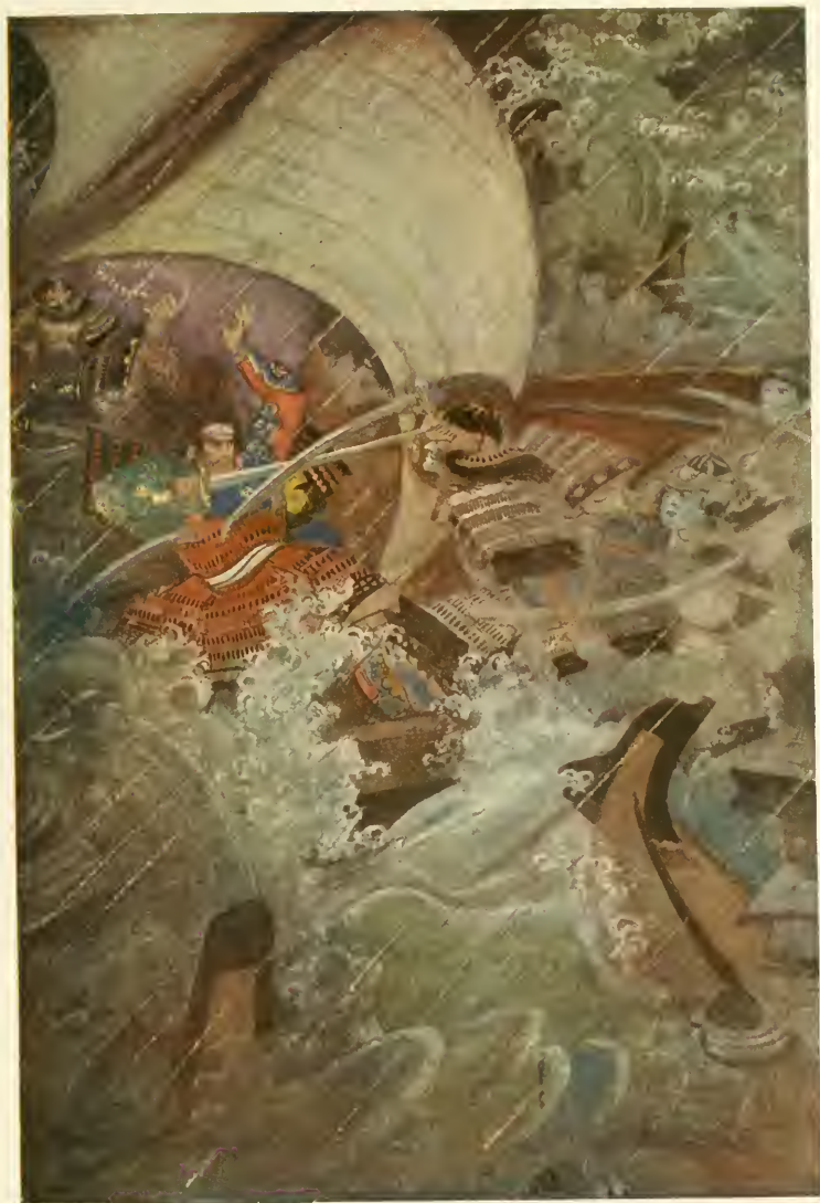
Yoshitsune and Benkei attacked by a ghostly company of the Taira Clan.