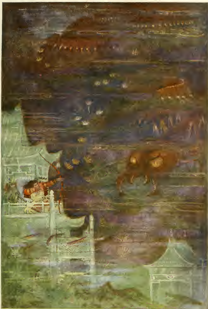
Hidesato and the Centipede.