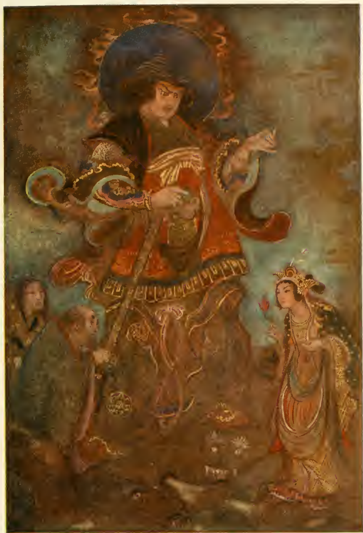
Susa-no-o and Kushi-nada-hime.