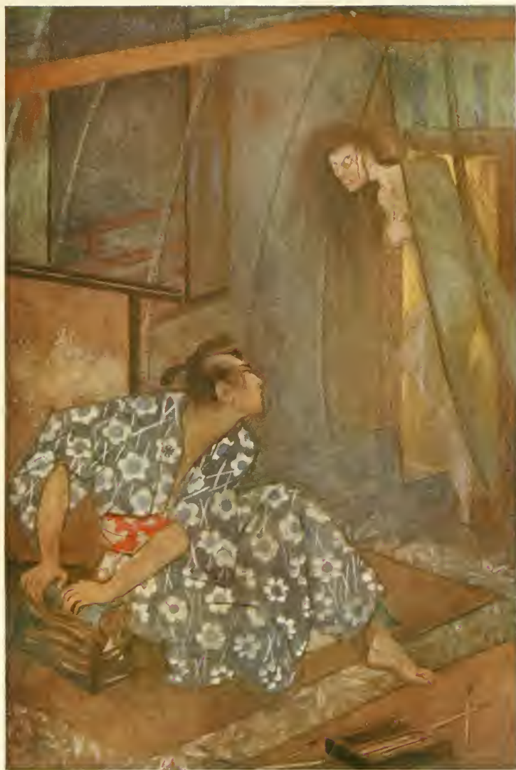
A Kakemono Ghost.