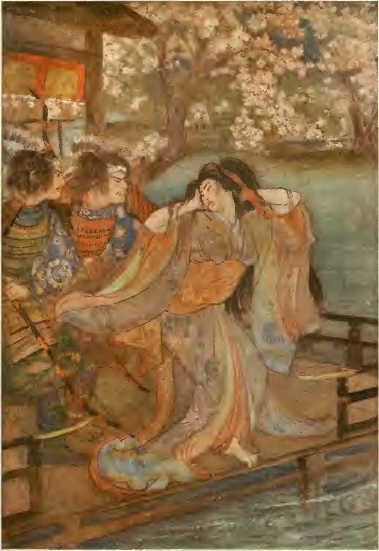
The Maiden of Unai.