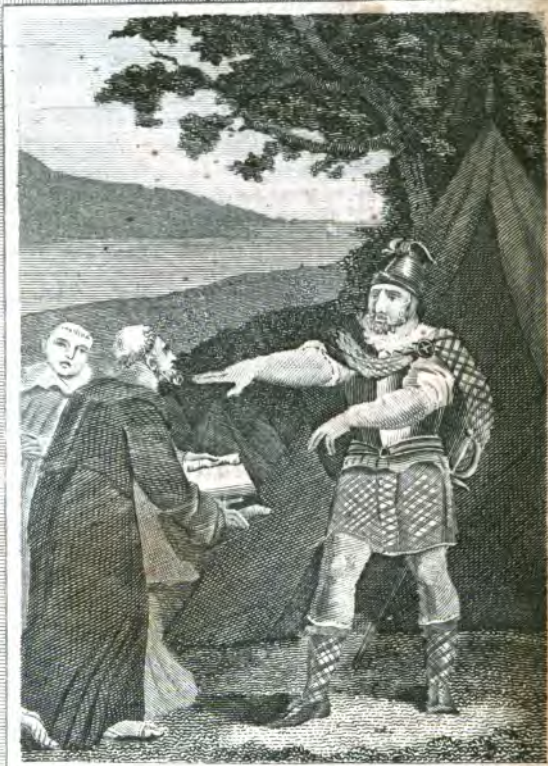
SIR WILLIAM WALLACE the Scots Patriot rejecting the overtures of KING EDWARD.