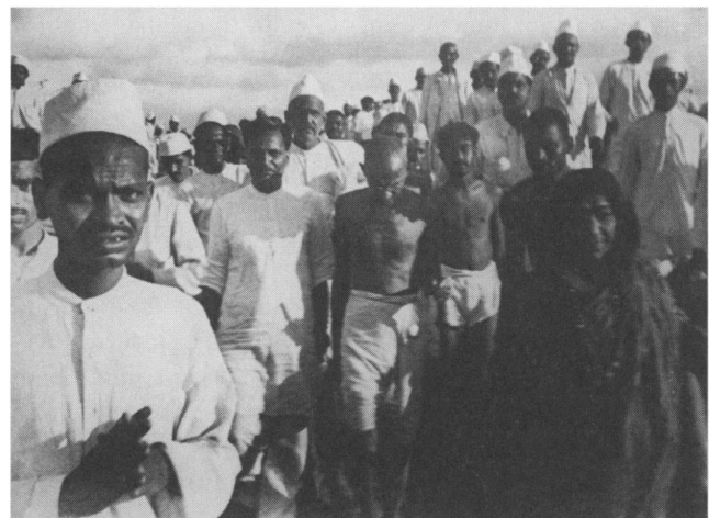
Gandhi on the Salt March, 1930

The salt deposits were surrounded by ditches filled with water and guarded by four hundred native . . . police in khaki shorts and brown