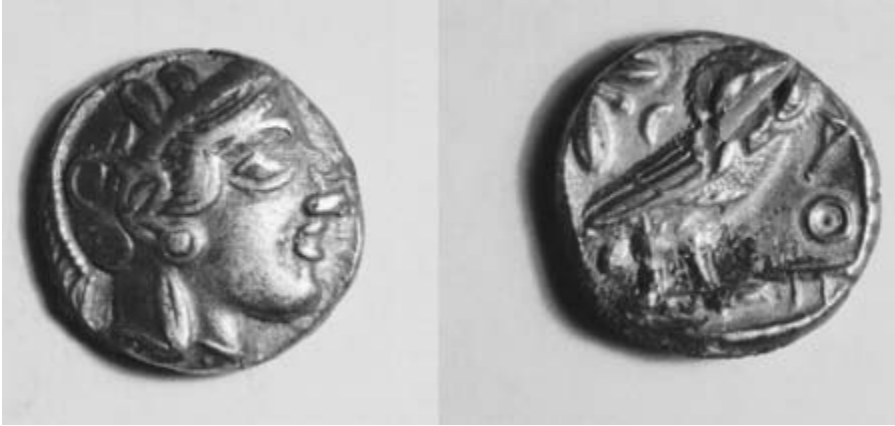
Fig. 8. An Athenian owl tetradrachm. The owl's face has been dented with a chisel to test whether the coin was solid silver.

Thrace and Macedon, where silver was mined, were silver-exporting areas, and the coins of these areas are sometimes found in large numbers in hoards outside of Greece in the late sixth century. 60 Aegina, which had no silver mines of its own, was the first state of Greece proper to mint coins in large quantity, and its coins are found over a broad area, though they are numerous only in hoards from the Cyclades and their vicinity. 61 The first issues of Athens, the Wappenmünzen , included many coins of small denominations, and the basic coin was a didrachm; with the latest of the Wappenmünzen , those with a gorgon's head on them, the basic coin of Athens became a tetradrachm, twice as heavy as the old coin and better adapted to use as an international currency. This is presumably when Athens began to use coinage as a way of exporting the silver of the Laureion mines; with the famous owl coins that soon followed (fig. 8), Athenian coinage came to be the dominant coinage in the entire eastern Mediterranean. 62