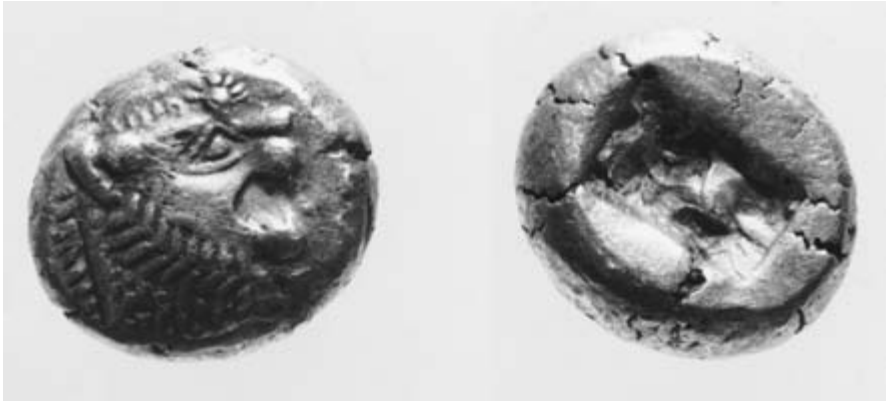
Fig. 7. One of the earliest electrum coins, showing the lion's head and the incuse square. (Collection of the Israel Museum, Jerusalem. Exhibit and photo © Israel Museum, Jerusalem.)

but on the other, in place of (or, in a few cases, in addition to) the striations, an intaglio design of a lion's head, goat's head, beetle, or other device now appears (fig. 7). 3 Numismatists have seen in this variation the actual invention of coinage, right before our eyes: first a goldsmith prepared preweighed bits of metal; 4 then he or someone else had the idea of striking them with a hammer to make an impression that would test whether they were electrum all the way through. 5 Since a small drop of metal is likely to slip away from the hammer, it was better to score the surface on which it was struck so as to hold it in place; this will have produced the striated items. Finally, the producer could identify himself by a sign carved into the surface on which the coin was struck, which would reproduce itself as an embossed pattern on the coin. 6 Some decades would pass before Greek mints added a design to the hammer as well, producing a coin with two faces, one on the side struck by the hammer and the other on the side that lay against the anvil. 7