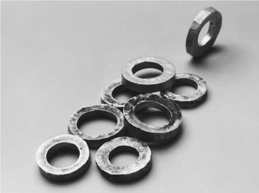
Fig. 5. Gold circlets found in Samaria and dated to the beginning of the fourth millennium B.C.E.: precious metal was hoarded in convenient shapes eons before coinage.

That there were more things than just a plethora of silver that might make up wealth was not a new concept; as early as the end of the third millennium B.C.E., Ur-Nammu had expressed himself similarly. 115 What is noteworthy is that even where silver performed all the functions of money, it still had not become the unique measure of wealth. Many years later, Aristotle would say that many people consider wealth to be “plenty of coin”; 116 no Israelite restricted wealth to plenty of silver. In a functional sense, money