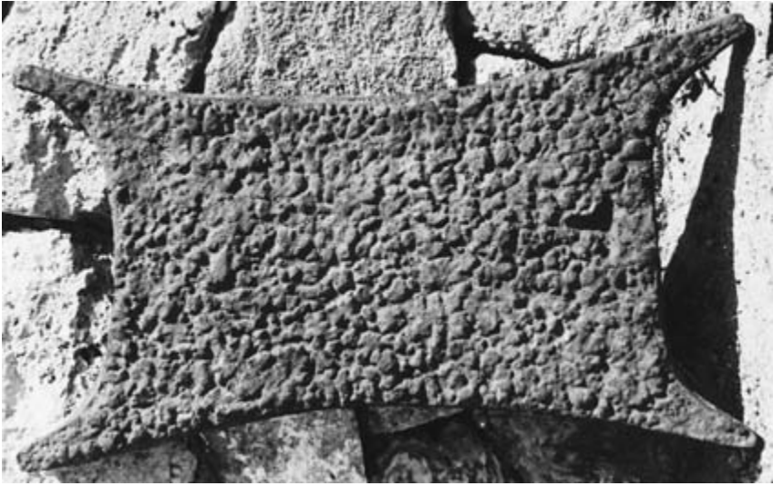
Fig. 11. A replica of an “oxhide” copper ingot, with the rough side showing.