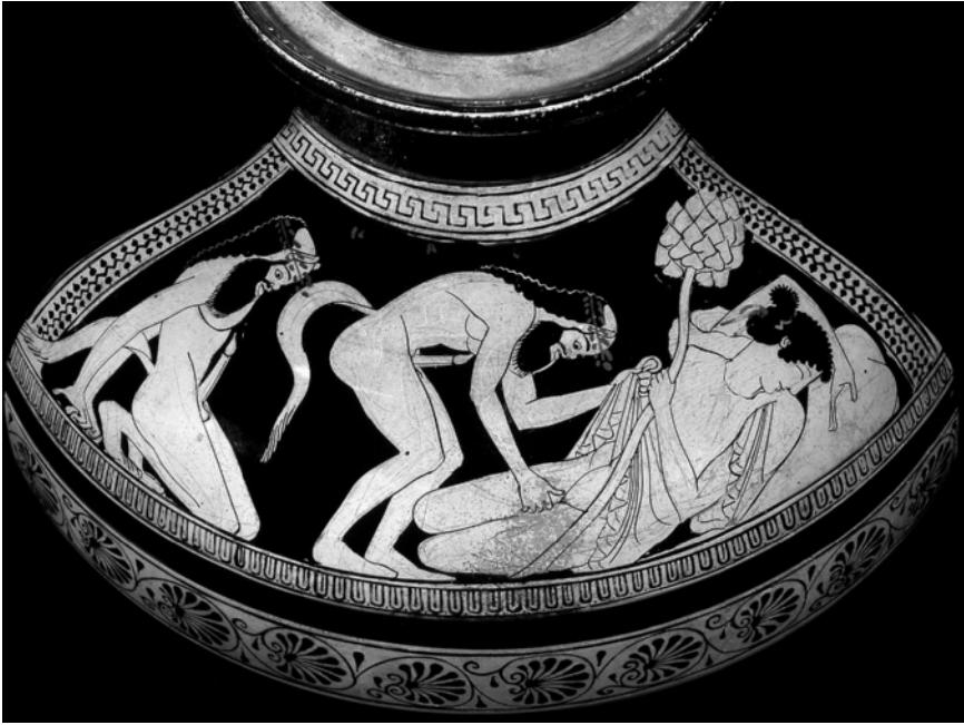
Figure 11. Sleeping maenad and satyrs. Detail of red-figure hydria, ca. 500 B.C., by the Kleophrades Painter. Terracotta. ARV 188/68.

vases for lewd images, he is rewarded with the exposure of the maenad but simultaneously sees himself reduced to a hairy satyr. 124