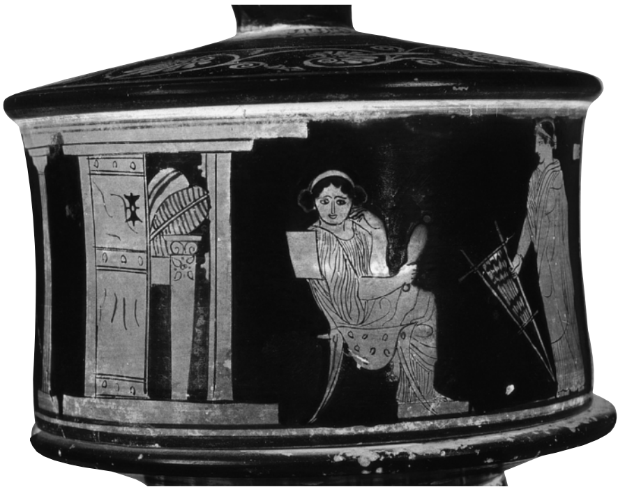
Figure 4. A woman holding a mirror, facing the viewer. Red-figure pyxis, ca. 430 B.C.E., by the Painter of the Centauromachy. ARV 1094/104, Louvre CA 587. Reproduced with permission.