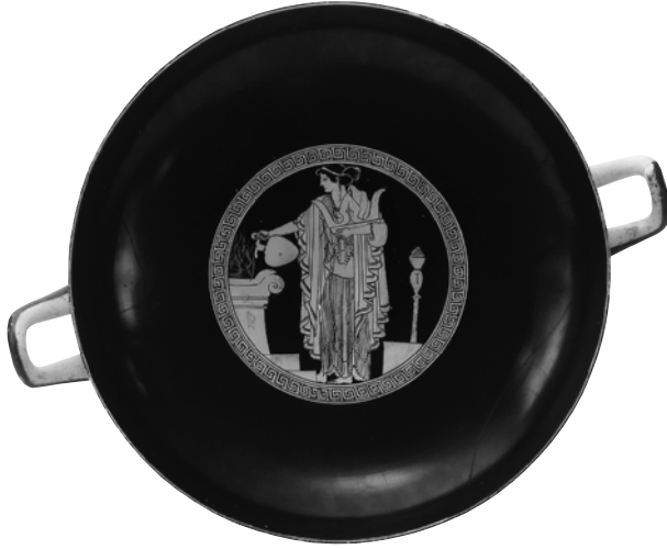
Figure 6. Woman pouring offerings. Makron, red-figure kylix (tondo), ca. 480 B.C. Wheel-thrown, slip-decorated earthenware. H. 4\frac{7}{16} in., diam. at lip 11\frac{5}{16} in., diam. with handles 14\frac{1}{4} in. Toledo Museum of Art, Toledo, Ohio. Purchased with funds from the Libbey Endowment, Gift of Edward Drummond Libbey, acc. no. 1972.55.

wars, then, that women emerge into ceramic representation as ritual practitioners, and, as we have seen, the scenes of their cult activity are often paired with those of men's military preparations. We might conclude that part of the vases' project is to negotiate a productive place for women in the newly democratic state, which can be effectively achieved by stressing not only women's contributions to child rearing and textile manufacture but also their important role in ritual practice.