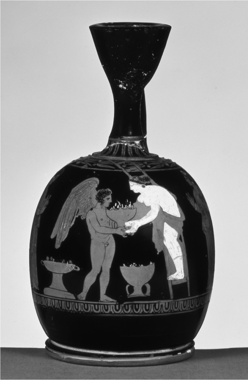
Figure 1. Aphrodite performing the Adonia. Lekythos, ca. 380 B.C.E. Badisches Landesmuseum B39. Reproduced with permission.