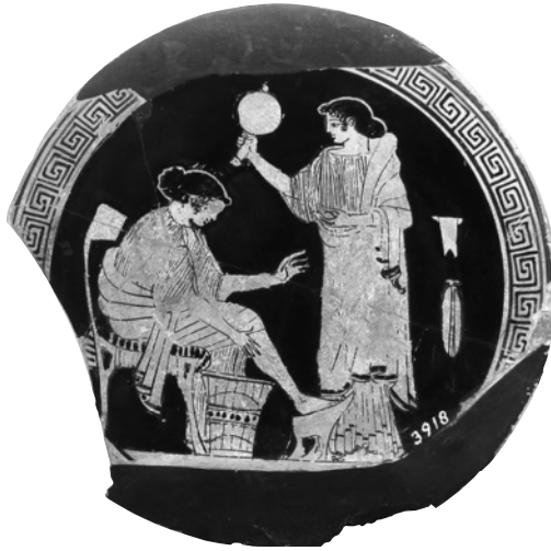
Figure 5. Women working wool; on the exterior of this cup, which is damaged, is visible a woman at an altar. Cup by the Steiglitz Painter. ARV 827/7, Florence 3918.

inate on cups, and subsequently they show some migration to the small pelike and squat lekythos, which are also “female” perfume vases. While scenes with more than one figure at the altar, male or female, appear on many types of vase, some of these too seem designed for women. The pelikai in particular always show women as well as men and sometimes show only a group of women. ARV 267/1, for instance, shows on one side two women at an altar, and on the other two women who approach with a phiale, a shallow cup from which libations were poured. A cup by the Steiglitz Painter ( ARV 827/7) shows on its damaged exterior several women and an altar, while the interior is occupied by an image of two women, one of whom cards wool on her knee while the other holds—according to your preference—a mirror or a distaff (see fig. 5). 94 This vessel as a whole can be read, like others that feature a plurality of women with different attributes, as mobilizing various versions of femininity, among which it is possible to see here ritual activity at the altar emphasized to the same extent as wool working.