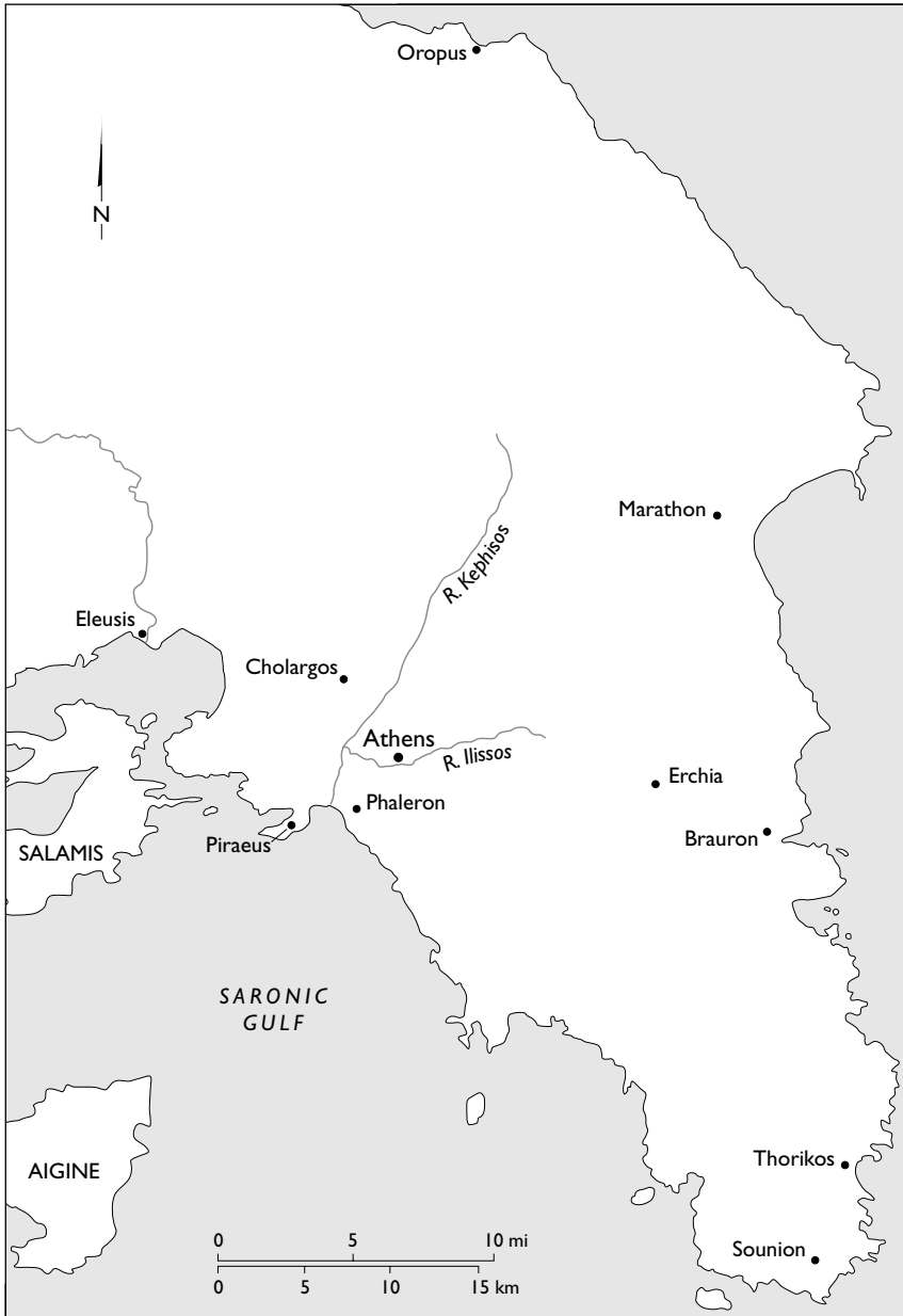
Attica. Some sites of women's ritual practice.