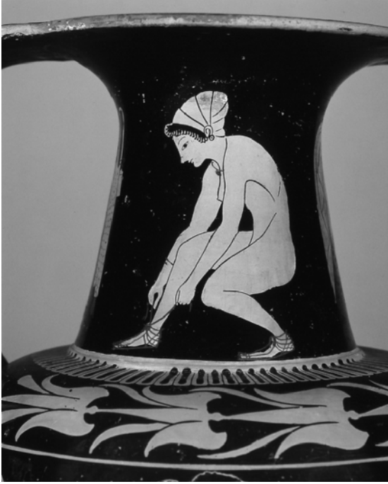
Figure 10. Naked woman tying sandal. Attic red-figure amphora, 525–515 B.C.E., by Oltos. ARV 53/2, Louvre G2. Photo RMN-Hervé Lewandowski. Reproduced with permission.

viewer. On each side a hopeful satyr grabs at a brawny maenad well equipped to resist his advances; neither image is conclusive about his success or failure. On the neck of the amphora, the question of the direction of the narrative is re-posed: a naked woman, presumably a hetaira , is tying her sandal (see fig. 10). Or is she untying it? Pornography here may well be in the eye of the beholder.