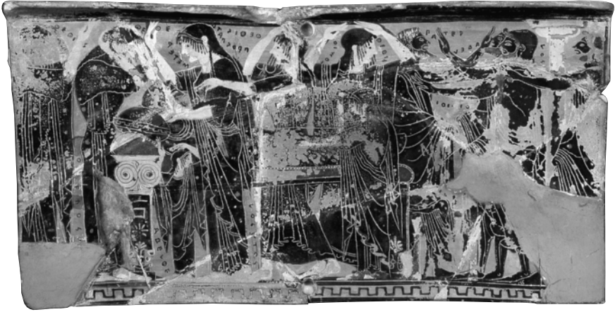
Figure 7. Scene of prothesis . Funerary plaque, black-figure, ca. 500 B.C.E., attributed to the Painter of Sappho. Louvre MNB 905. Photo RMN-Hervé Lewandowski. Reproduced with permission.

gather, among whom women sometimes seem to lament more expressively than men, raising two hands to their heads instead of one. 106 Black- and red-figure funerary vessels of the sixth and fifth centuries generally convene fewer people and concentrate on the more private components of the burial process. Since the vase paintings seem to eschew the procession to the tomb and the public scenes of lamentation, especially by women, in favor of a concentration on the prothesis , the laying out of the body at home, many scholars have suggested that the new style of scene registers the pressure from Solon's funerary laws (discussed in chapter 1). One ceramic plaque even identifies the mourners not by name but by relationship to the deceased, as if to show that they are family members and thus in conformity with the legislation restricting mourning to close relatives (see fig. 7). 107 In the context of this legislation, however, it is significant that the scenes of mourning that do appear on vases continue to award a special prominence to women, placing them nearer to the corpse and allotting to them the more dramatic expressions of grief. Even though funerary laws deliberately tried to deemphasize the role of women as mourners, the ceramics with which families actually discharged their responsibilities toward the dead can be seen to reassert the importance of women in the mourning process.