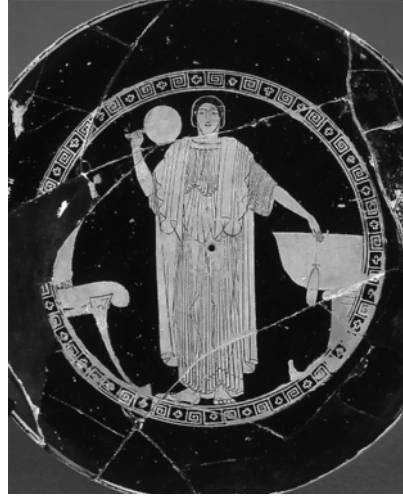
Figure 3. A woman holding a mirror, between a basin and a bed. Interior of a red-figure cup by Douris. ARV 432/60, Musée du Louvre S 1350. Photo RMN-Hervé Lewandowski. Reproduced with permission.