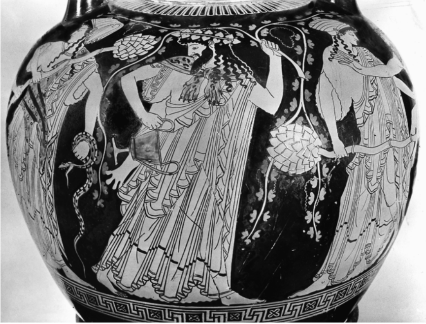
Figure 9. Dionysos and maenads. Pointed amphora by the Kleophrades Painter. ARV 182/6, Munich 2344.

ties of sexually hostile encounters between maenad and satyr. Two scenes seem to have caught the early fifth-century imagination: that of the satyrs who creep up on or more actively molest a sleeping maenad, and that of the maenad who defends herself with a strategically aimed thyrsus. A significant characteristic of these scenes is their momentary quality; given that they cannot tell a complete narrative, and that “the issue is in doubt,” 122 the viewer is emphatically drawn into supplying the discursive content of the scene. A cup by Makron from about 480 B.C.E. ( ARV 461/36) shows on one side a sleeping maenad accosted by satyrs, but on the other side a maenad who starts to get up and brandish her thyrsus. There is no way to decide whether or not the satyrs succeed in their harassing mission. 123 An earlier amphora by Oltos ( ARV 53/2) entrusts the narrative even more teasingly to the