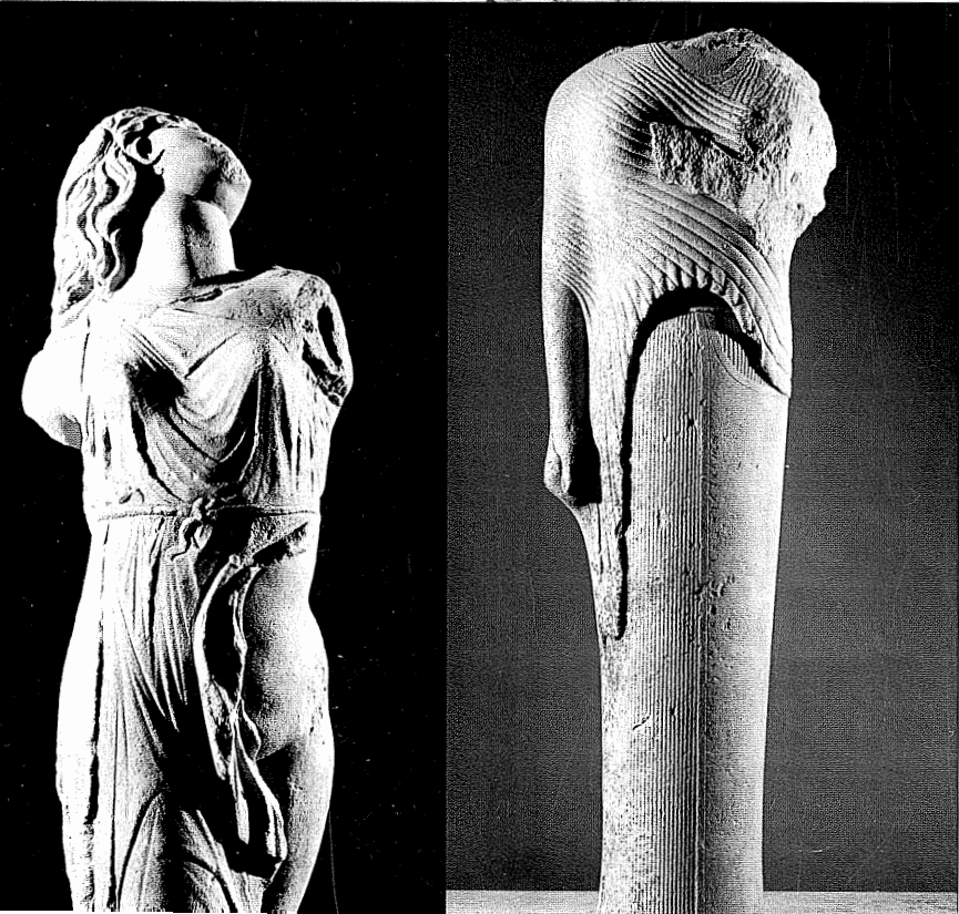
Plate 12 (bottom right) Hera of Samos, upright in her temple, c. 560 BC. Today exiled to the Louvre. © akg images/Erich Lessing

Plate 11 (bottom left) Entranced Maenad. Work of Scopas, c. 340 BC. Roman copy. Dresden, Staatliche Kunstsammlungen 133. © akg images/Erich Lessing