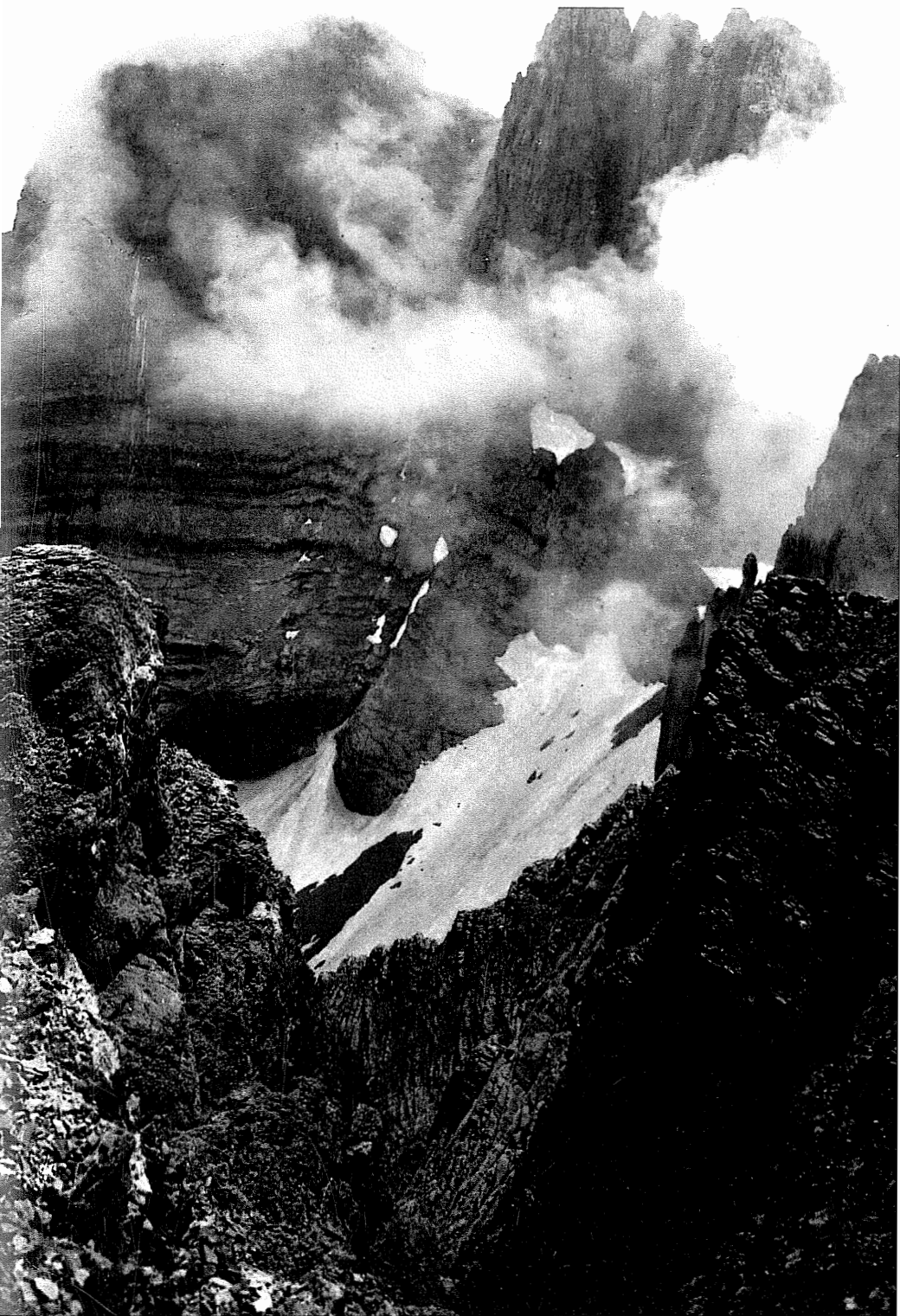
Plate 1 Mount Olympus, dwelling-place of the Olympians