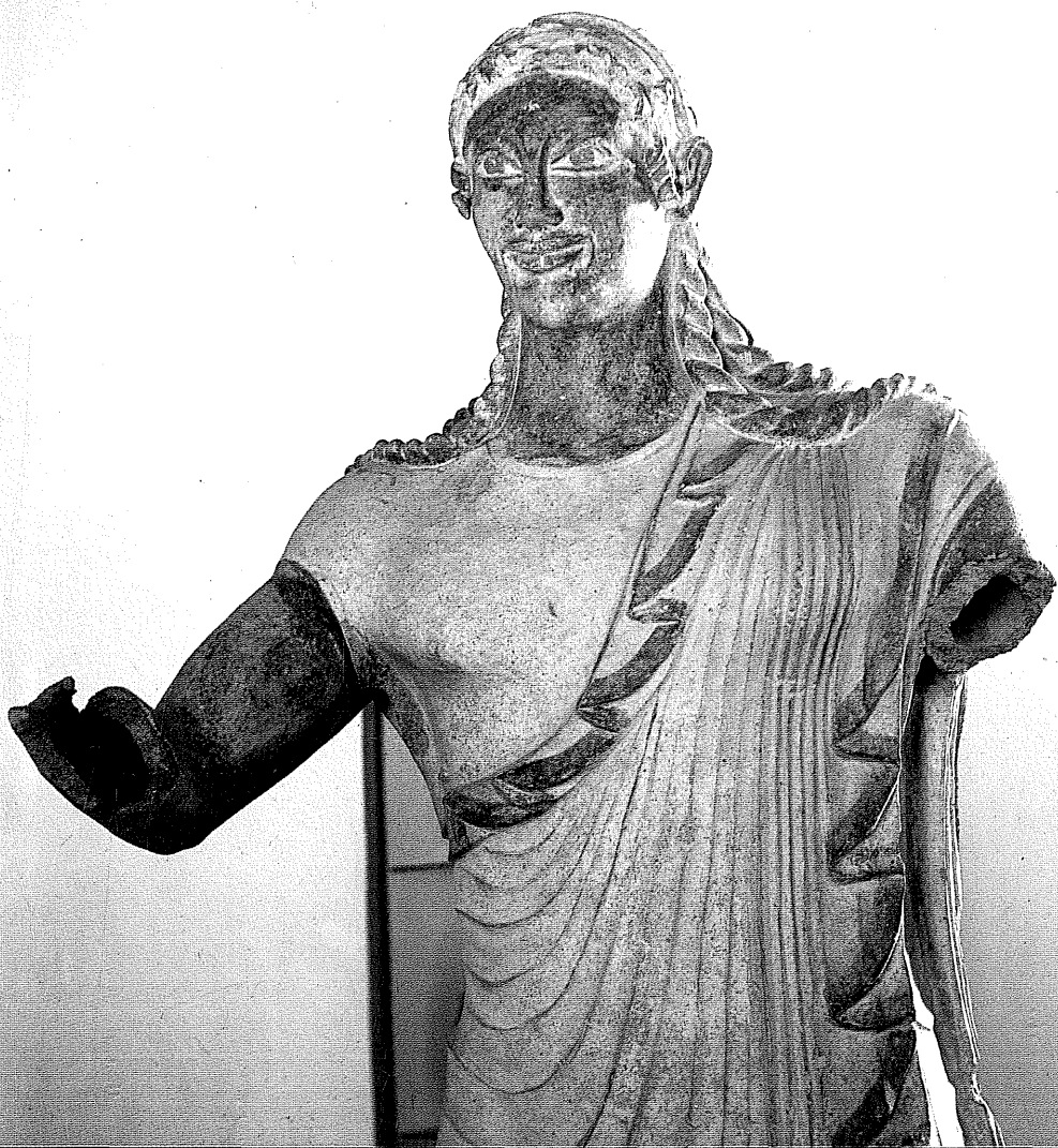
Plate 6 Apollo of Veii pictured as a carnivorous god, c. 520–500 BC. Museo di Villa Giulia, Rome.