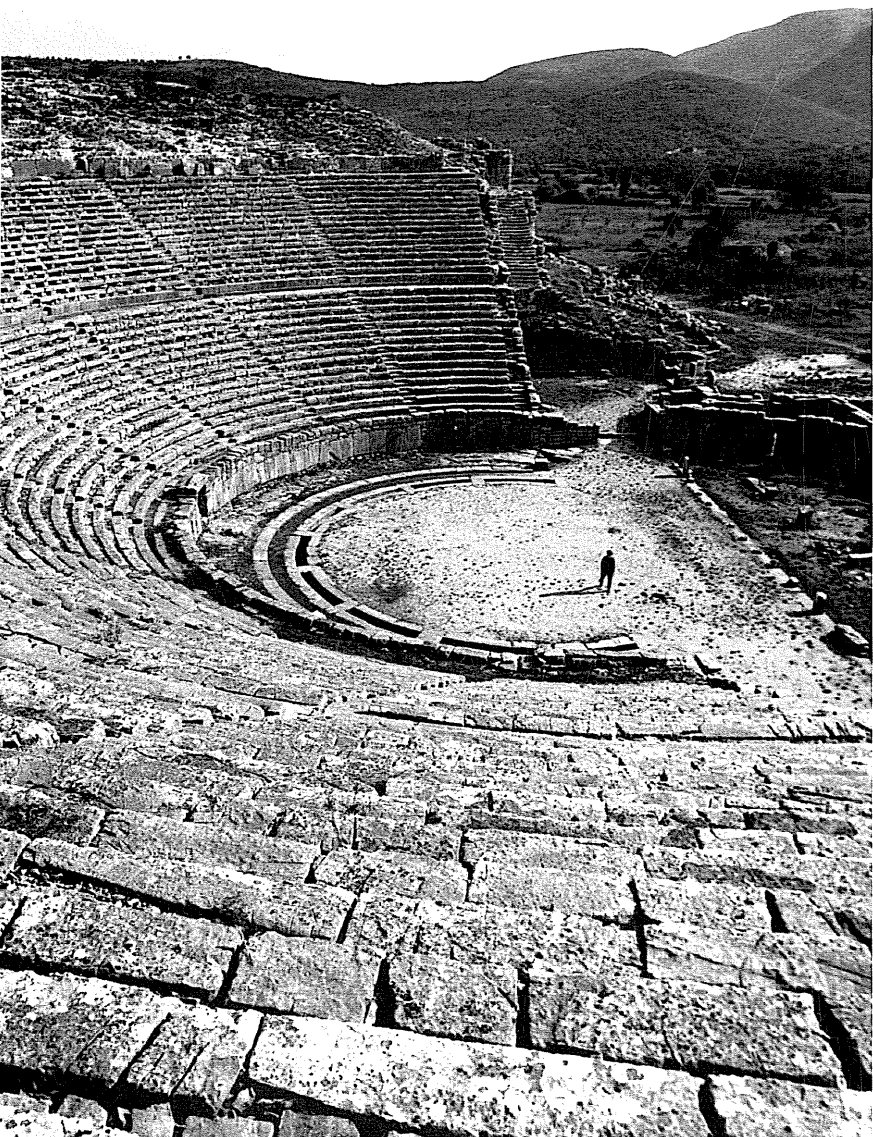
Figure 2 Epidauros, the theatre and meeting place, dating from the fourth century BC, attributed to the architect Polycleitus the Younger.