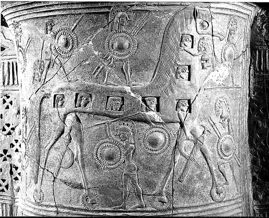
ate 7 The Trojan Horse in action. Relief Pythos from Mykonos, 670 BC. Mykonos Museum.