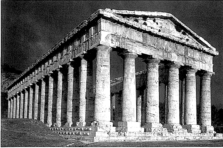
Plate 3 Segesta. The temple itself. Late fifth century BC. © akg images/G rard Degeorge