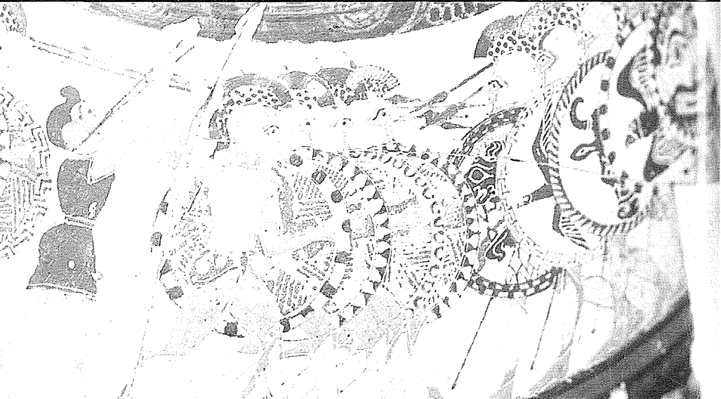
ate 8 Hoplites in battle, in phalanx formation. Chigi Olpe Corinthian vase, 630 BC. Museo di Villa Giulia, Rome.