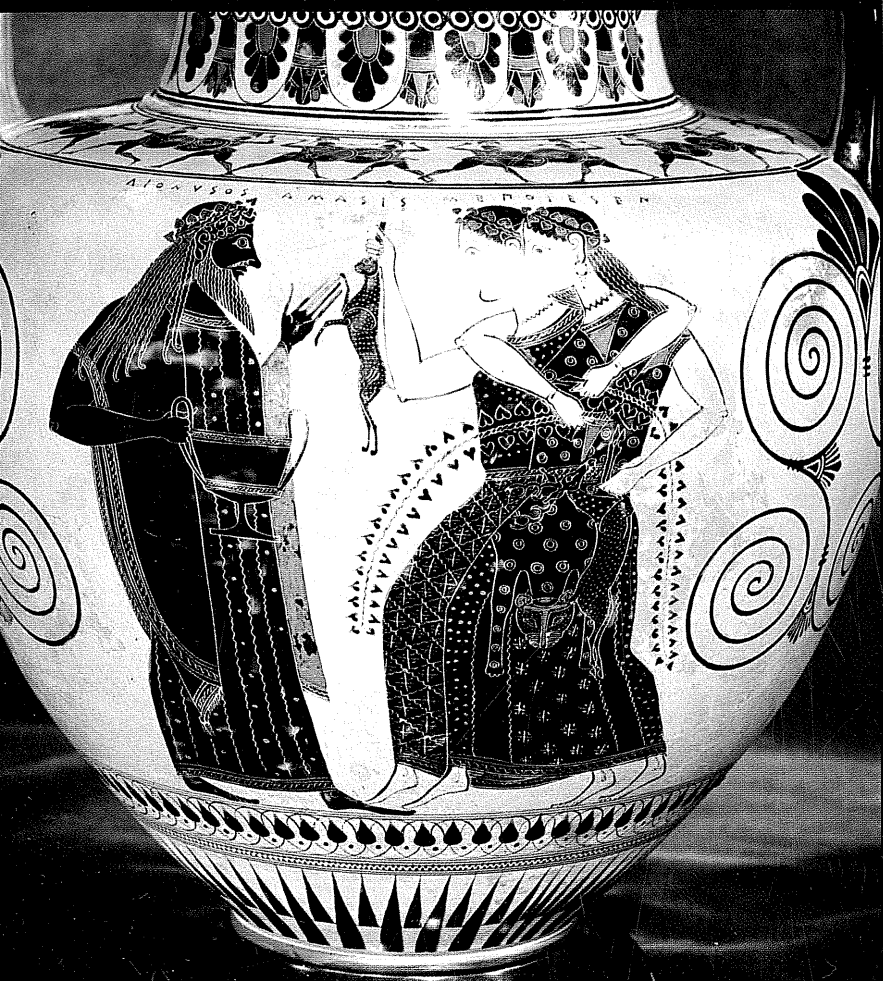
Fig. 5 Dionysus holding the large drinking vessel, greeting two Maenads who offer him the catch from their hunt over mountain and valley. The Amasis Painter, c. 540 BC. Paris, Bibliothèque Nationale, Cabinet des Médailles.