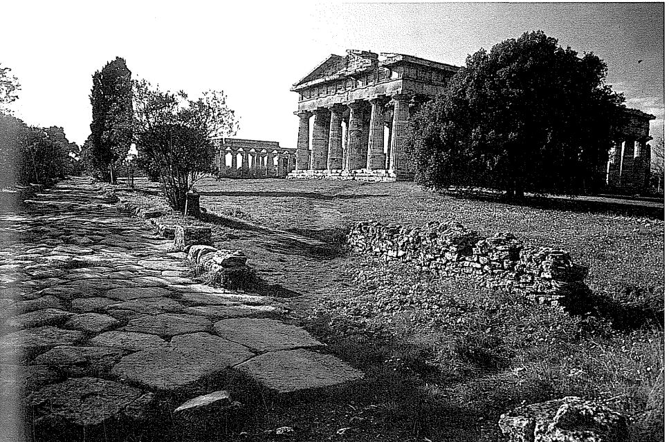
Plate 4 Paestum-Posidonia: abode of Athene. Late sixth-century BC.