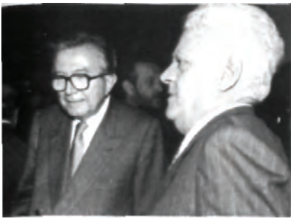
Former Prime Minister Giulio Andreotti (left) with his longtime spokesman in Sicily, Salvo Lima, known now to have been a made member of the Mafia. Lima was shot to death by a Mafia hit team in early 1992 when he could no longer deliver judicial protection for Mafia bosses.