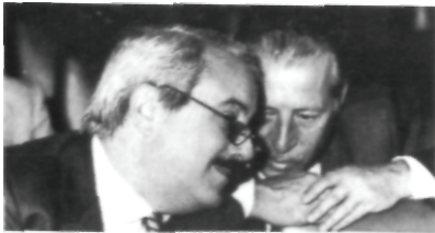
Judges Giovanni Falcone (left) and Paolo Borsellino, intimate friends and staunch allies, both murdered by the Mafia in Palermo in 1992.