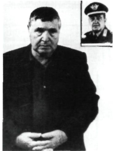
Salvatore "Toto" Riina, the Sicilian Mafia's fearsome capo di tutti capi, photographed on the day of his capture after twenty-three years in hiding. The portrait on the wall above him is of General Carlo Alberto Dalla Chiesa, murdered by the Mafia in 1982.