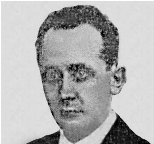
Plate 4 Guido Landra