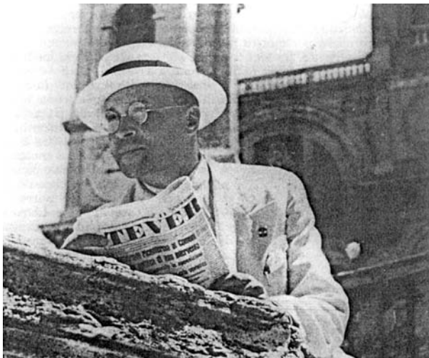
Plate 6 Telesio Interlandi