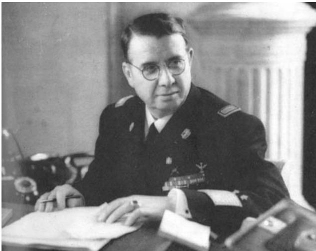
Plate 2 Giacomo Acerbo