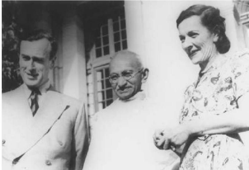
Illustration 4 Lord & Lady Mountbatten with Gandhi, 1947 (No. 21672).