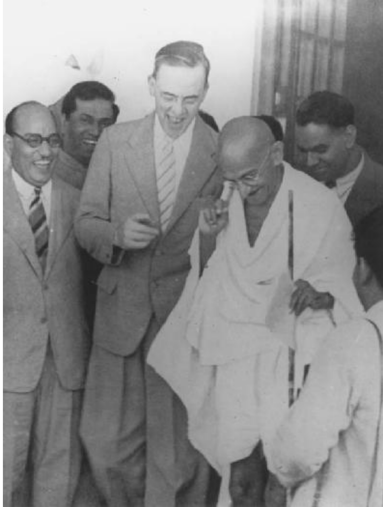
Illustration 10 Gandhi with Stafford Cripps, 1942 (No. 80834).