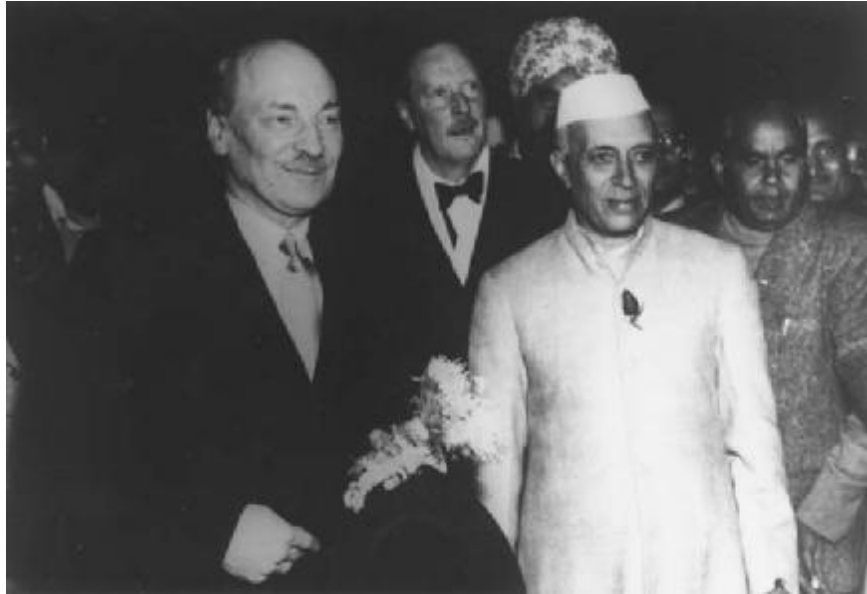
Illustration 2 Clement-Attlee (1953) only Attlee photo to be taken for publication (No. 1469).