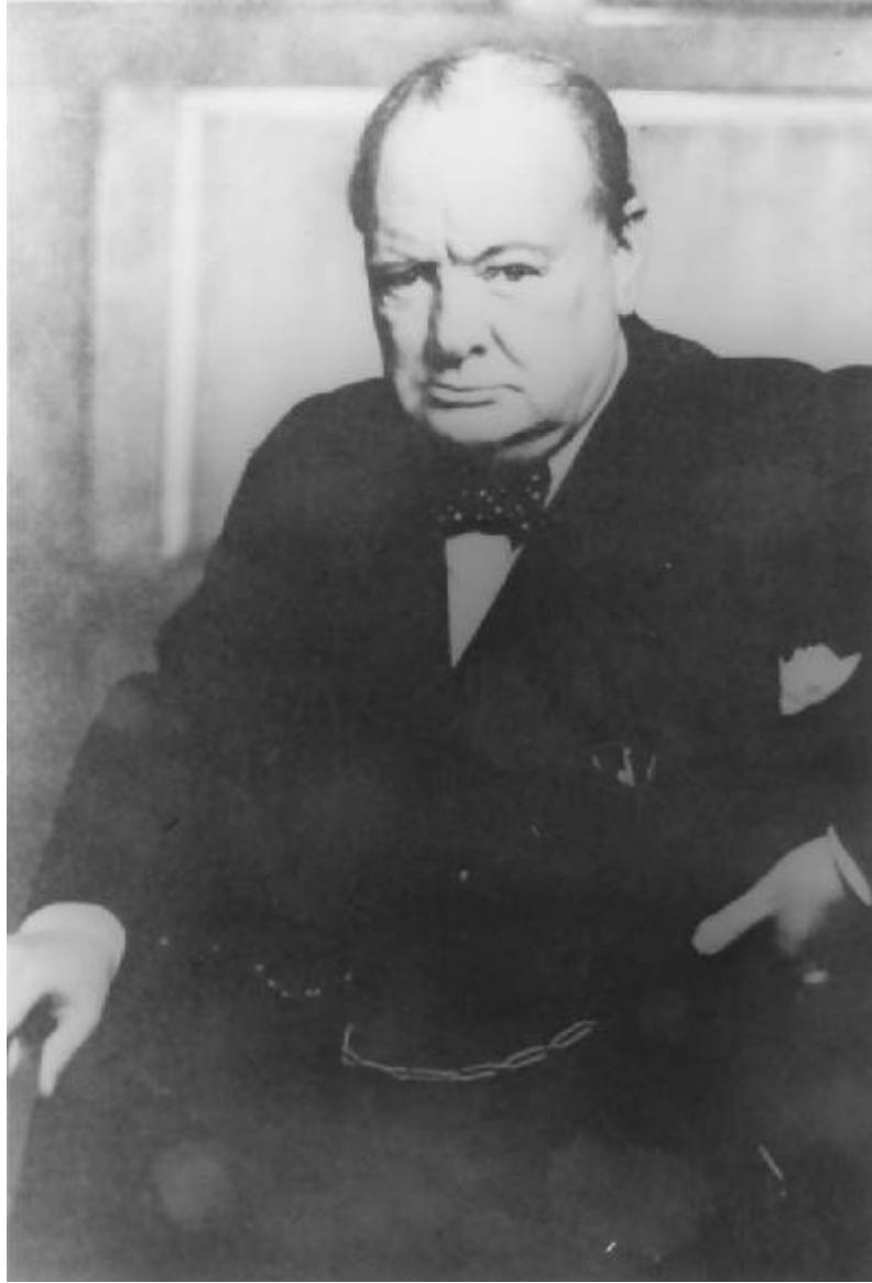
Illustration 1 Winston Churchill (1950s) (No. 1991).