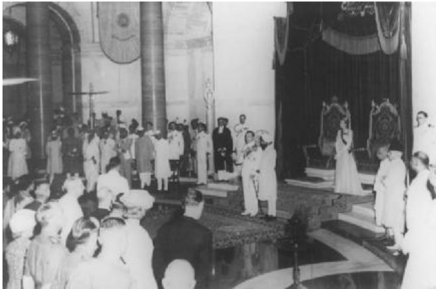
Illustration 3 Indian Cabinet taking oath at office – 15 August 1947 (oft repeated photo No. 24987).