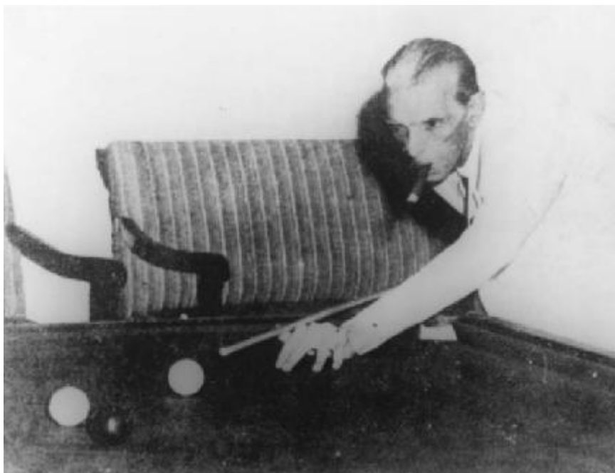
Illustration 9 Jinnah playing billiards, 1945 (No. 25705).