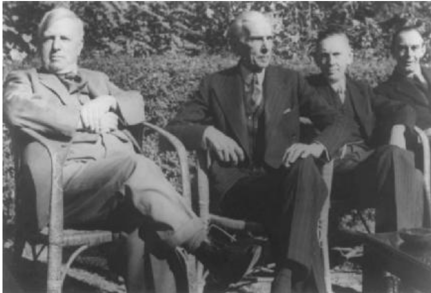
Illustration 8 Jinnah with members of British Parliamentary Delegation (Jan–Feb 1946) (No. 27954).