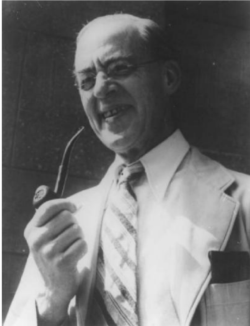
Illustration 11 Sir Stafford Cripps, 1942 (No. 24941).