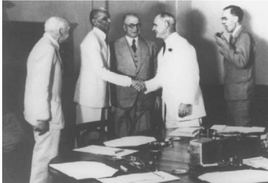
Illustration 6 Jinnah with Cabinet mission members – Lord Pethick-Lawrence, Lord Alexander and Sir Stafford Cripps. Jinnah is seen shaking hands with the Viceroy Lord Wavell, 1946 (No. 24937).