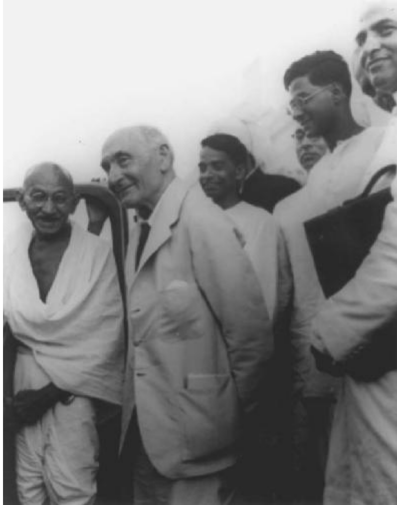
Illustration 7 Gandhi with Lord Pethick-Lawrence, 1946 (No. 27884).