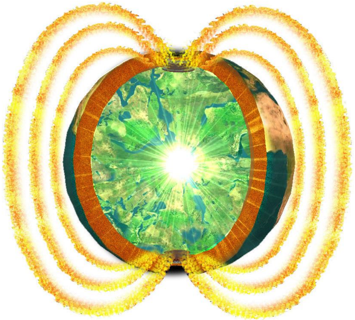
Illustration courtesy of One Light http://onelight.com This can also explain the theory of the round circular openings at the north and south poles. These openings are doorways to the inner earth.

towards the inner earth and the ones inside the earth are pulled down to the outside.