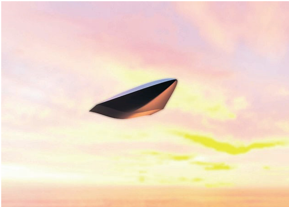
Image of the Indian HGV-2, one of many hypersonic vehicles that are being tested and deployed.

The most conservative hypothesis is that these UFOs are built by humans: experimental vehicles under development by the US military or by foreign militaries. In the past, famous UFO sites (e.g., Area 51) have turned out to be test sites for advanced technologies. Some of the “triangular shaped” objects that are capable of rapid accelerations and high speeds do seem remarkably similar to descriptions of hypersonic vehicles that are currently under development by the Army, Navy , Air Force , DARPA and the NSA . The Indian , Chinese and Russian military are all developing their own hypersonic vehicles. DARPA’s HTV-2 had test flights over a decade ago so that the recent appearance of flying triangular shaped objects that can reach high speeds seems consistent with this hypothesis. There is also extensive work on developing drone swarms by many nations (including even Armenia) whose properties match some UFO reports.