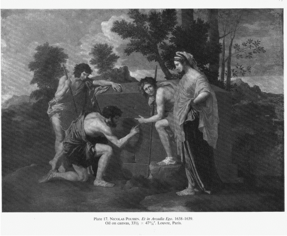
Plate 17. NICOLAS POUSSIN, El in Arcadia Ego , 1638-1639. Oil on canvas, 33½" x 47½", Louvre, Paris.

You see, after the months and months of reading alchemical literature, and already making the connection between Rennes-le-Chateau and the Pyrenees where an enclave of Alchemists is supposed to exist, I saw nothing in the above letter but a clear reference to alchemy.