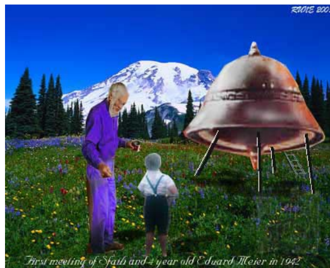
artpicture up is idea of the first Spath-contact in-42. Picture down and topmost left of JimNichols