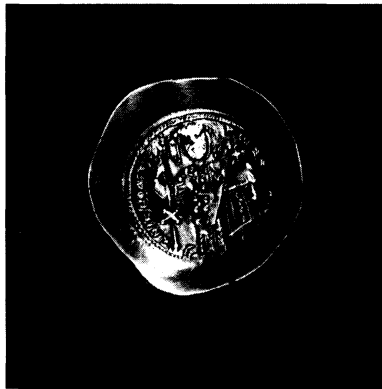
A gold bezant, the major trading coin of Byzantium.

In Marco Polo's great book of travels, he talks about a coin called the bezant circulating in Kublai Khan's Mongol Chinese empire. The emperor, like the vast majority of politicians, found the lure of paper money irresistible. In his case, however, it was money printed on pieces of mulberry tree bark. The same disastrous effects, seen everywhere else in history, followed. Prices increased, and the gold bezant took on increasing importance