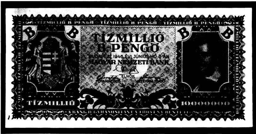
A ten-million pengó inflation note of Hungary.

Another outrage associated with inflation is the endorsement of the process by most economists. It's bad enough to see the beneficiaries promote wealth transfer through inflation, but to have the majority of 20th-century economists do so as well is tragic. Some do so because they realize that their power and prestige depends on their giving an intellectual rationale to the acts of the inflation elite. But many do not benefit directly, and their motives may be good. But whether they promote inflation to help the poor, to help the rich, or just believe it is in everyone's interest, the results are horrendous.