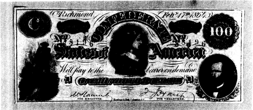
A $100 Confederate note.

The day of reckoning is upon us. The people now recognize the inflation hoax for what it is, and are demanding reform. Congress' responsibility is clear, but the choices are varied.