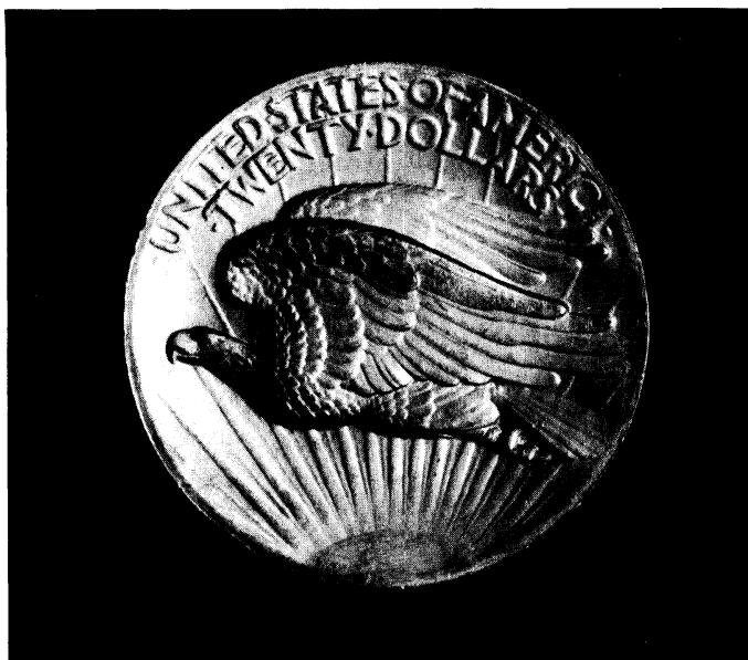
A U.S. $20 gold piece.

Government's only legitimate reason for existence is to protect innocent life and property from aggression, foreign or domestic. When it deliberately destroys the money, government is acting perversely, by harming innocent life and property. Short