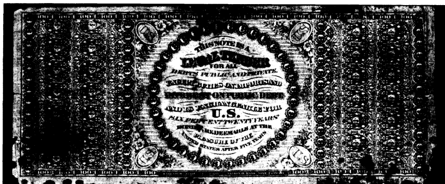
A $100 legal tender note of 1862.

The North financed the Civil War with hundreds of millions of dollars of irredeemable Greenback notes, and as a result, prices more than doubled from 1861 to 1865.