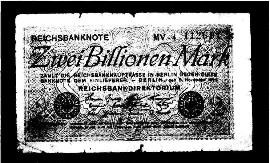
A two-trillion mark note of the great German inflation of the 1920s.

If we expect to reverse the destruction of our economy, we must try to understand the motives of those who promote inflation.