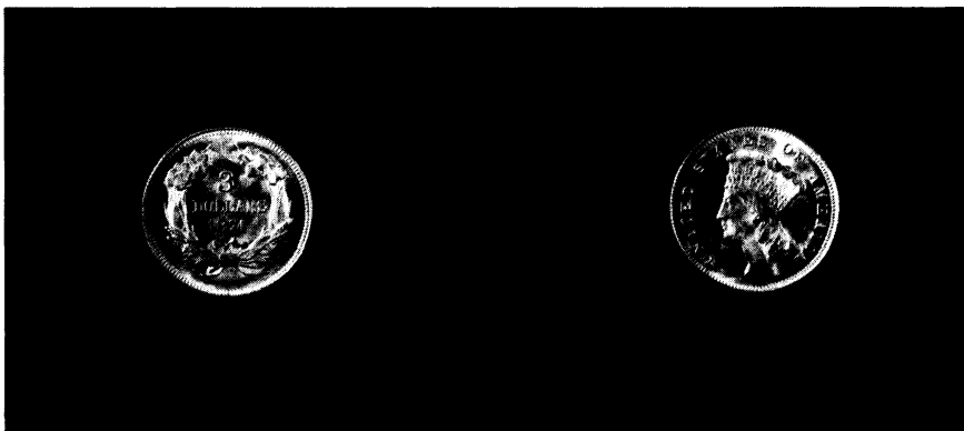
U.S. $3 gold piece of 1874.

During most of the 19th century, we had a functioning gold standard. Combined with classical liberal economic policies and limited government, this set the stage for the greatest economic growth in history.