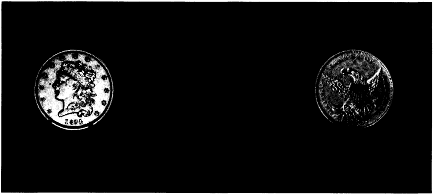
U.S. $5 gold piece of 1837.