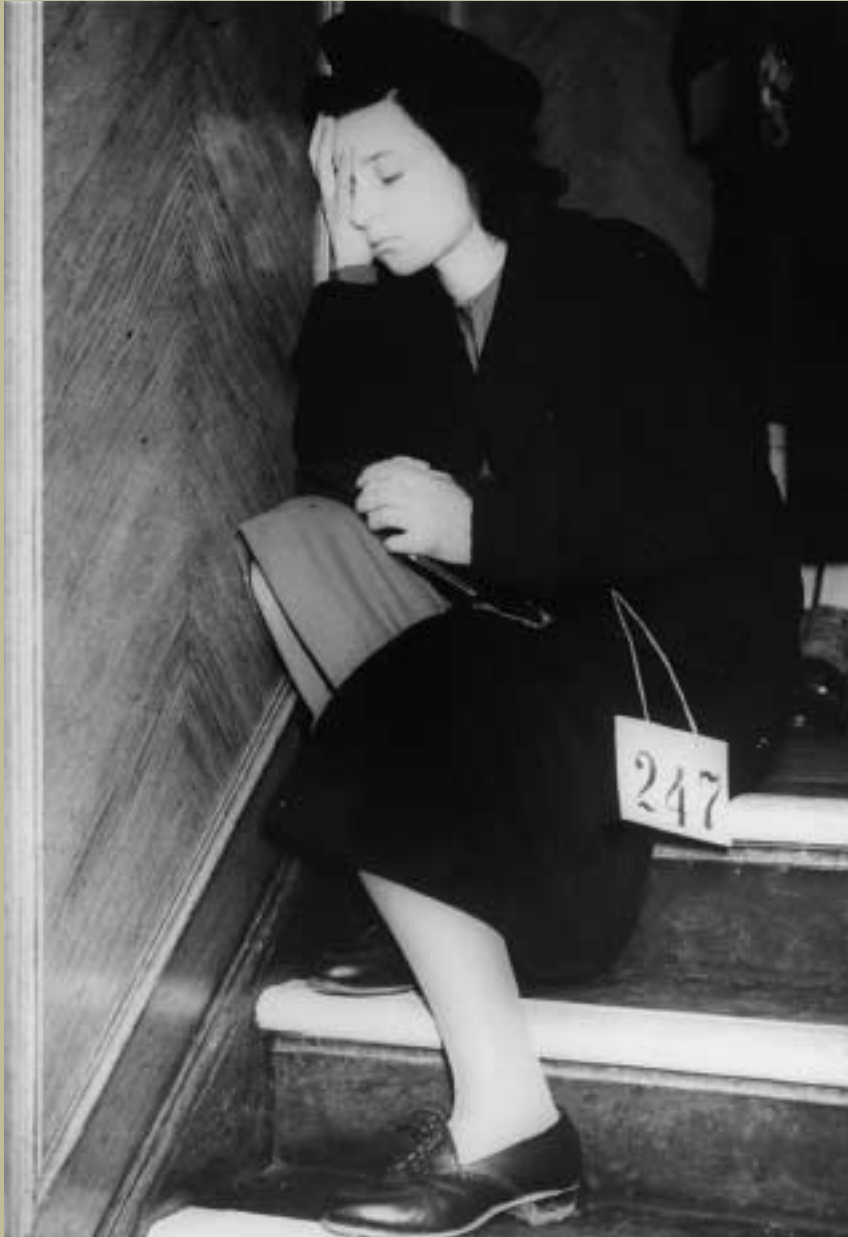
A Jewish girl from Vienna sits on a staircase after her arrival in England. Nearly 10,000 children found refuge in England in what was called the Kindertransport. (December 12, 1938)