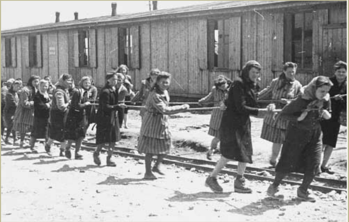
Prisoners perform forced labor in the Plaszow concentration camp in Poland. (ca. 1943-44)