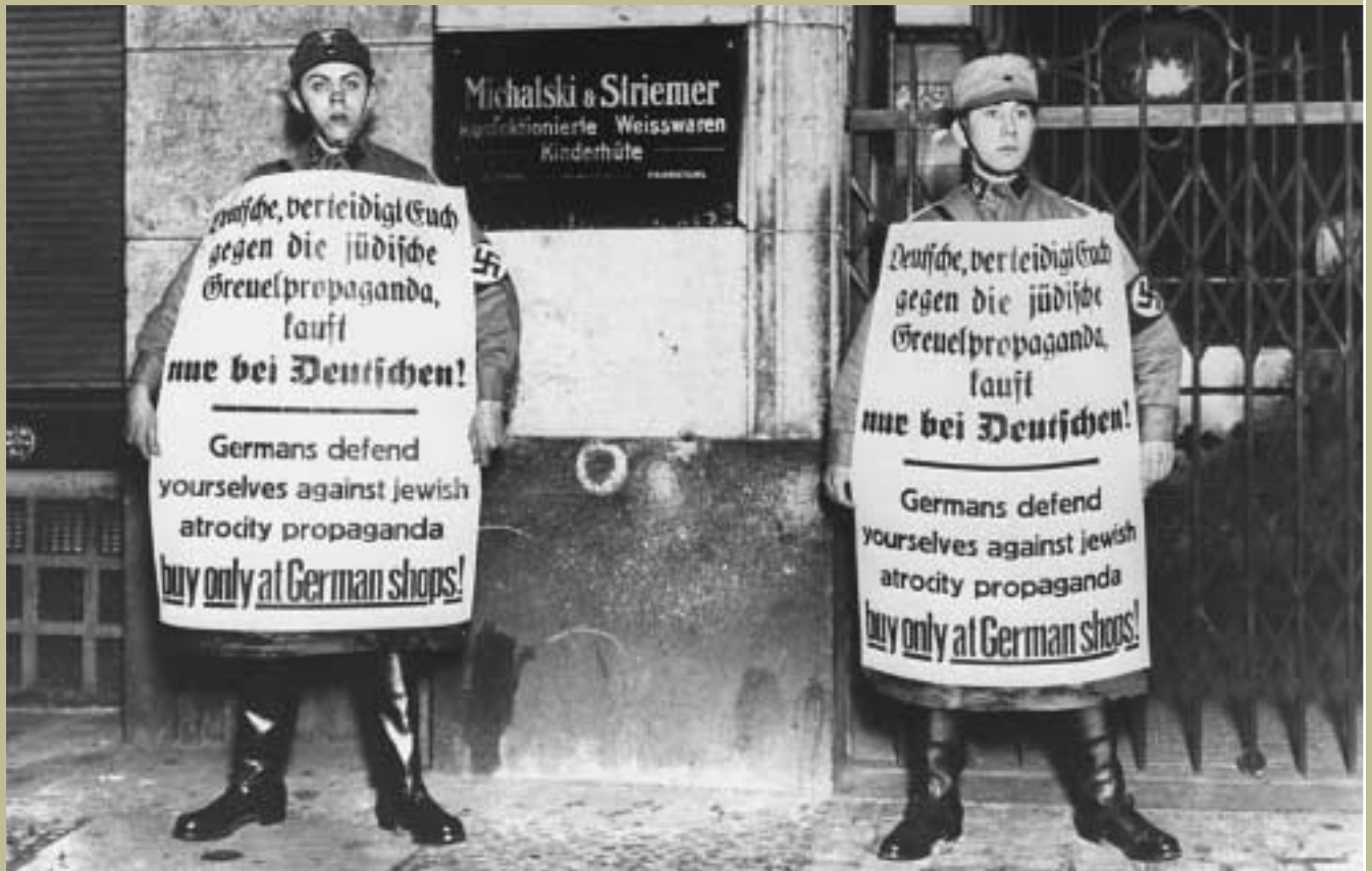
Two members of the SA encourage the boycott of Jewish-owned businesses. (April 1, 1933)