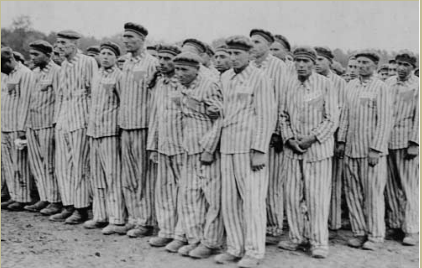
Prisoners stand during a roll call at the Buchenwald concentration camp in Germany. (ca. 1938–1941)