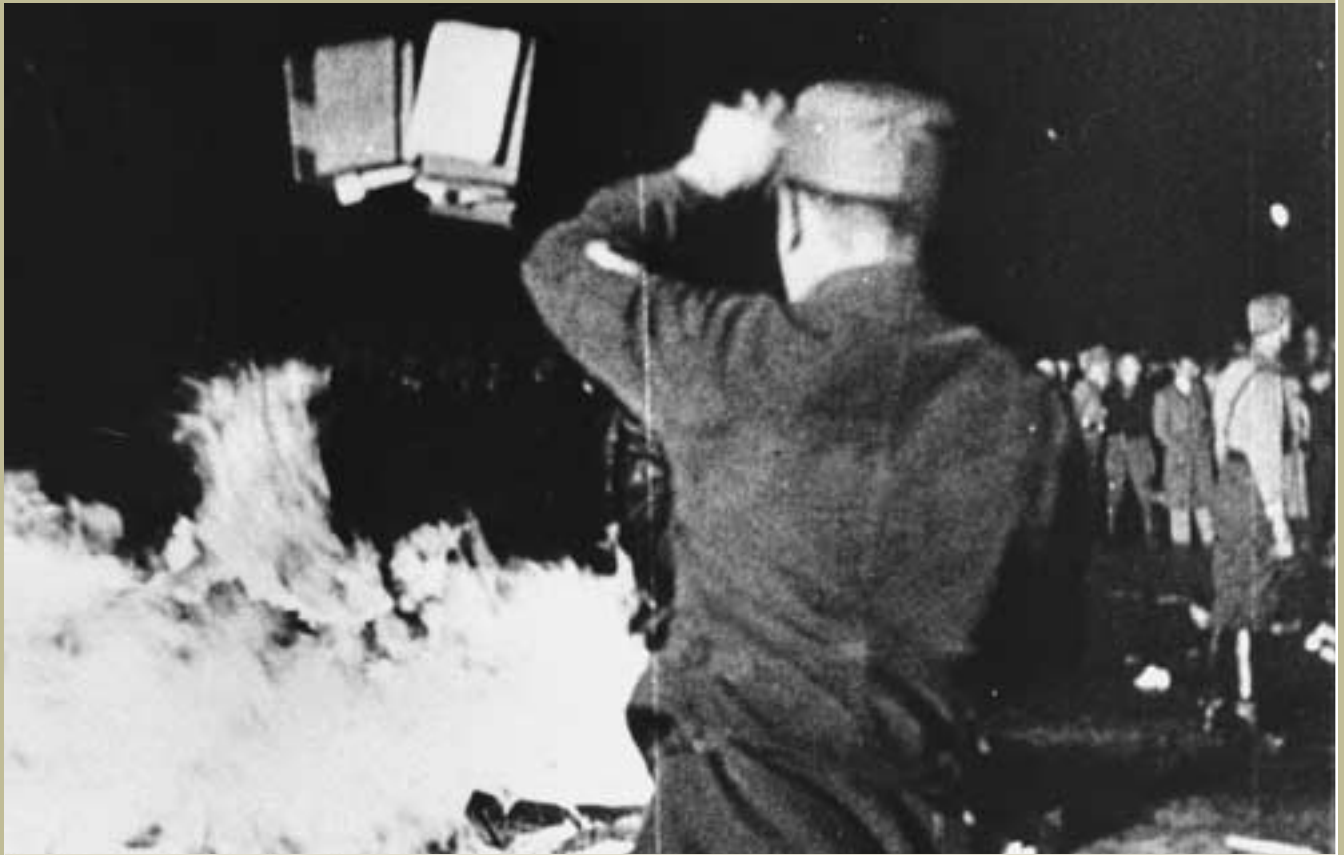
A member of the SA throws confiscated books into a bonfire during the public burning of "un-German" books in Berlin, Germany. (May 10, 1933)