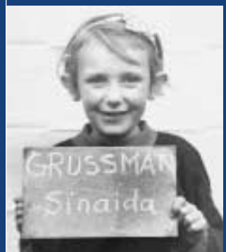
DP Camp, 1945

United States Holocaust Memorial Museum 100 Raoul Wallenberg Place, SW Washington, D.C. 20024-2126 www.ushmm.org