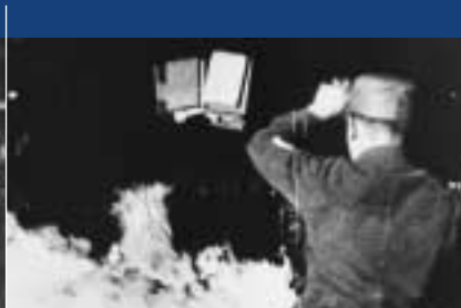
Book Burning, 1933