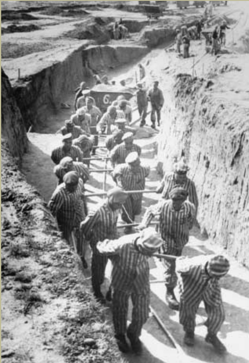
Under SS guard, prisoners perform forced labor in the Mauthausen concentration camp in Austria. (1942)