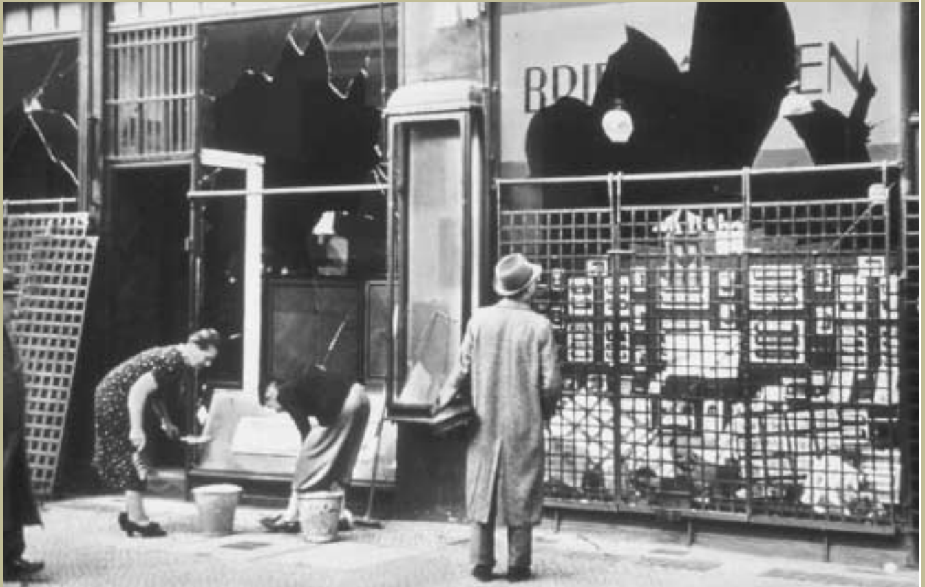
These shops in Berlin were among more than 7,000 Jewish-owned businesses that were vandalized in anti-Jewish riots known as Kristallnacht ("The Night of Broken Glass"). (November 10, 1938)