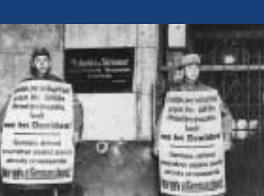
SA Boycott, 1933