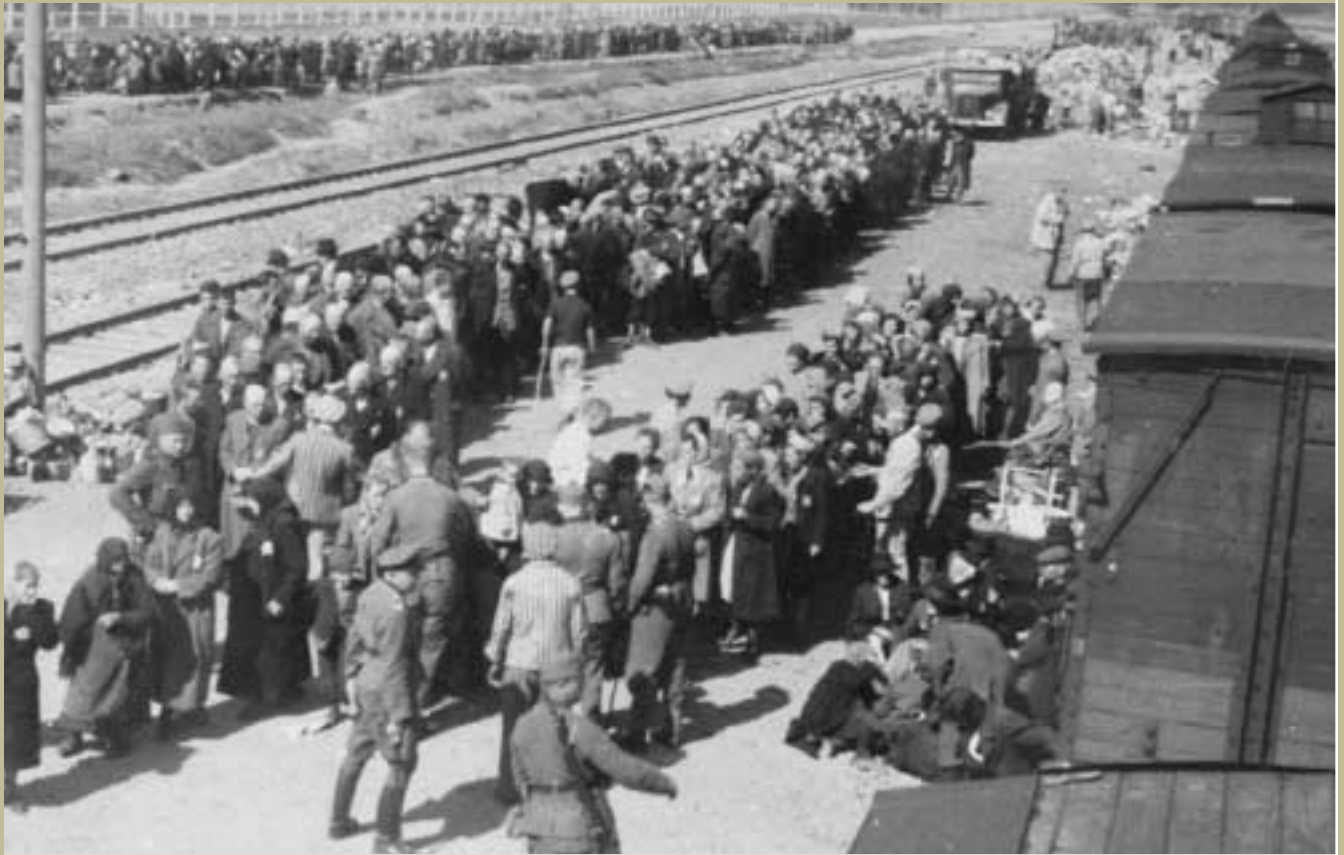
Members of the SS separate Hungarian Jewish men from women and children upon arrival at the Auschwitz-Birkenau killing center in Poland. After separating the victims by gender, the SS selected individuals for either forced labor or murder in gas chambers. (spring 1944)