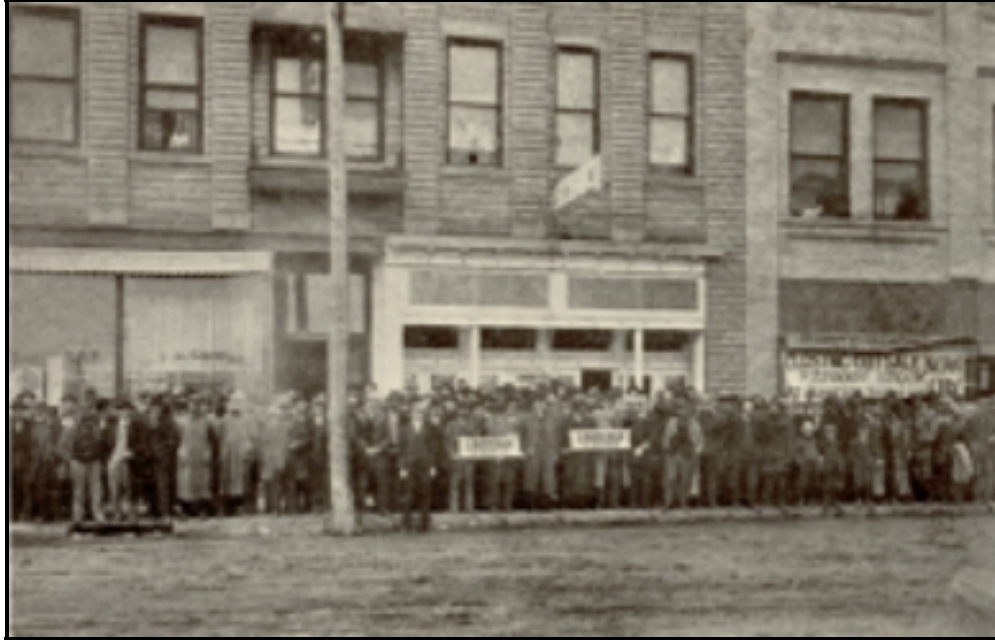
Lindbergh-for-Governer meeting at Detroit Lakes, Minnesota, April 26, 1918, Lindbergh standing between banners.