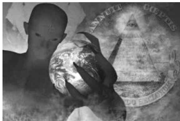
Pax Americana (Anon.)

"Taylor concluded, 'That means the question of who is guilty of starting the war must be avoided at all costs . . . it must not be allowed to come up.' That, however, would be possible only if Jackson could succeed as lawmaker, in setting up the rules of the game for a perfect trial by simply forbidding all discussion of the causes of the war before the tribunal. Jackson took Taylor's remarks as his guidelines and remarked: 'If all documents and statements to this effect are rejected by the court as irrelevant or unimportant, the war policies of the Western Powers, Poland and the USSR cannot be discussed.'