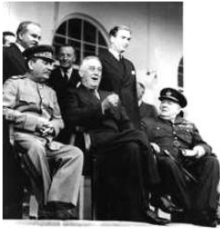
Troika: Stalin, Roosevelt, and Churchill

"To this Jackson retorted: 'Who's talking about a fair trial? Of course the Germans will try to accuse the Allies of pursuing a policy that forced them into war. I expect that, since I know about the documents seized from the German Foreign Office. They all come to the same conclusion: "We have no way out. We must fight; we are encircled; we are being strangled:" Well, it would be a catastrophe if this trial got into a discussion about the political and economic causes of the war. That could cause an unending disaster in both America and Europe . . . .