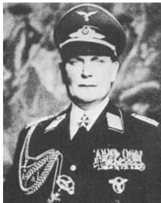
Reichsmarschall Hermann Goering

" 'At the end, the whole thing would turn into an international tribunal,' Falco lamented. At this point Jackson dropped his mask. His response was, 'You must understand that it is not going to be just an international tribunal, but an international military tribunal! And nobody will have a say about its composition except we and we alone. All the judges will be picked from countries that took part in the War. We will be the ones who frame the court charter, determine the composition of the court, and write the legal code for the court. We will be the court prosecutors and the court judges. In this trial neither the accused nor the witnesses will have a right to testify freely, except perhaps Hermann Göring.'