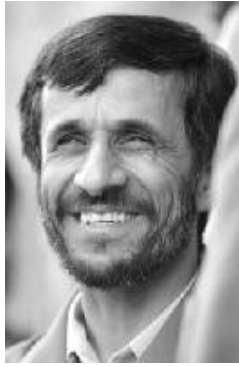
President Mahmoud Ahmadinejad

"The Bundesrepublik, along with the Basic Law, is doomed to vanish on the day when 'a constitution goes into effect that has been created by the German nation in a free election.' (Article 146 of the Basic Law.) This will be the day when the German nation through its Reichsordnende Versammlung (Constitutional Convention) officially rejects the historical falsifications sponsored by the enemies of the Reich and reclaims its sovereignty. That day is coming sooner than you think. The Tehran conference will greatly facilitate the dissolution of the Federal Republic, since it is constructed on a great lie that will be demolished in Tehran: the Holocaust Lie.