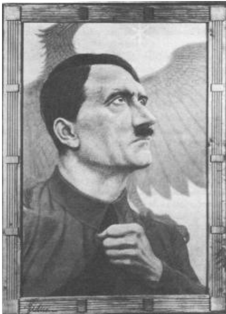
Adolf Hitler (Fidus, 1941)