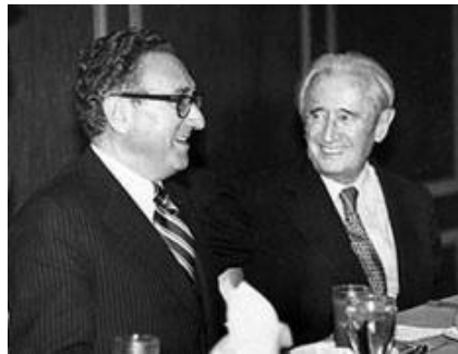
Nahum Goldmann (R) with Henry Kissinger