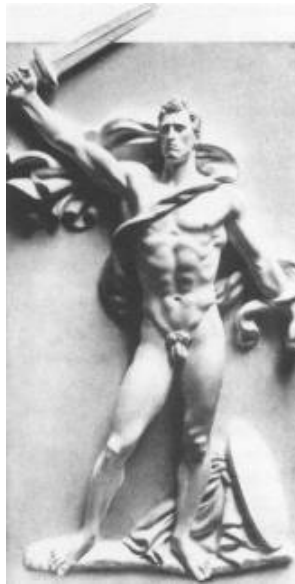
Arno Breker: 'Departure of the Warrior' (1942)