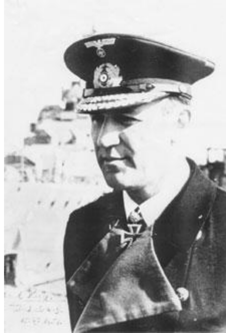
"Quarter-Jew" Admiral Bernhard Rogge wearing the Ritterkreuz; he received Hitler's Deutschblütigkeitserklärung . (Military awards: oak leaves to Ritterkreuz, Ritterkreuz, samurai sword from the emperor of Japan, EKI, and EKII.)