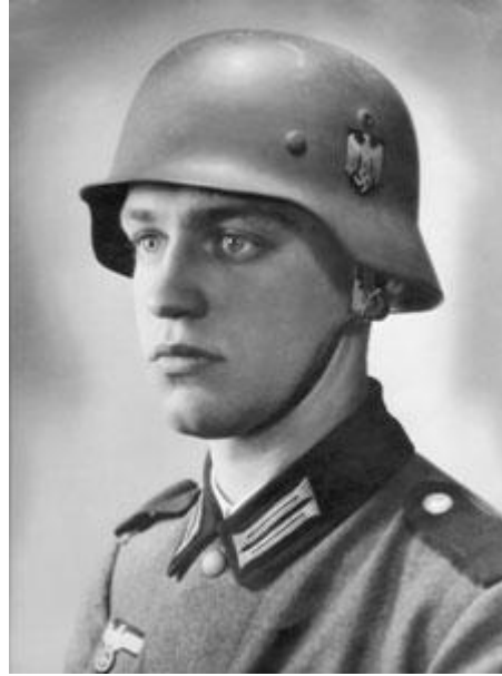
This photo of "half-Jew" Werner Goldberg, who was blond and blue-eyed, was used by a Nazi propaganda newspaper for its title page. Its caption: "The Ideal German Soldier."