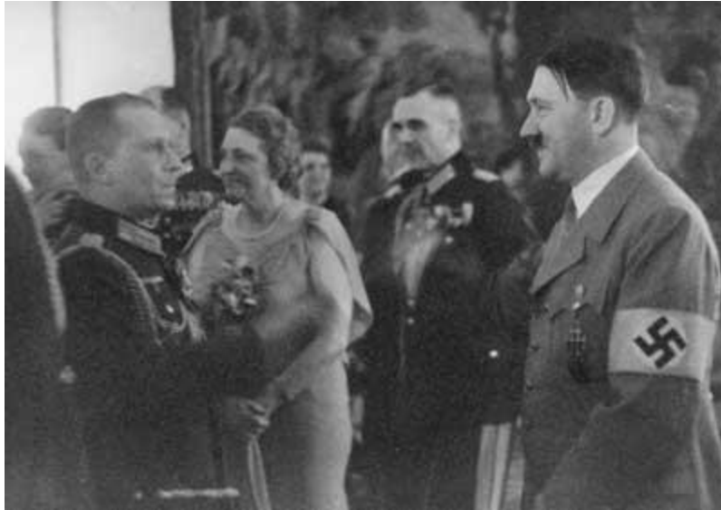
General Gotthard Heinrici, who was married to a "half-Jew," meeting Hitler in 1937.

Ritterkreuz for his performance during the campaign in Norway in 1940.