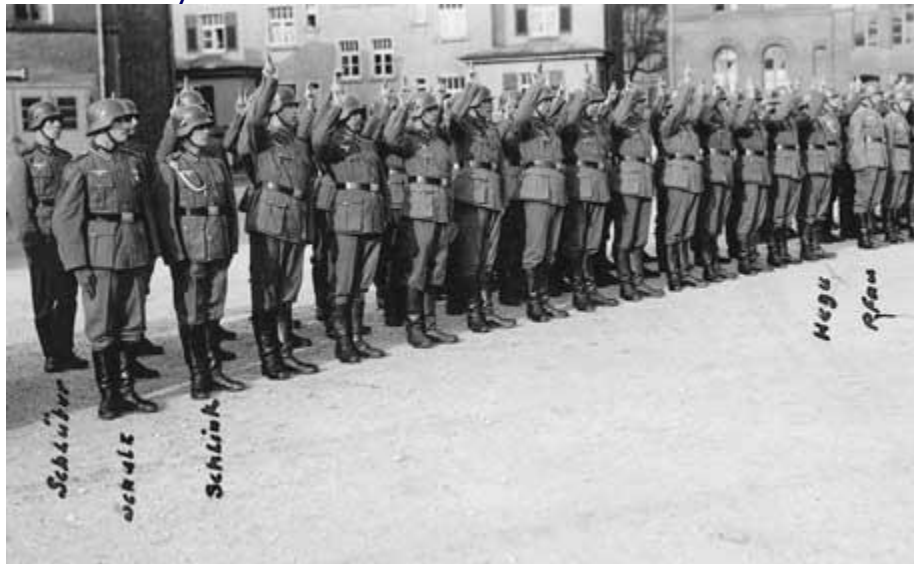
Soldiers taking the oath of allegiance to Hitler