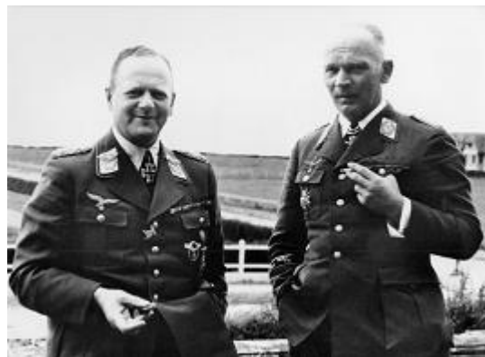
"Half-Jew" and field-marshal Erhard Milch, left, stands with Gen. Wolfam von Richthofen. Hitler declared Milch an Aryan.

Since his German wasn't so good, he asked an elderly man sitting next to him to translate the film, which tells the story of Shlomo Perel, a Jew who survived the Holocaust by falsifying his identity - and who served in the German army for part of World War II.