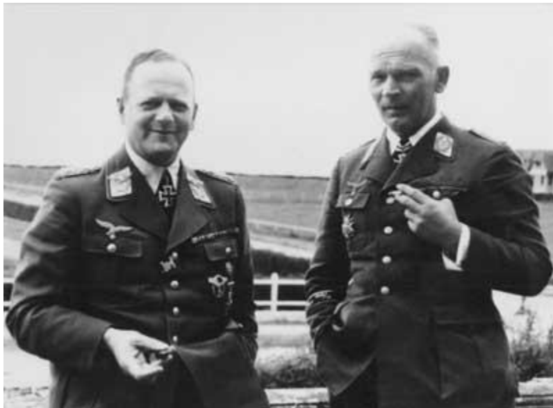
"Half-Jew" and field-marshal Erhard Milch (left) with General Wolfram von Richthofen. Hitler declared Milch Aryan. He was awarded the