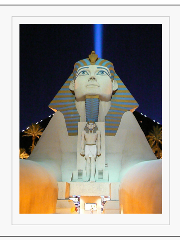
Great Sphinx of Giza and the Luxor Sky Beam, exterior view