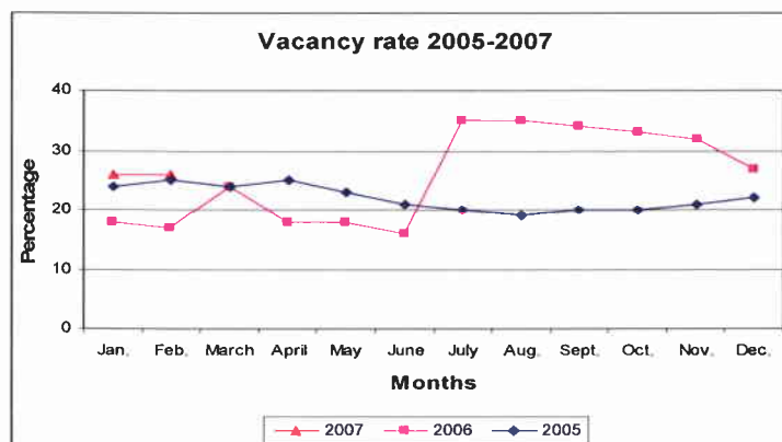
Figure 2: Vacancy rates from 2005-2007

9. Table 1 below shows the average vacancy rates for the three categories of civilian personnel, i.e. national, international and UNVs from January 2005 to February 2007. During this period, the overall average vacancy rate for the national and international staff categories was 26 per cent, and 12 per cent for UNVs. The creation of new local posts for regional offices, according to the Personnel Section, was the major reason for the 27 per cent vacancy rate in national posts in 2006. In the case of international staff, the Personnel Section explained that candidates preferred postings to other peacekeeping missions where the prevailing security situation and financial benefits were perceived to be better than in UNAMA. There were also instances where the total number of outgoing international staff members was greater than the number of those joining the mission in a year. For example, in 2005, only 55 international staff members joined the Mission, while 68 staff separated. As of March 2007, there were 75 international and 204 national vacancies.