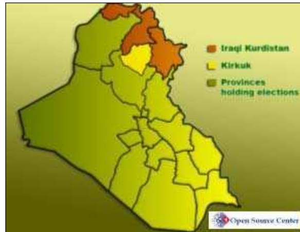
Provinces Holding Elections (13 January 2009)

According to an IHEC official quoted by Al-Malaf.net , the elections will be held in 14 out of Iraq's 18 governorates . The elections will not be held in the governorates of Arbil, Dahuk, Al-Sulaymaniyah, and Kirkuk, the official added. She also reported that the " number of voters is [approximately] 14,780,000 in the 14 governorates, that the number of polling centers is 6,500 , and that the number of seats is 440" (3 December 2008).