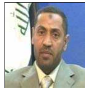
Umar al-Juburi (intg-iq.com, 22 December 2008)