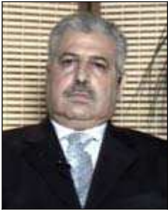
Athil al-Nujayfi ( www.iraqyoon.net , 22 December 2008)

Unified National Al-Hadba Grouping , led by Athil Abd-al-Aziz Muhammad al-Nujayfi (IHEC website, 22 December 2008).