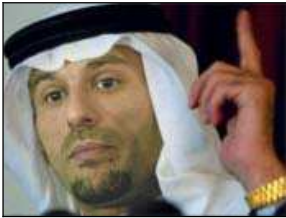
Ali al-Sulayman

The National Front for the Salvation of Iraq , led by Ali Hatim al-Sulayman (IHEC website, 22 December 2008).