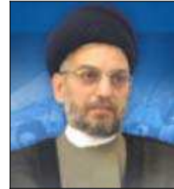
Abd-al-Aziz al-Hakim ( www.almejlis.org , 22 December 2008)

The Independent Grouping for Iraq , led by Adil Abd-al-Mahdi Hasan Shabbar (IHEC website, 22 December). No further information.