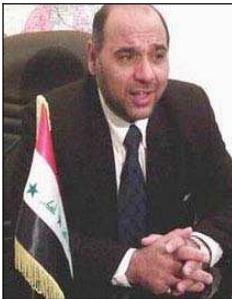
Abbas al-Bayyati (www.alsumaria.tv, 1 November 2007)