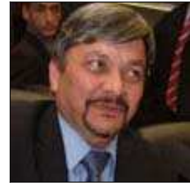
Ibrahim al-Ulum (iraqidev.com, 17 July 2008)

Party Description: Independent political entity formed by Dr Ibrahim Muhammad Bahr al-Ulum, former minister of oil (islamonline.net, 1 January 2005). Muntasir al-Amarah, a prominent member of the grouping, noted that the grouping comprises figures who are not supported by any internal or foreign parties and who depend on their own money to run in the elections. He criticized the ruling parties in Iraq for failure to shape economic and administrative policies that are appropriate to the Iraqi society (www.almowaten.com, 15 December 2008).