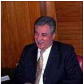
Hamid Musa (www.iraqcp.org, 22 December 2008)

Iraqi Communist Party , led by Hamid Majid Musa (IHEC website, 22 December 2008).