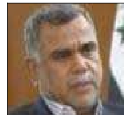
Hadi al-Amiri ( www.newstin.ae , 23 December 2008)

Party Description: The Badr Organization is the Iranian-trained wing of the Iraqi Islamic Supreme Council, the largest Shiite party in Iraq. During the US-led crackdown on militia groups in 2003, the 10,000-strong militia changed its name from the Badr Brigade to the Badr Organization of Reconstruction and Development and pledged to disarm. The group, however, has reportedly remained armed, and today operates mainly in Shiite-controlled southern Iraq, where a number of local governments are dominated by the IISC's representatives. Sunni leaders have accused the Badr Organization of revenge killings against Sunni clerics and unlawful kidnappings ( www.cfr.org , 9 June 2005).