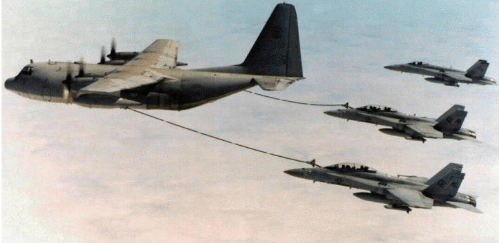
Figure 2. USMC KC-130 Refueling F/A-18s with Hose-and-Drogue

A single flying boom can transfer fuel at approximately 6,000 lbs per minute. A single hose-and-drogue can transfer between 1,500 and 2,000 lbs of fuel per minute. Unlike bombers and other large aircraft, however, fighter aircraft cannot accept fuel at the boom's maximum rate. (Today's fighter aircraft can accept fuel at 1,000 to 3,000 lbs per minute whether from the boom or from the hose-and-drogue.) 2 Thus, the flying boom's primary advantage over the hose-and-drogue system is lost when refueling fighter aircraft.