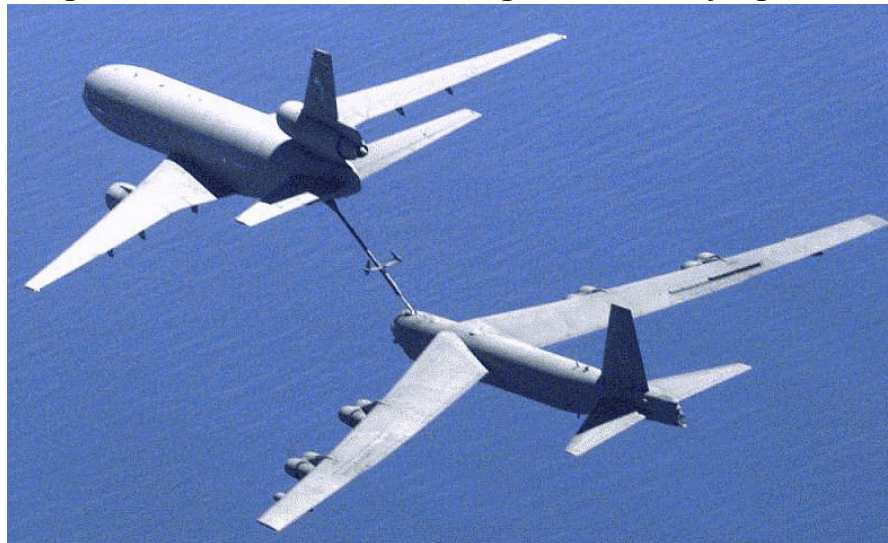
Figure 1. USAF KC-10 Refueling B-52 with Flying Boom

Air Force helicopters, and all Navy and Marine Corps aircraft refuel using the “hose-and-drogue.” NATO countries and other allies also refuel with the hose-and-drogue. As its name implies, this refueling method employs a flexible hose that trails from the tanker aircraft. A drogue (a small windsock) at the end of the hose stabilizes it in flight, and provides a funnel for the aircraft being refueled, which inserts a probe into the hose. ( Figure 2 ). All boom-equipped tankers (i.e., KC-135, KC-10), have a single boom and can refuel one aircraft at a time with this mechanism. Many tanker aircraft that employ