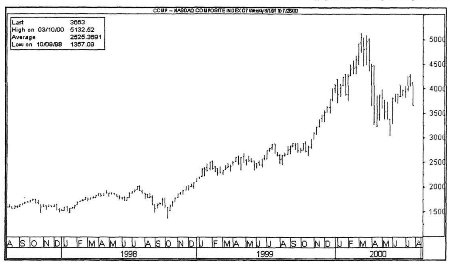
Chart 3.2: NASDAQ Composite Index