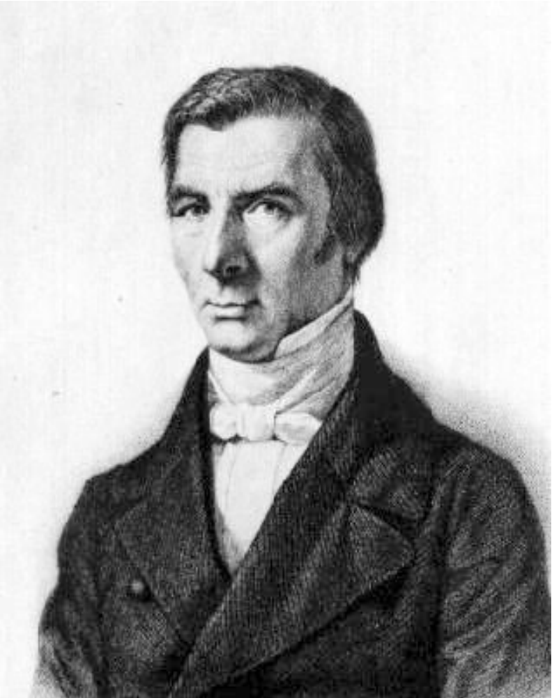
Claude Frédéric Bastiat, the Great French Classical Liberal theorist, political economist and member of the French assembly.