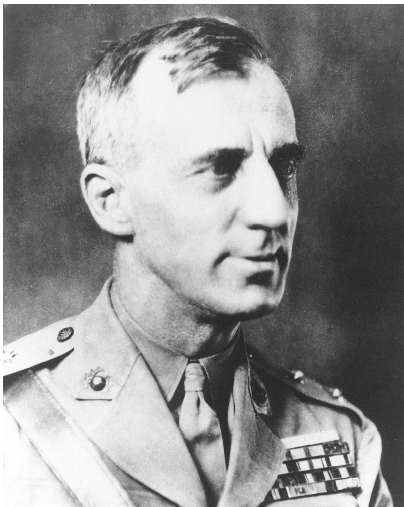
Major General Smedley D. Butler