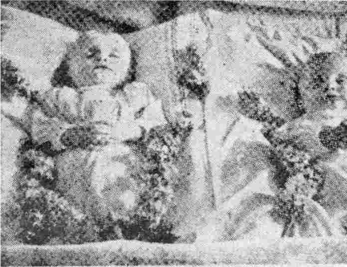
Rita and Eberhard Kandlbinder

is apparent that the child is well and healthy—and unvaccinated. The fathers (in England) who refused to have their children serve prison terms under compulsory vaccination but many of them accepted this punishment in order to save their children from the deadly effects of vaccination.