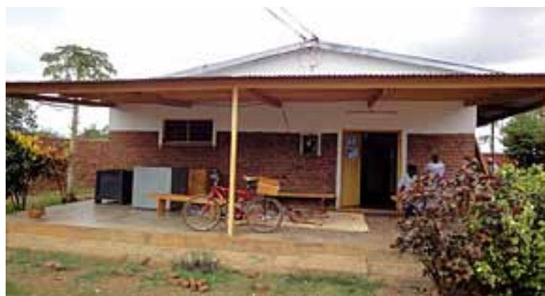
Jim's bike at the Herbal Clinic

Finally, after spending a thousand in one month, I bought a bicycle. It cost $100 and I had one of the carpenter shops make a wooden box and mount it on the back. The box was big enough for most of the things I carried and if something was too big, I tied it on top of the