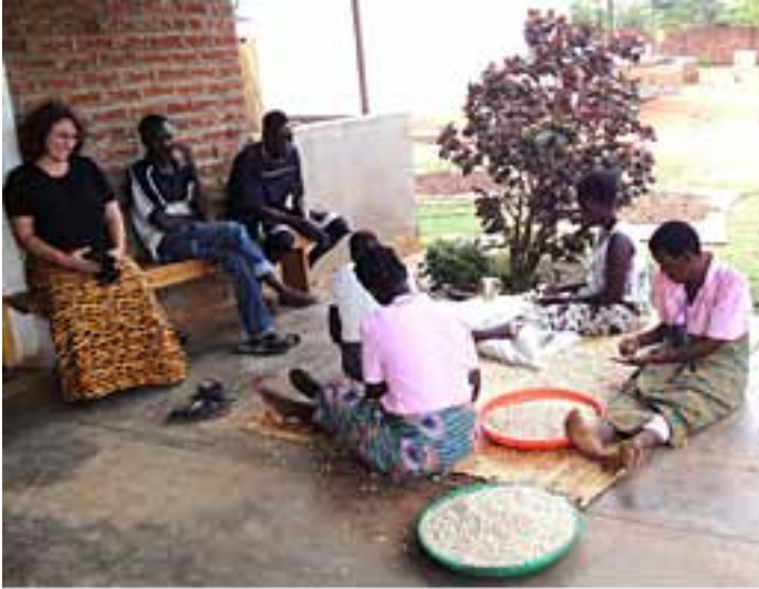
Making herbal powder at the Herb Clinic

Within the first week they had all lost their various health complaints.