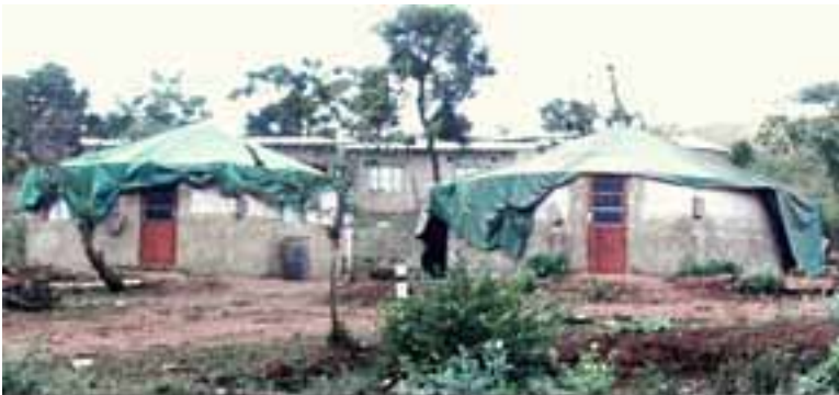
Round houses in the Zulu complex

These houses have no partitions. They are just a big round building with beds, TVs, couches, chairs, and other electronic items and clothes. The food is prepared and served in another house. Bathing is done outdoors, normally in a bucket of water. The weather is usually warm so this is possible most of the year. The toilet is an outhouse.