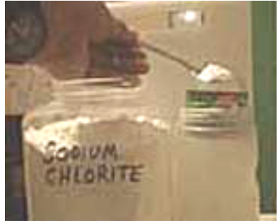
11 & 12. First container taped and marked. Add \text{NaClO}_2 to same mark.

At this point, if you did use a coffee pot for the mixing container, you could warm the water in the coffee pot on a stove, electric or gas. Do not boil the water. Do not put the \text{NaClO}_2 in the pot until you have removed it from the stove. Then add it and mix until dissolved.