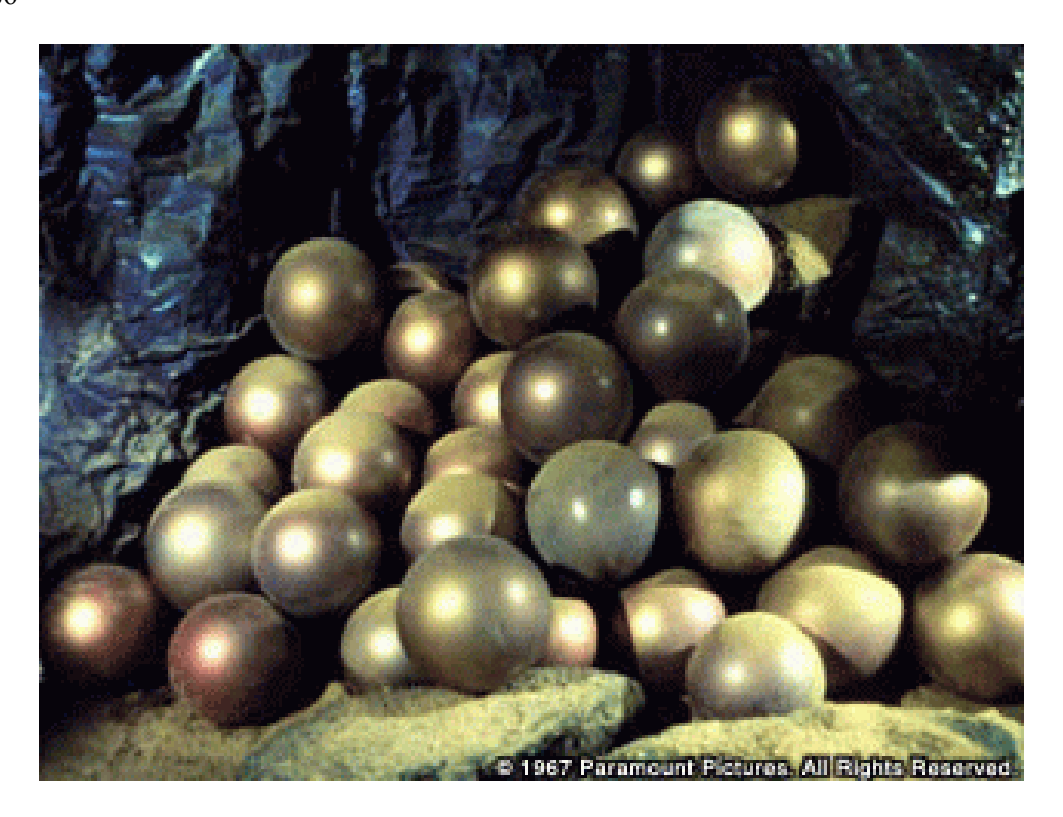
Figure 5. Biogenic silicon (eggs of the horta).

subsequently developed by a German ceramic lab—Institut für Keramische Technologien und Sinterwerkstoffen (Frauenhofer)—in 2002. It consists of sintered alumina creating a synthetic corundum and is named "transparent alumina." Episode: Star Trek IV: the Voyage Home (MPF), 1986