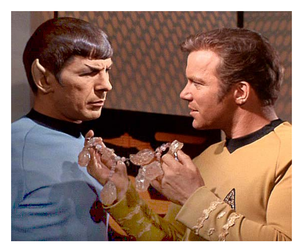
Figure 2. Leonard Nimoy (Mr. Spock) and William Shatner (Capt. Kirk) discussing the necklace of dilithium crystals.