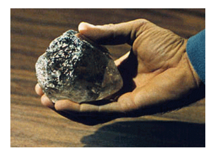
Figure 4. Captain Kirk holds a sample of "dilithium" ore (actually a smoky quartz crystal used as a prop).

A metallic substance of high density used by the Kelvin. Episode: By Any Other Name (TOS), 1968