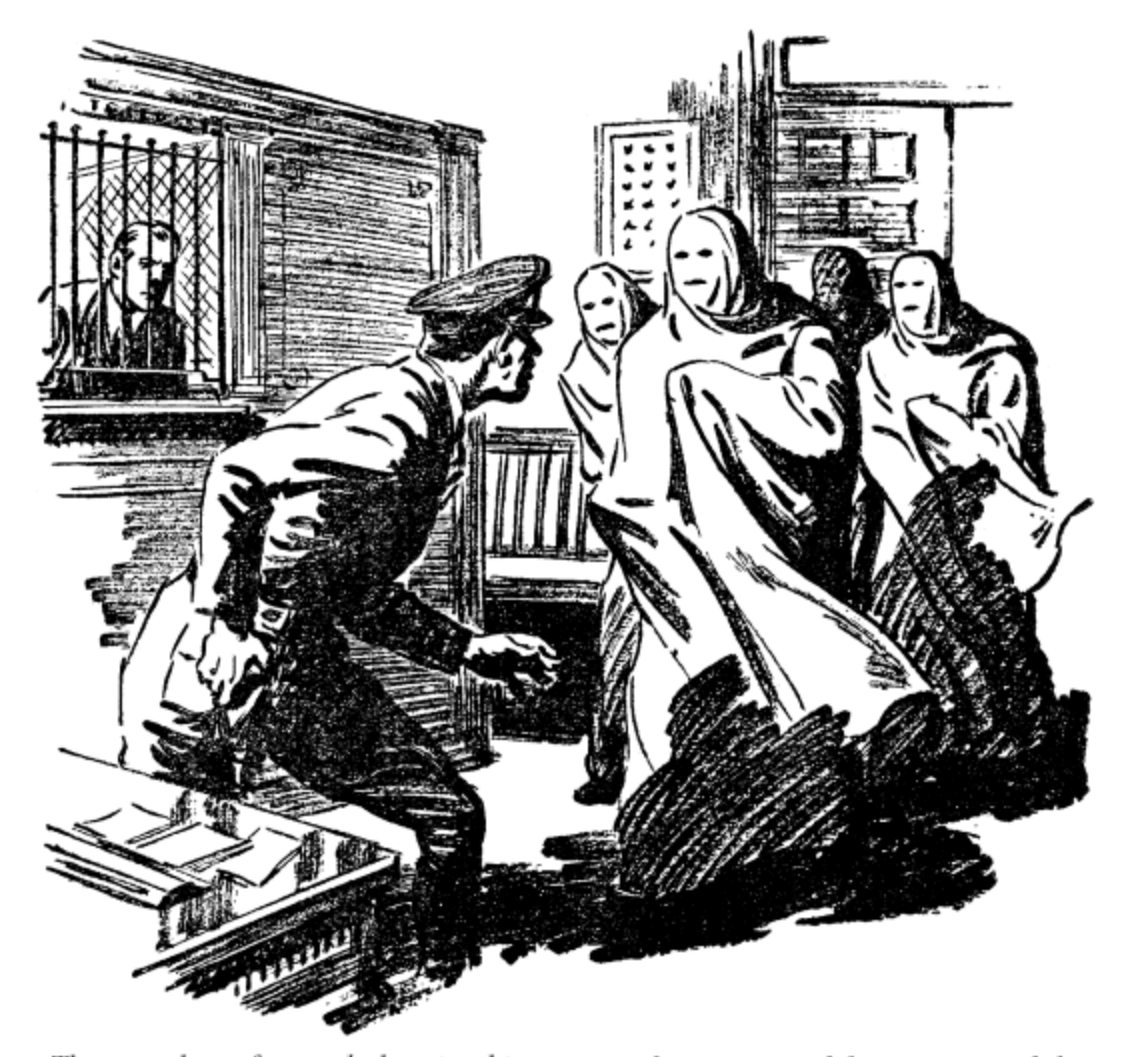
The guard ran forward, drawing his gun, as sheet-wrapped figures entered the bank. He emitted a howl of pain as he struck something that he could not see.

port. It was customary for the truck to call for the pay roll about ten thirty Friday mornings.