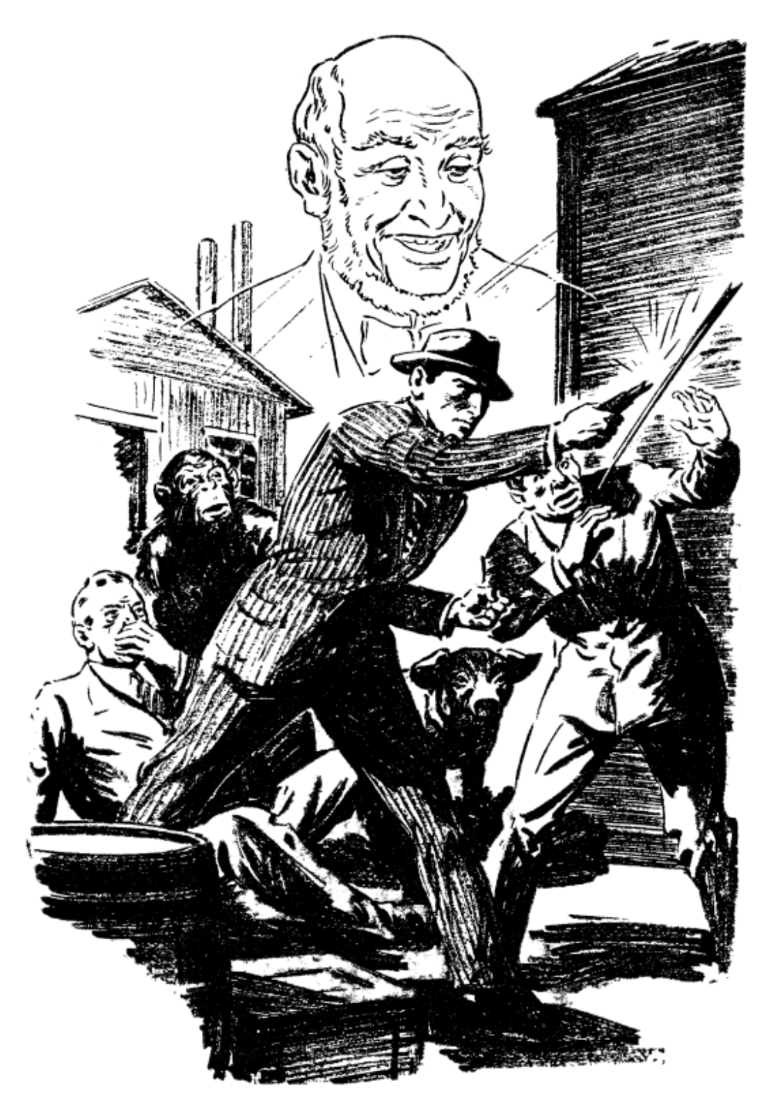
What is this thing that strikes out of empty air, that makes sane men fight back at nothing? Doc and his aids go ghost hunting to solve a murder.