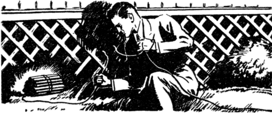
The cases of dynamite were plainly labeled. Doc broke the wires.

somebody else to go back and see what's wrong."