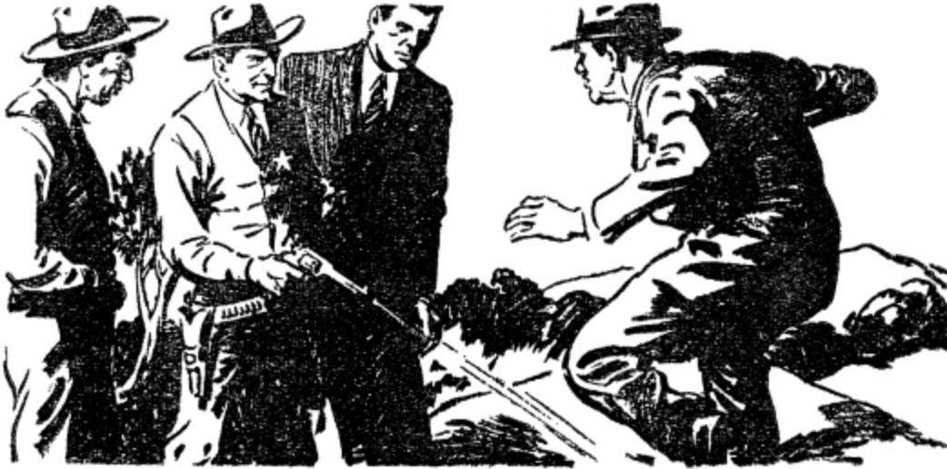
Sheriff Brander drew one of his six-shooters suddenly and did a wild-West shooting act.

NO one said anything. The sheriff looked at Doc, at the fat man, and chuckled. "They'll shoot the instant me or one of my deputies falls to the ground. For a pretty, I'd fall over now and see the excitement."