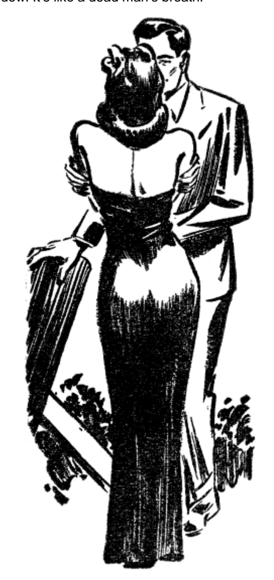
"I'm freezing to death. That dew is like a dead man's breath!"

yelled, "I'm freezing to death. That dew! I hate dew. It's like a dead man's breath."