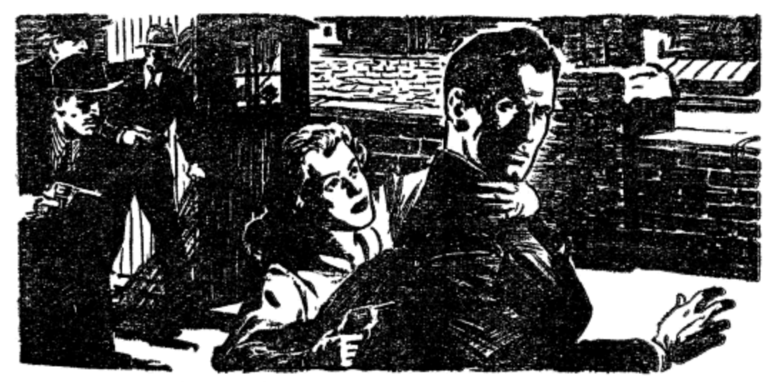
He heard footsteps and the young woman came up from behind and seized Doc around the neck.

"You can't fool me!" she cried. "I'm going to shoot."