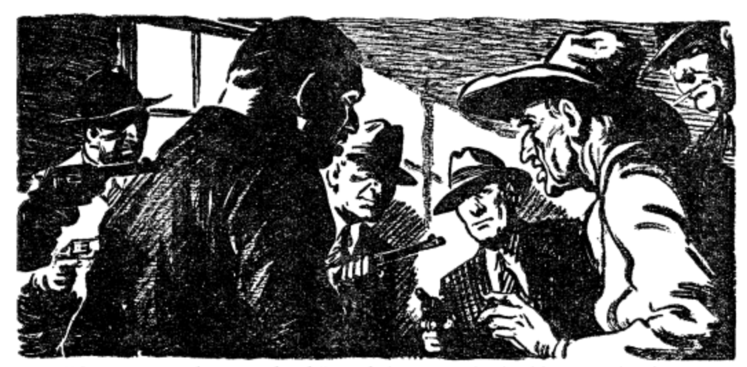
"One jump makes you dead," said the man who had been at the door.