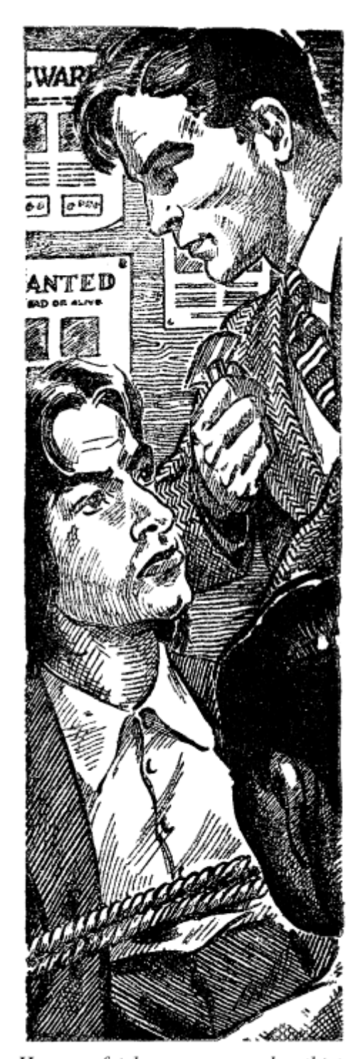
He was fairly young, under thirty. His features were heavy, cruel, and there was an ugly scar, long and deep, on his left cheek.

Speed explained, "Engine trouble. He's already got a service truck on the way. We won't have to stop."