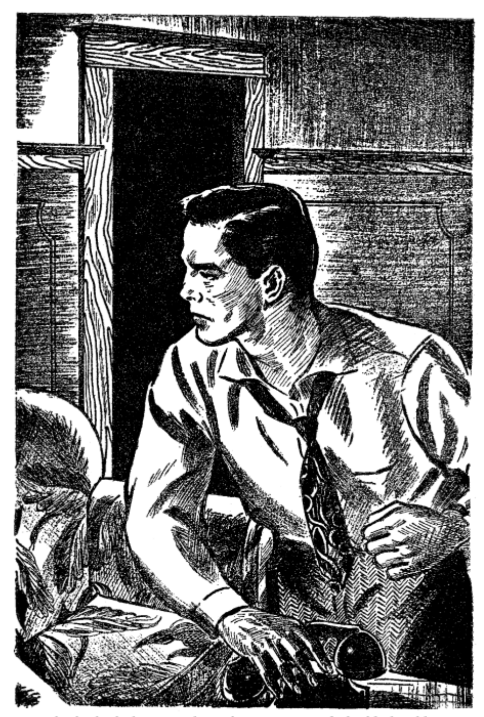
The locked door to the adjoining suite clicked behind him. He spun. The door was no longer locked . . . it was open!

Monk Mayfair couldn't make up his mind. He bent down before the model of a ranch-house type, squinted out of his round bright eyes, started measuring off footage with the first joint of his stubby thumb.