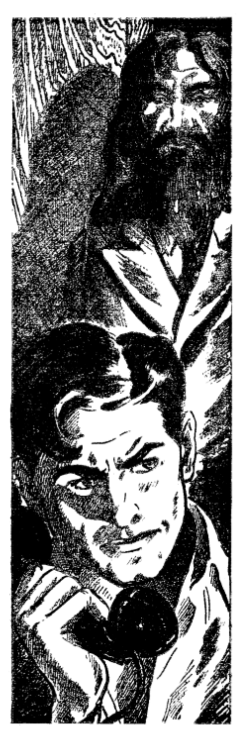
Doc became aware that a man was quietly watching him form the doorway. He was an odd-looking character.

"You haven't seen him, then?" The man shook his head slowly.