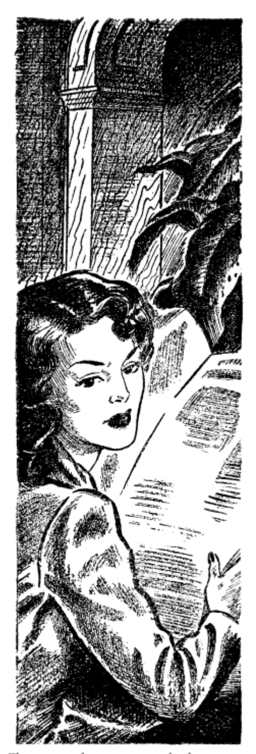
She sat alone, opened the paper and put it in front of her face. Ham knew she was watching the elevators.