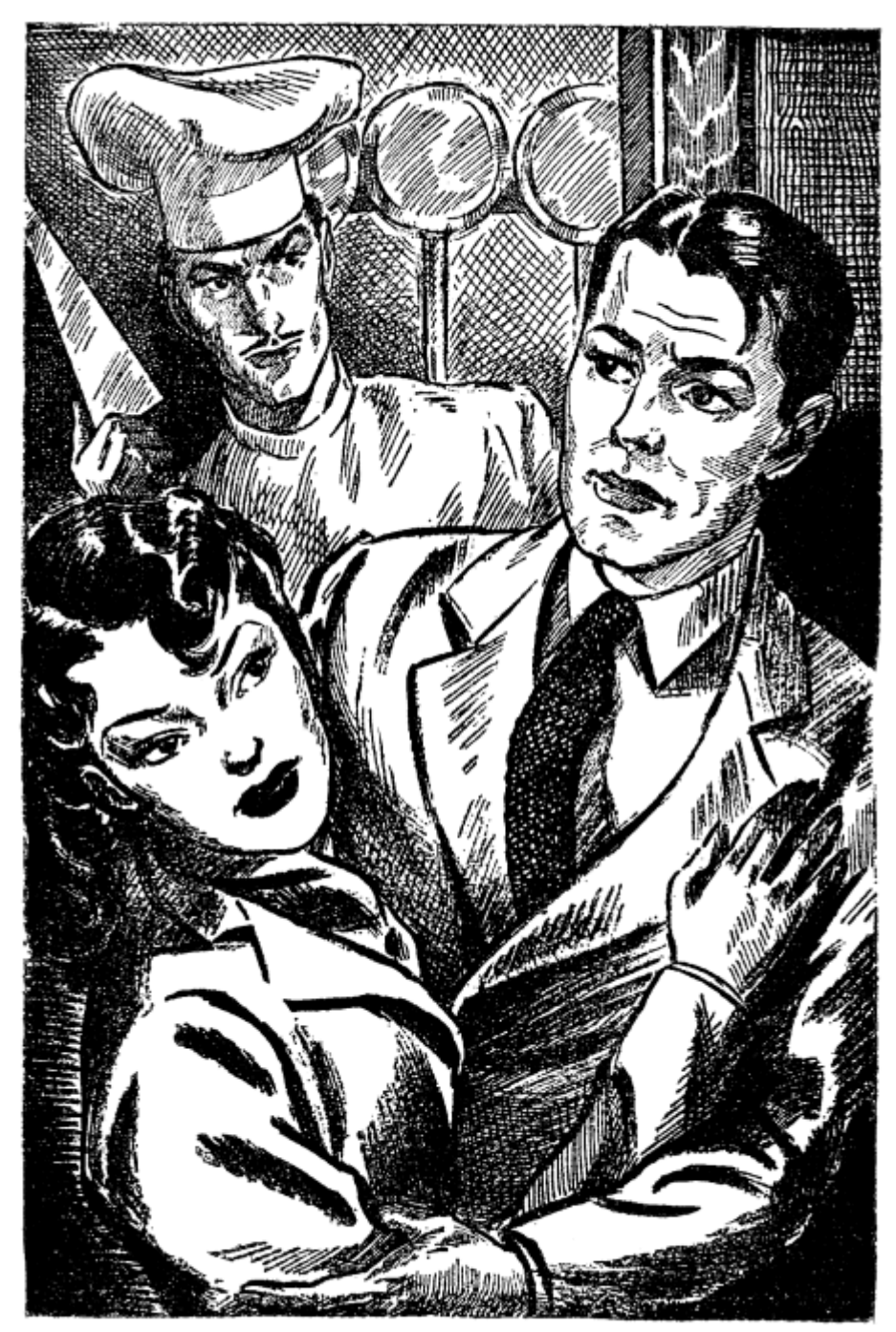
The man with the long-bladed, heavy sandwich-knife came across the service pantry and called out, "Say!"

The man came forward to investigate further, just as the redhaired girl slipped past him. She was gone in the time it took the chef to exclaim, "Say!" again. He blocked the lawyer's path. Also, he saw the silver creamers on the storeroom floor and started to look mad about that.