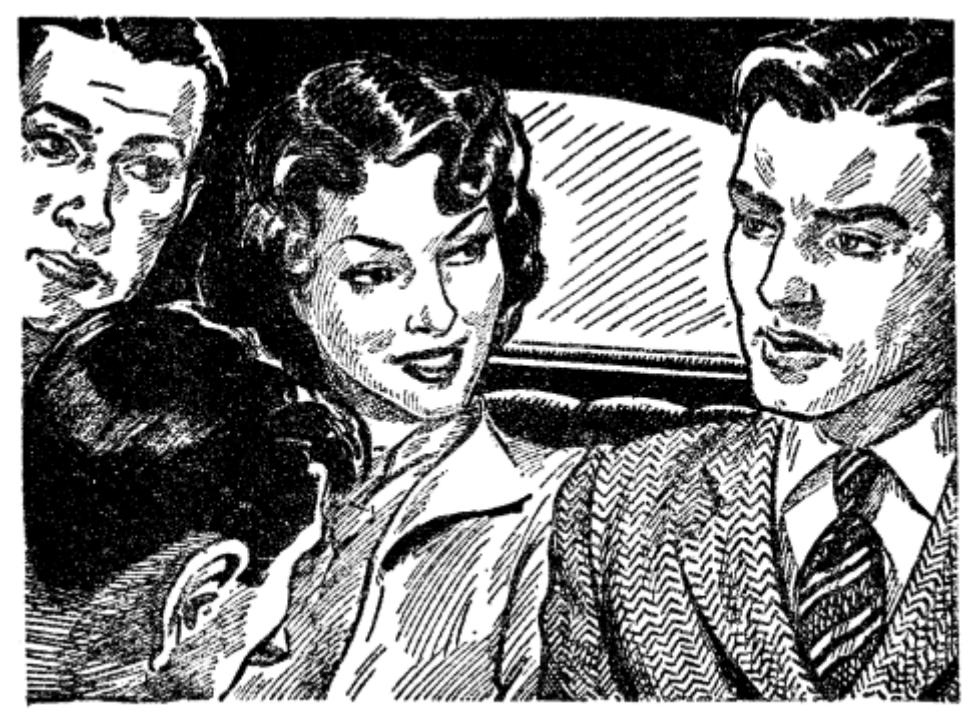
The girl sat between Doc Savage and Ham, while Monk, who rode in one of the jump seats, sat sideways and told Doc what happened aboard the cruiser.