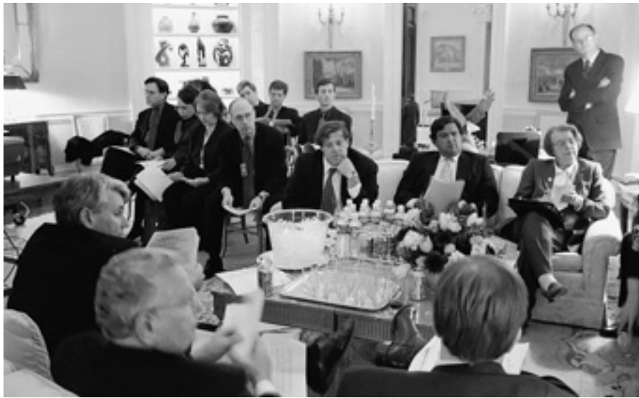
A strategy meeting in the Yellow Oval Room