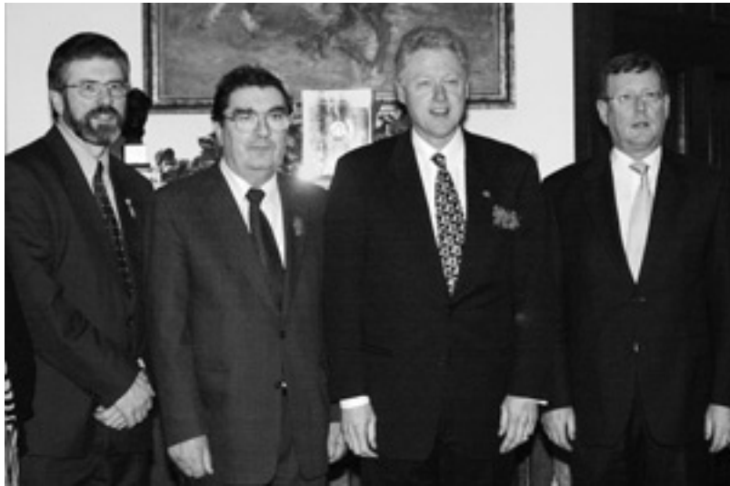
With Gerry Adams, John Hume, and David Trimble on St. Patrick's Day 2000