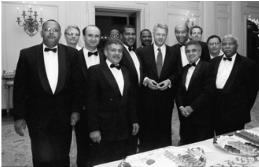
With the White House residence butlers and staff