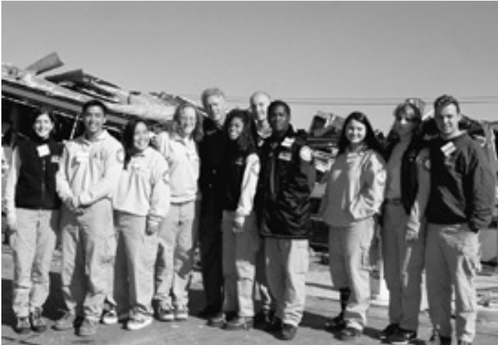
With AmeriCorps volunteers at a tornado site in Arkansas