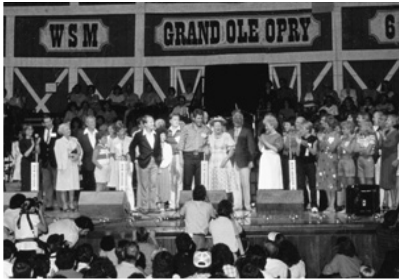
At the Grand Ole Opry, Nashville, during the governors' conference, 1984. I'm standing next to Minnie Pearl; Hillary is at the far left.