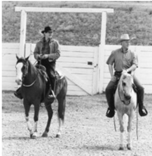
Riding with Harold Ickes in Montana