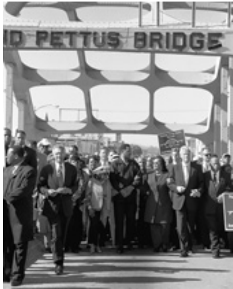
Commemorating the thirty-fifth anniversary of the voting rights march in Selma, Alabama, by crossing the Edmund Pettus Bridge with Jesse Jackson, Coretta Scott King, John Lewis, and other veterans of the civil rights movement who had marched arm in arm with Martin Luther King, Jr.