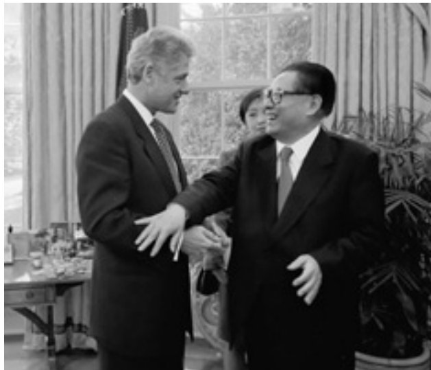
With Chinese president Jiang Zemin in the Oval Office