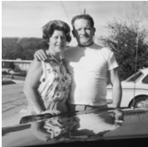
Mother and Daddy, 1965