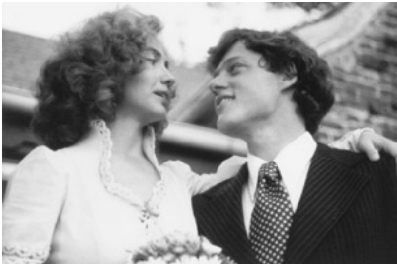
Our wedding day, October 11, 1975