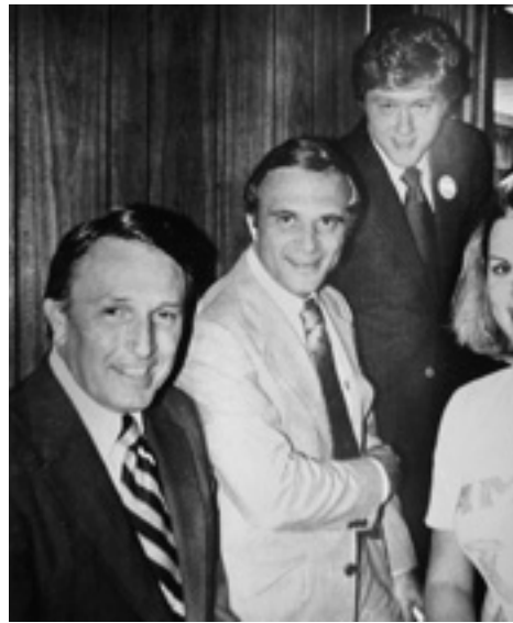
Campaigning with my gubernatorial predecessors Dale Bumpers and David Pryor