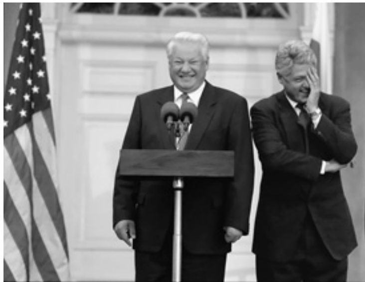
Russian president Boris Yeltsin and I in Hyde Park, New York