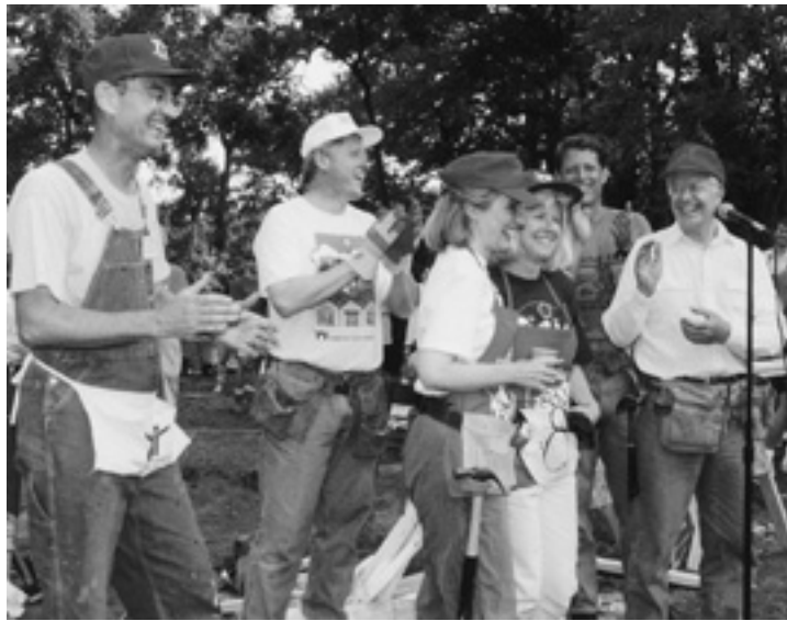
Hillary and I, Tipper and Al Gore, President Jimmy Carter, and (at left) Habitat for Humanity founder Millard Fuller celebrate Tipper's and my joint birthday.