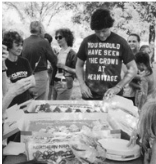
Celebrating my thirty-second birthday during the campaign. Hillary is in dark glasses.