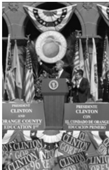
Promoting education at an event in California