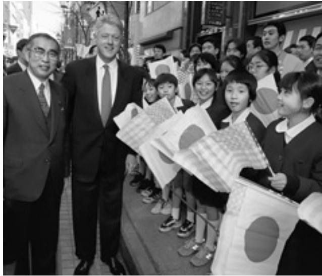
With Japanese prime minister Keizo Obuchi in Tokyo