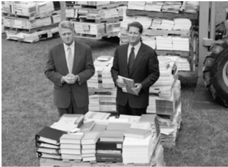
Al and I, on the South Lawn, announcing the elimination of forklifts of government regulations, part of our Reinventing Government initiative