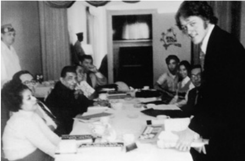
Campaigning for George McGovern in San Antonio, Texas, 1972