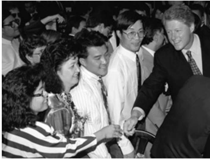
Greeting supporters in Los Angeles