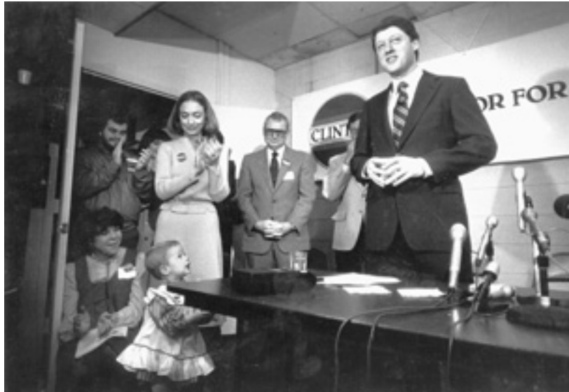
My announcement for governor in 1982. Hillary inscribed the picture "Chelsea's second birthday, Bill's second chance."