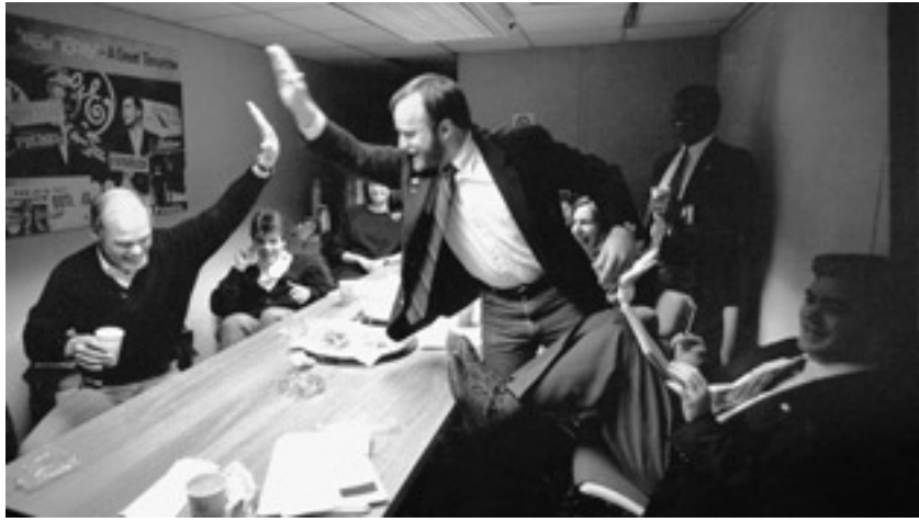
In the "war room" James Carville and Paul Begala high five