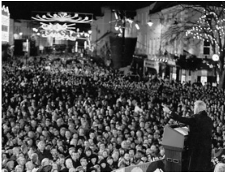
Addressing a crowd in Market Square, Dundalk, Northern Ireland