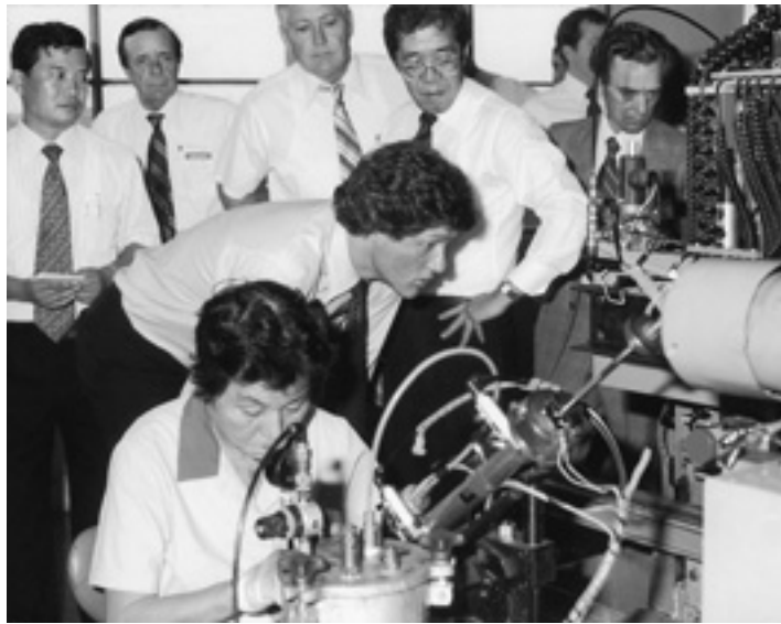
At the Sanyo Electric plant in Japan