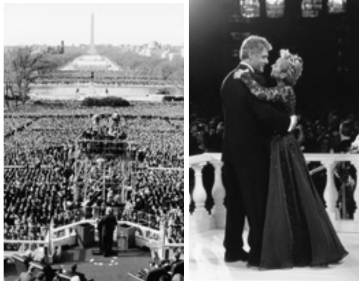
The inauguration and an inaugural ball, January 20, 1993