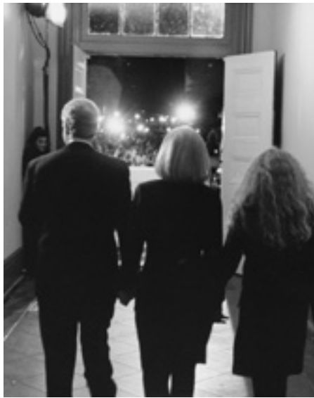
Election night, November 3, 1992