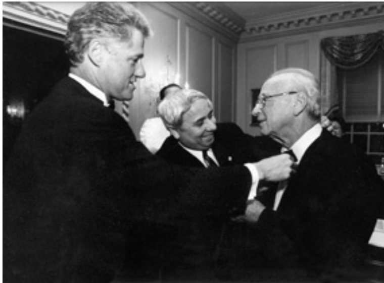
Straightening Prime Minister Yitzhak Rabin's tie. It would be our last time together.