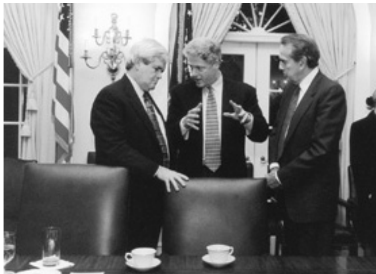
With Republican leaders Representative Newt Gingrich and Senator Bob Dole in the Cabinet Room