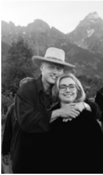
With Hillary in Wyoming