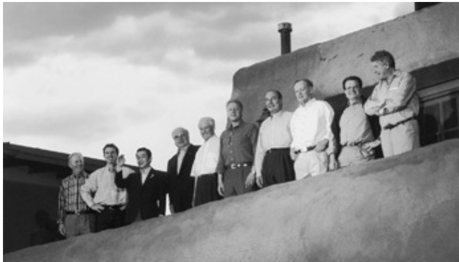
The G-8 meeting in Denver: (left to right) Jacques Delors, Tony Blair, Ryutaro Hashimoto, Helmut Kohl, Boris Yeltsin, me, Jacques Chirac, Jean Chrétien, Romano Prodi, and Wim Kok