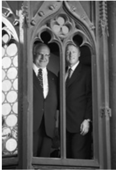
With German chancellor Helmut Kohl at Warburg Castle