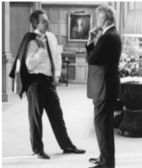
With Tony Blair at Chequers