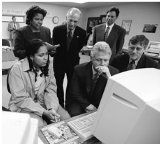
Bringing the Internet into America's classrooms, with Dick Riley