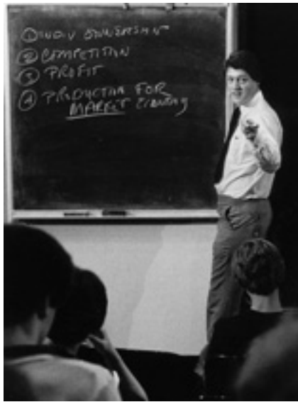
Teaching at the University of Arkansas Law School, Fayetteville