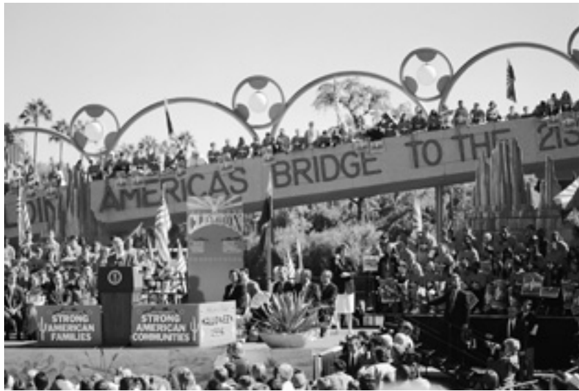
Speaking about America's bridge to the twenty-first century at Arizona State University