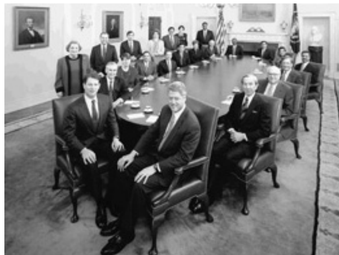
Al Gore and I with the cabinet: (standing, from left) Madeleine Albright, Mack McLarty, Mickey Kantor, Laura Tyson, Leon Panetta, Carol Browner, Lee Brown; (seated, from bottom left) Lloyd Bentsen, Janet Reno, Mike Espy, Robert Reich, Henry Cisneros, Hazel O'Leary, Richard Riley, Jesse Brown, Federico Peña, Donna Shalala, Ron Brown, Bruce Babbitt, Les Aspin, and Warren Christopher