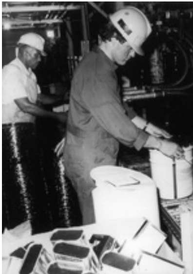
My workday at the Tosco plant