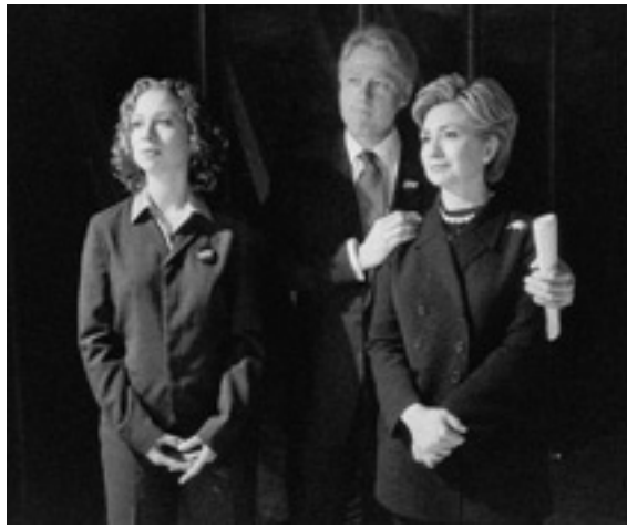
February 7, 2000: Hillary announces her campaign for the Senate