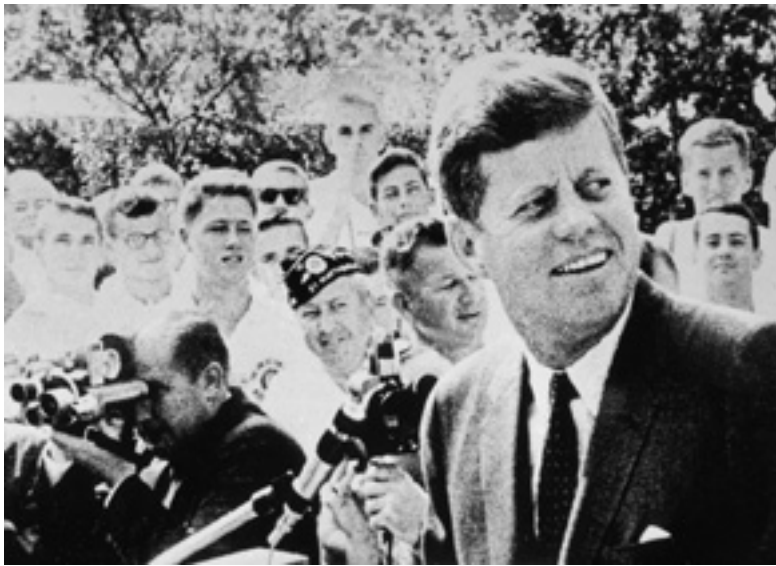
I'm in the front, right behind the photographer, as President John F. Kennedy addresses the Boys Nation delegates in the Rose Garden on July 24, 1963.