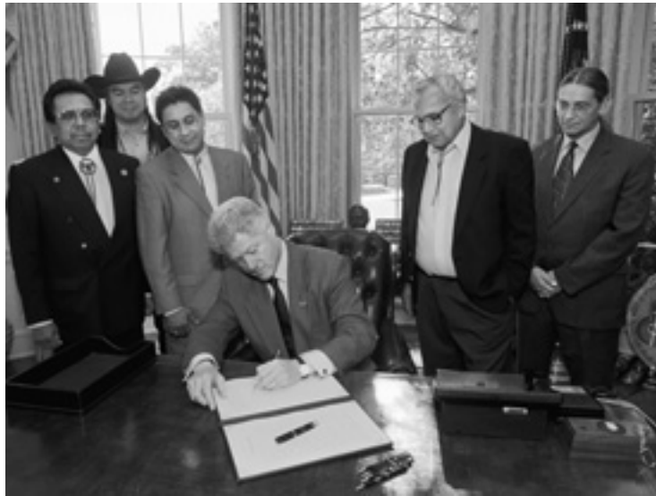
Signing an executive order with representatives of Native American Tribal Governments