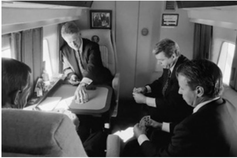
Playing cards with Bruce Lindsey, Doug Sosnik, and Joe Lockhart on Marine One