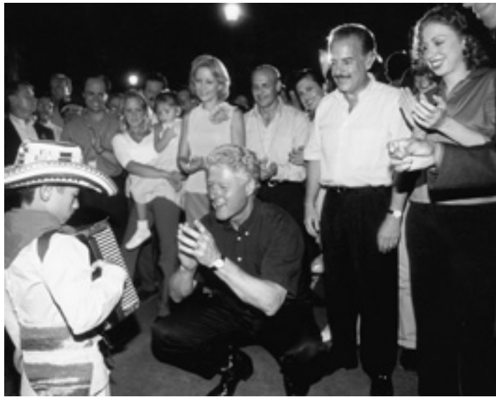
The Vallenato Children performing in Cartagena, with Chelsea and the president of Colombia, Andrés Pastrana