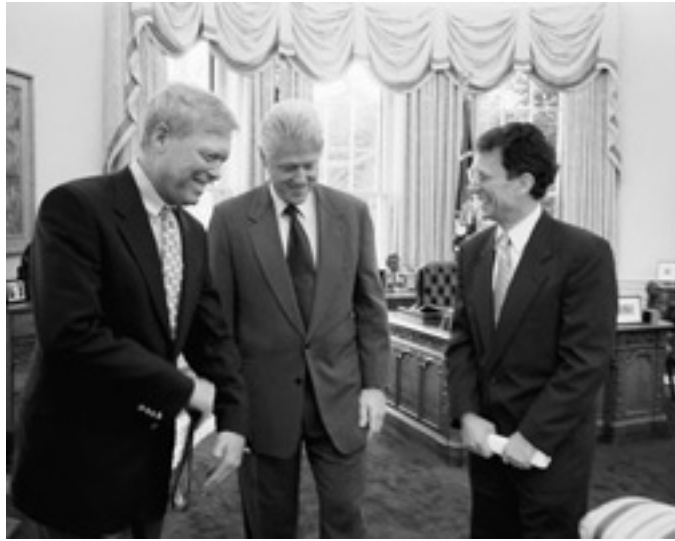
With Democratic leaders Representative Richard Gephardt and Senator Tom Daschle in the Oval Office