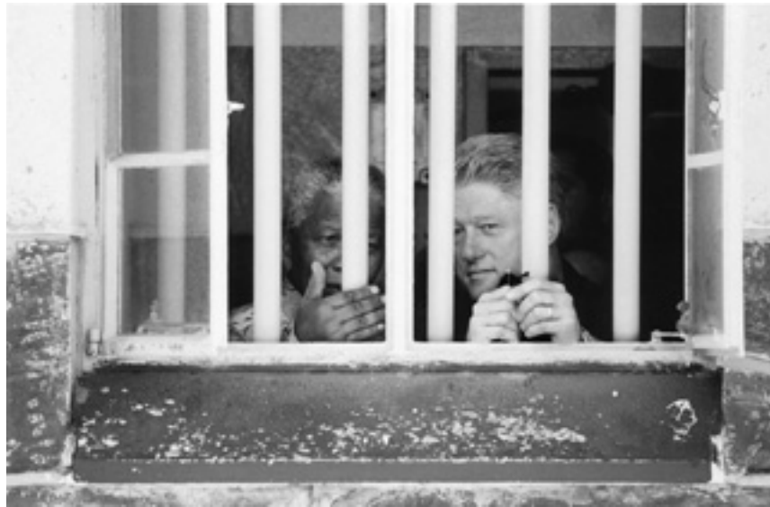
South African president Nelson Mandela and I in the cell on Robben Island, where he had spent the first eighteen of his twenty-seven years in captivity