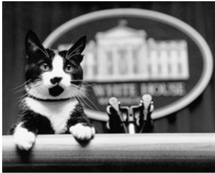
Socks briefing the press