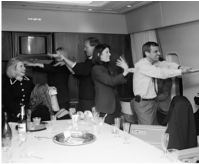
Celebrating our 1996 victory aboard Air Force One