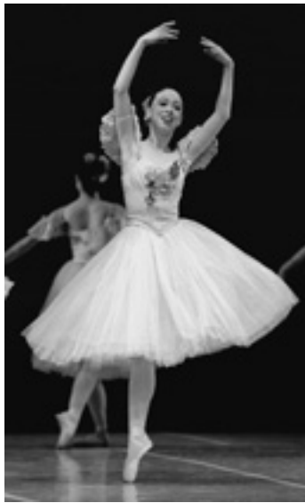
Chelsea in The Nutcracker