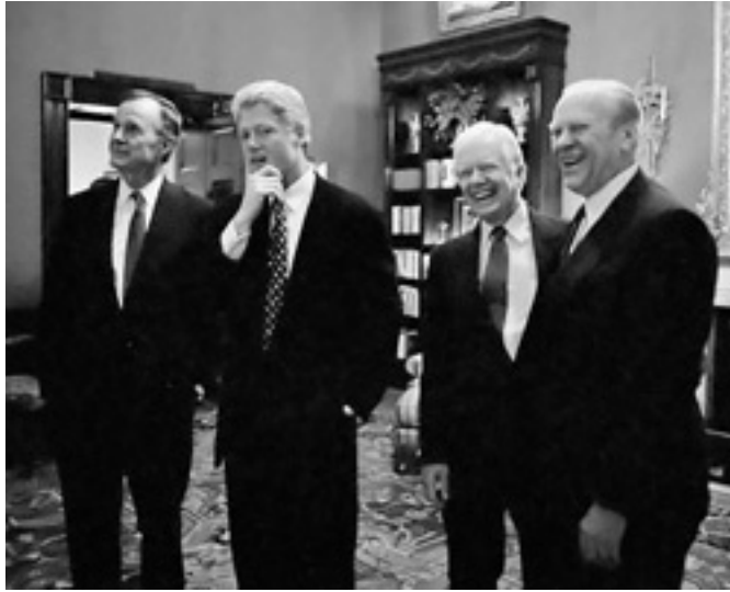
In the residence private study, with Presidents George Bush, Jimmy Carter, and Gerald Ford on the eve of the announcement of the campaign for NAFTA