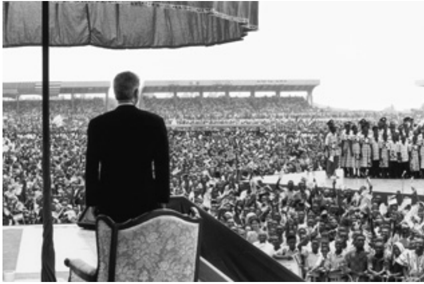
Addressing a crowd of more than 500,000 in Independence Square, Ghana