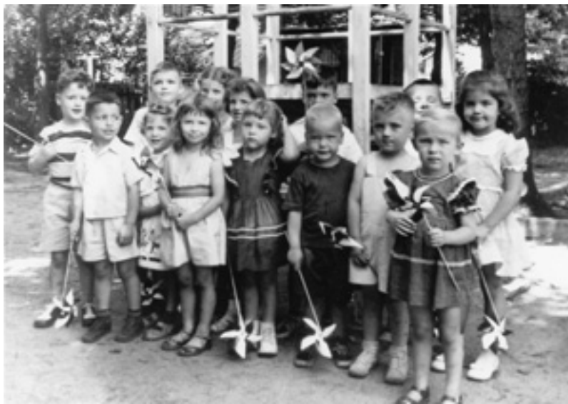
Miss Marie Purkins' School for Little Folks in Hope. I'm at the far left, with Vince Foster next to me and Mack McLarty in the back row.