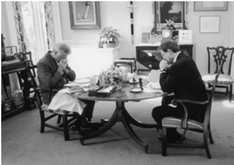
Al and I praying at our weekly lunch