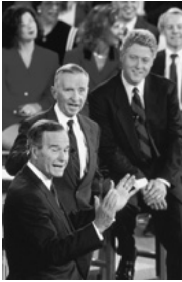
President George H. W. Bush, Ross Perot, and I at the University of Richmond debate