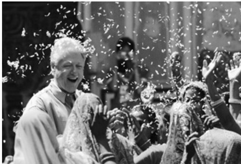
Being showered with rose petals in a traditional ceremony in Naila, India