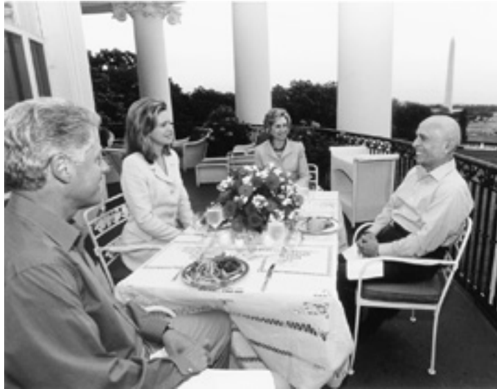
Our friends Queen Noor and King Hussein join Hillary and me on the Truman Balcony.