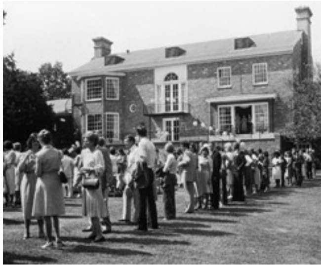
Parents and students at the Governor's Mansion for High School Honors Day, celebrating the valedictorians and salutarians of Arkansas high schools