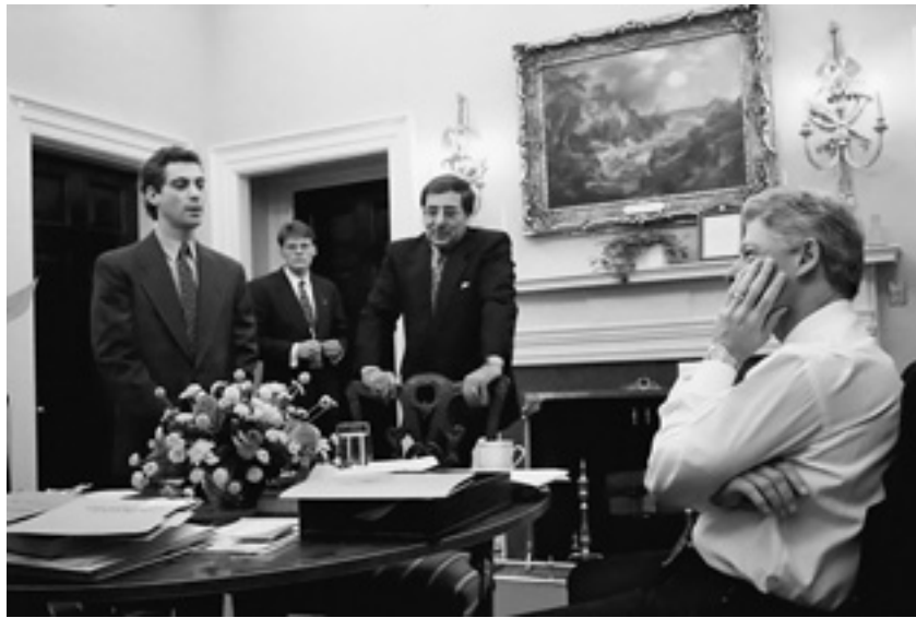
Rahm Emanuel and Leon Panetta brief me in the Oval Office dining room.