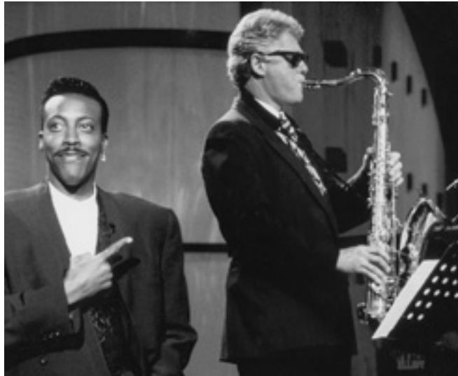
The Arsenio Hall Show