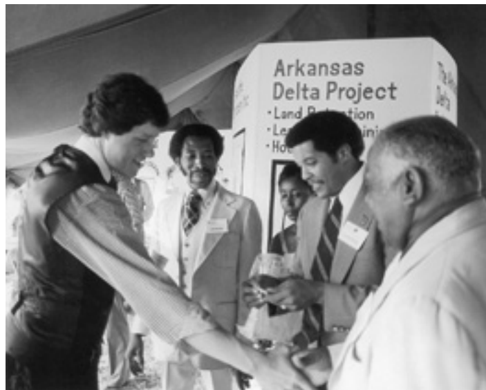
Visiting Arkansas Delta Project leaders, with whom I worked to bring economic development to their region