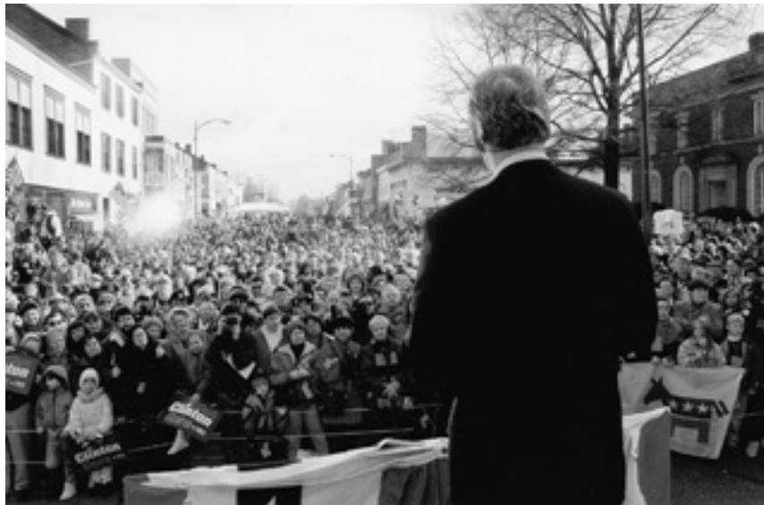
Tipper Gore took this picture of the huge crowd in Keene, New Hampshire