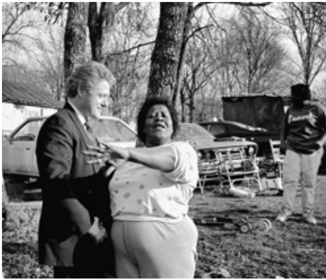
Campaigning in Stone Mountain, Georgia