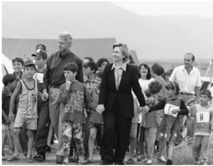
Hillary and I touring a Kosovar refugee camp in Macedonia