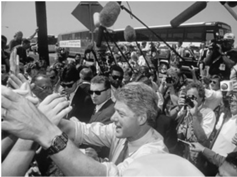
The bus tour