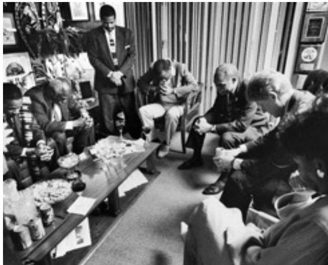
At a prayer meeting after the Los Angeles riots