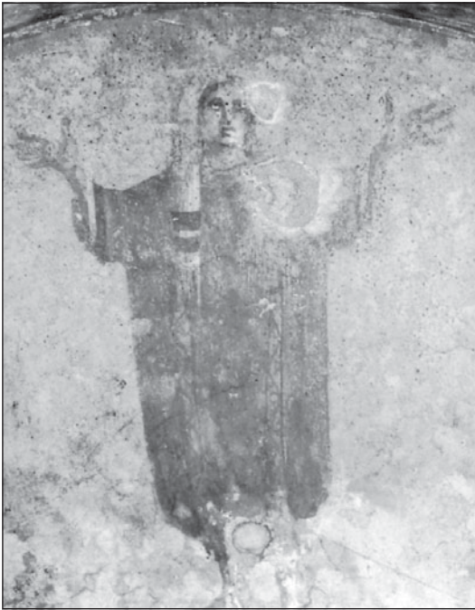
Painting of a Christian woman in prayer, from the Catacomb of Priscilla.