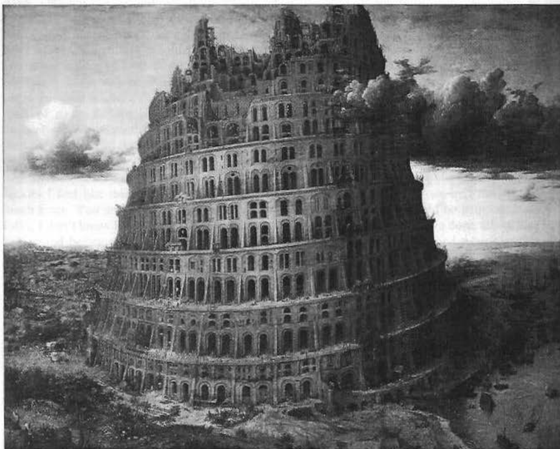
(Tower of Babel by Pieter Bruegel the Elder)