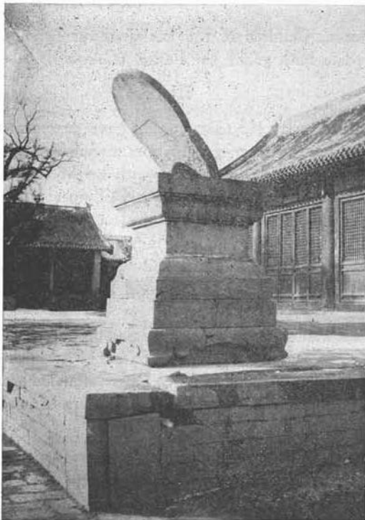
SUNDIAL, ROYAL OBSERVATORY, PEKIN

A dial constructed upon this principle, with the XII-o'clock and minute divisions displaced with the distance from a meridian, these other five divisions slightly curved to the analemma, crossing centric circles, southerly face sundial--which