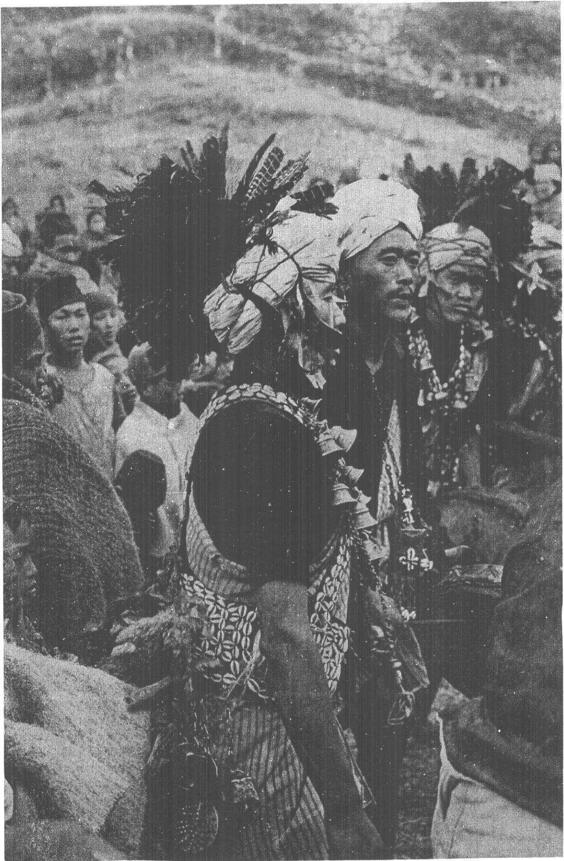
A shaman in full costume, standing with his master.