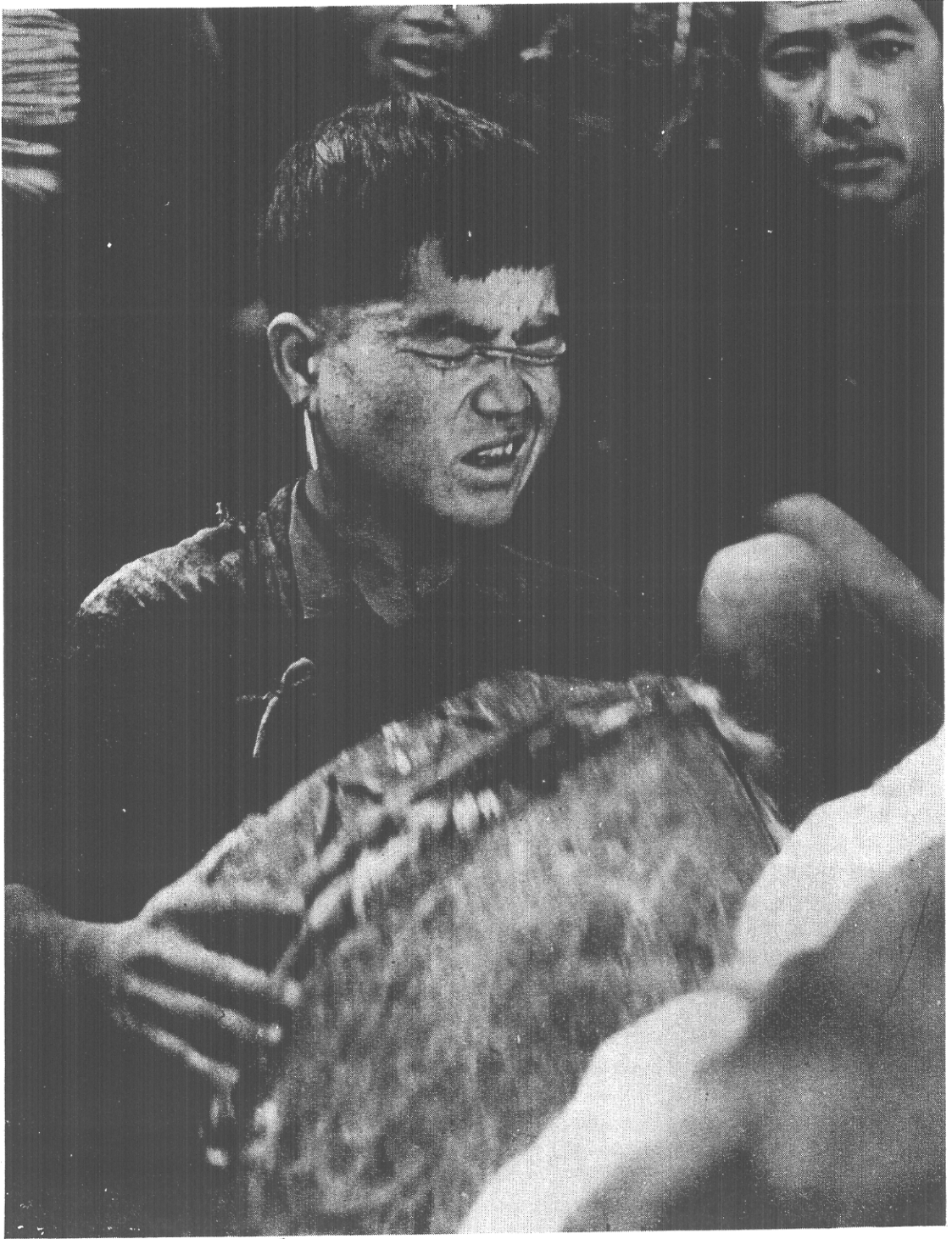
A young candidate being "attacked" by a spirit in the thumbu ceremony.