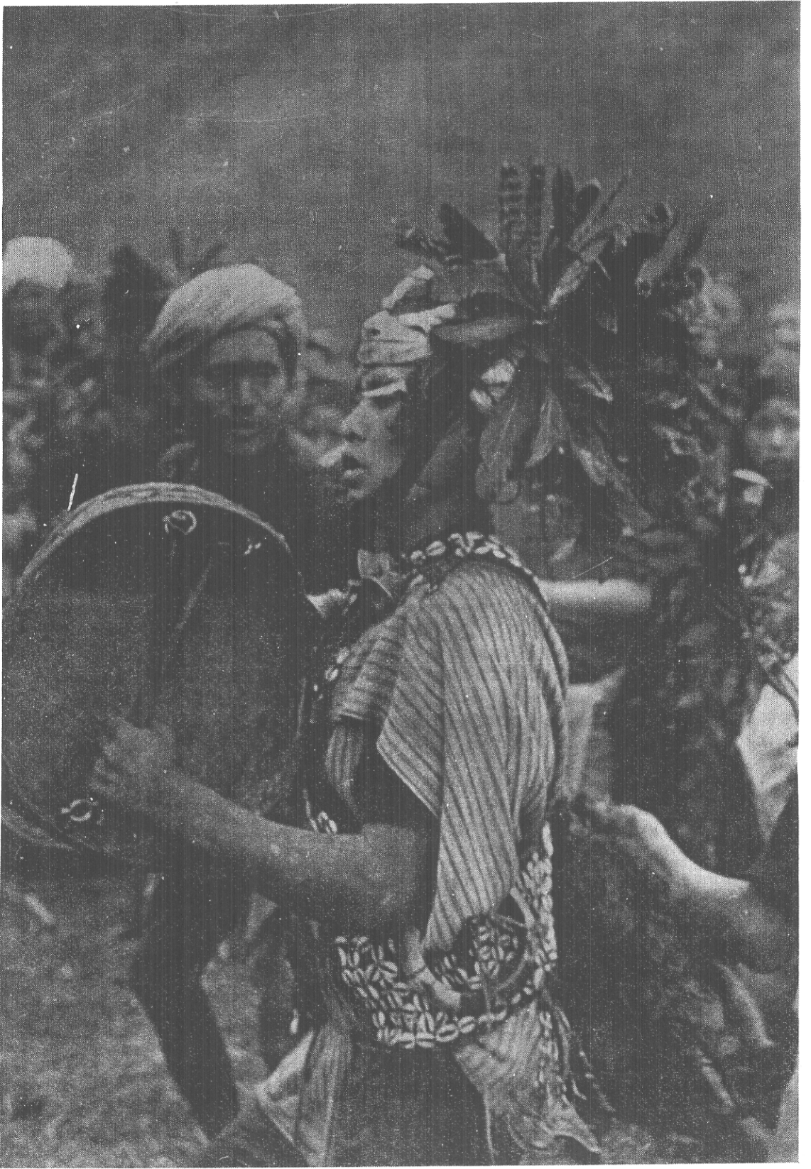
A shaman dancing - recalling the soul.