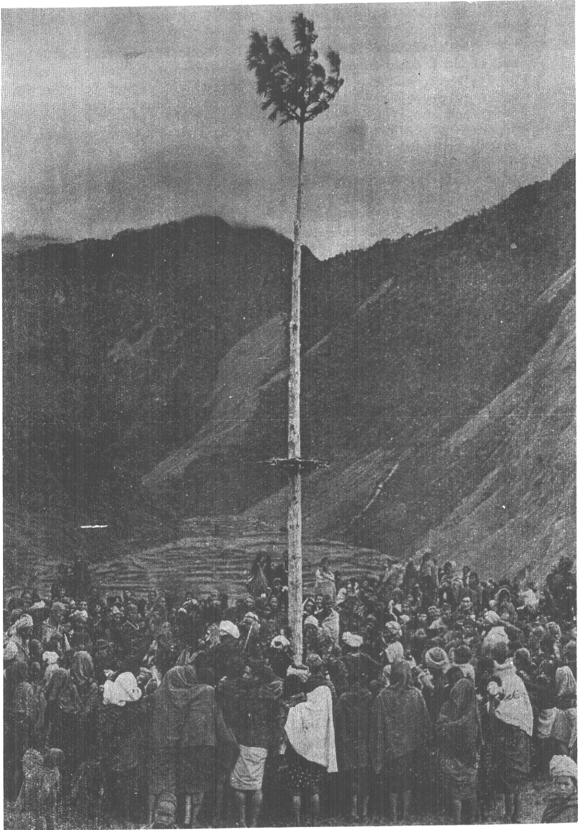
The suwā - the tree upon which Puran Tsan's descendants are 'born'.