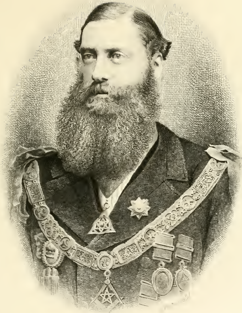
FRANCIS PICKENS THE EARL OF PAISLEY DEPUTY CHIEF OF THE UNITED STATES ARMY