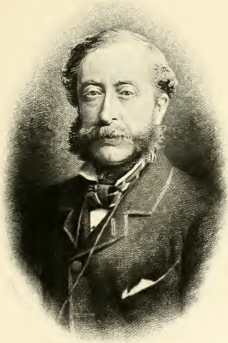
RIGHT HONOURABLE THE EARL OF CARNARVON PRO GRAND MASTER OF THE UNITED GRAND LODGE OF ENGLAND