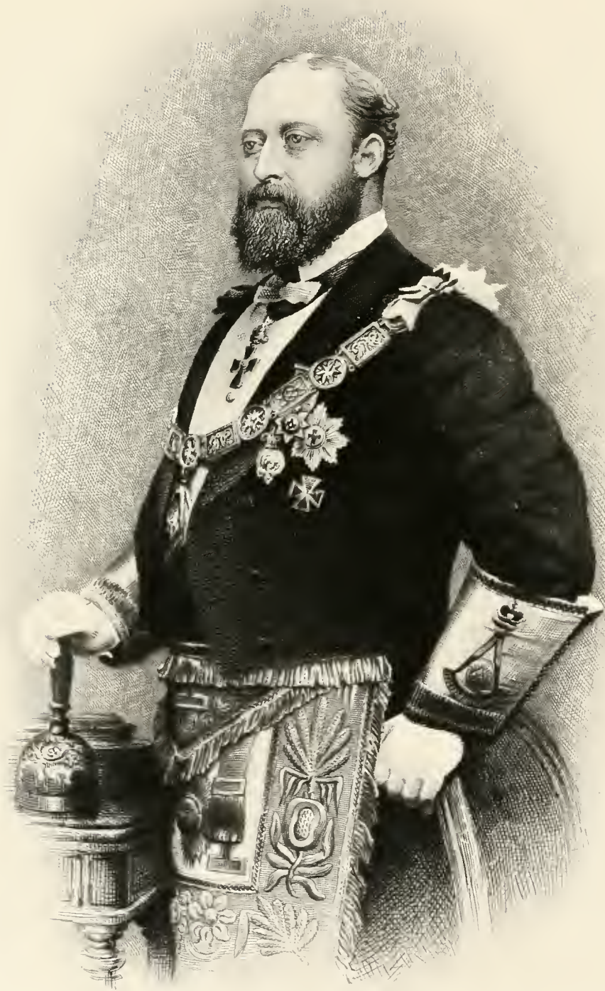
H. R. H. THE PRINCE OF WALES, K. G. MEMBER OF THE HONORABLE SOCIETY OF THE LODGE OF ENGLAND