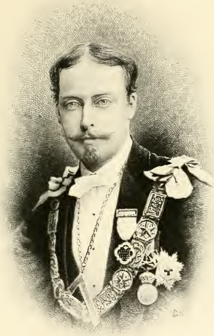
H. H. THE DUKE OF ALBANY, K. G.