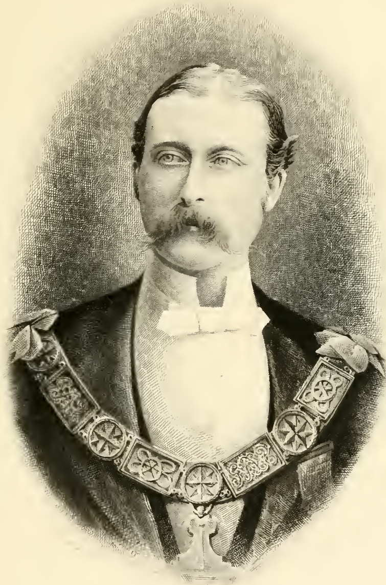
H. H. THE DUKE OF MONTAGUTE, &c.