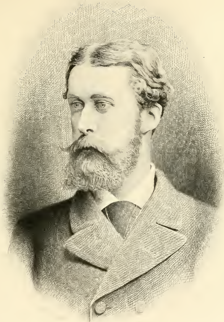
RIGHT HONORABLE THE EARL FERRERS PROVINCIAL GRAND MASTER OF LEICESTERSHIRE