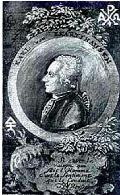
Karl von Eckhartshausen (1752-1803)

Published in six parts in the periodical "The Unknown World", 1895.