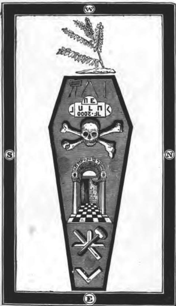
THE MASTER MASON.