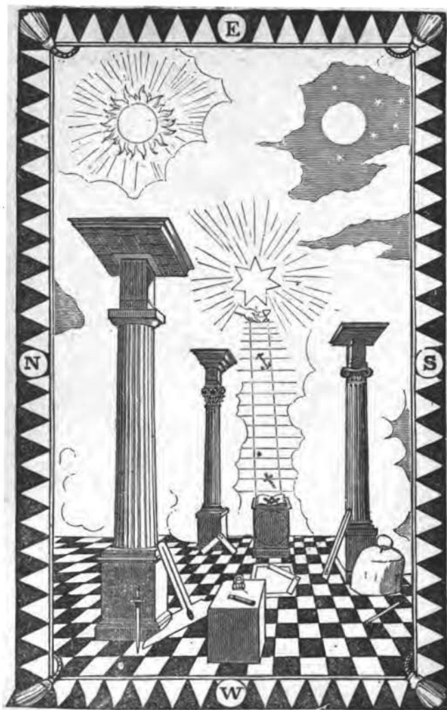
THE ENTERED APPRENTICE.