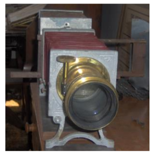
54. The stereopticon.

Armed with tacks, a hammer and a big armful of 8-inch by 10-inch advertising cards, he walked miles each day to tack up the cards where they would catch the eye of the public. He wrote his own newspaper reviews and took them to publishers, who were sometimes very prejudiced against the new Teachings, but his attractive personality often overcame their aversion and they would finally give him a whole page.