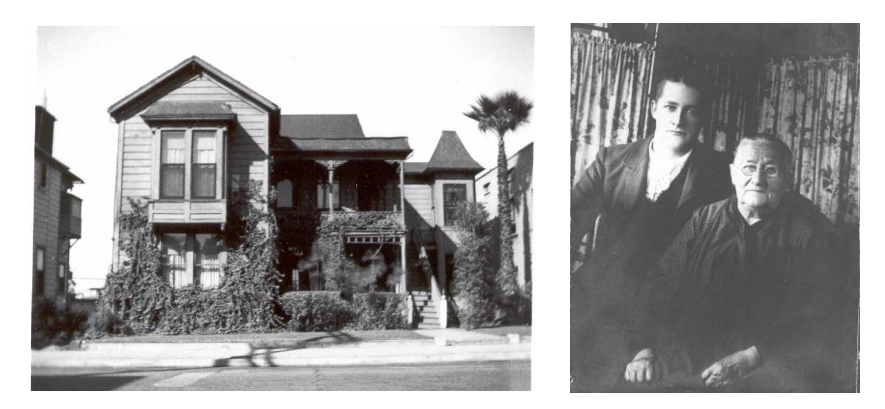
47. Foss home in Los Angeles.

our ten dollars was a nice time and a list of planets showing their respective divisions into triplicities and quadruplicities'."<sup>123</sup>