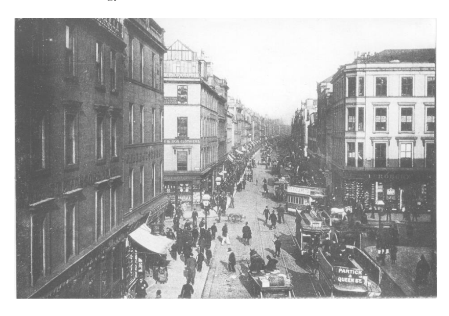
35. Glasgow, Argyle Street, about 1880.

stepped ashore about 1884.99 He found a job as a master to bacconist and resided at 438 Argyle Street. ^{100}\,