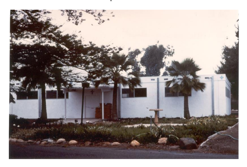
100. The Shipping Department, 1976.

"The city has requested that we install six inch water mains to provide better fire protection. This, of course, we are happy to do. A new main entrance has also been decided upon.