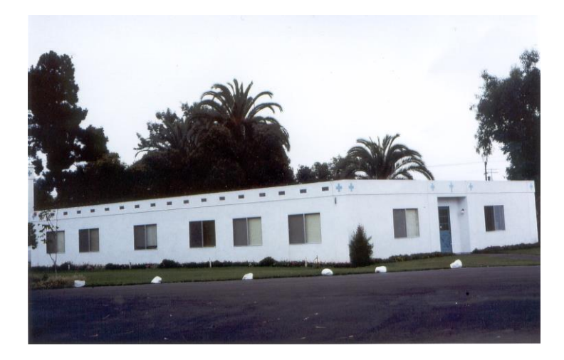
99. The New Administration Building, 1975.

"Every inch of the ground has been planned so that future development will be orderly and aesthetically pleasing. The plan will be implemented over the next ten to fifteen years.