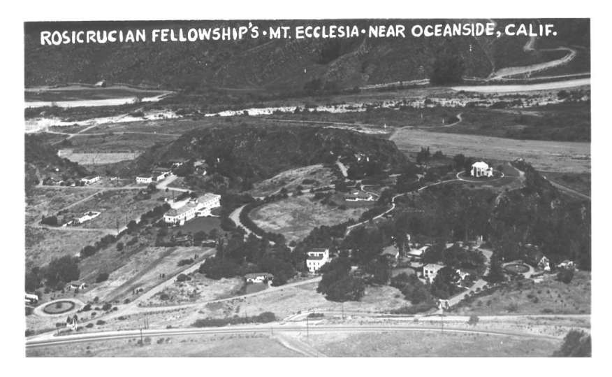
101. Aerial picture of Mount Ecclesia.

Mount Ecclesia lies about 3\frac{1}{2} km or 2\frac{1}{4} miles east of downtown Oceanside. From the train station one goes a couple of blocks to find Mission Avenue, which runs right past the Fellowship. In front of Headquarters is a split. The old original Mission Avenue is now called Amick Street. From the original main entrance, the road along the illuminated emblem, the Pro-Ecclesia and the Guest House. Beyond the Guest House, Temple Drive loops around by the Healing Department. Between Ecclesia Drive and Temple Drive, where cottages are clustered in a row, is Melody Lane. Max Heindel planted the pine tree opposite 10 and 12 in 1911.