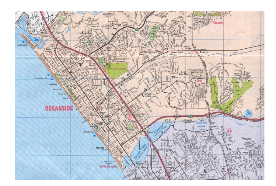
102. Map of Oceanside.

On the map of Oceanside, picture 95, you see a bold line near the top, running from left to right; that is highway 76. Mount Ecclesia is located north of that bend in Mission Avenue where the curve goes downward.