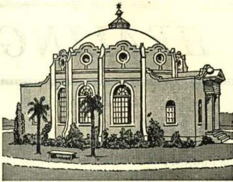
ROSICRUCIAN TEMPLE OF HEALING